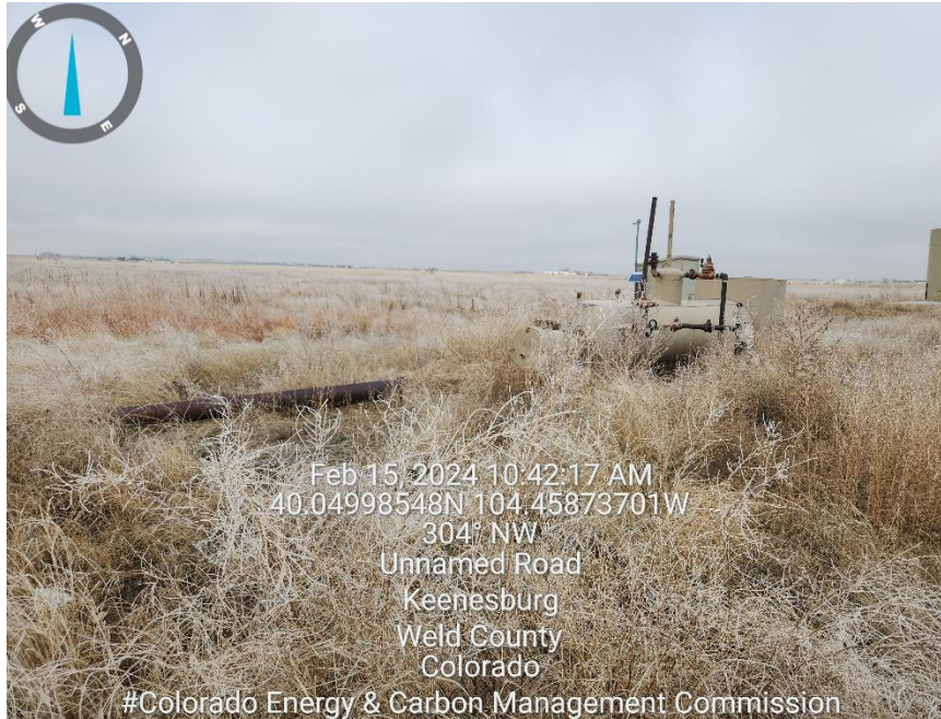
Photo 5 dead weeds, mechanical issue stack for separator not attached and on ground.