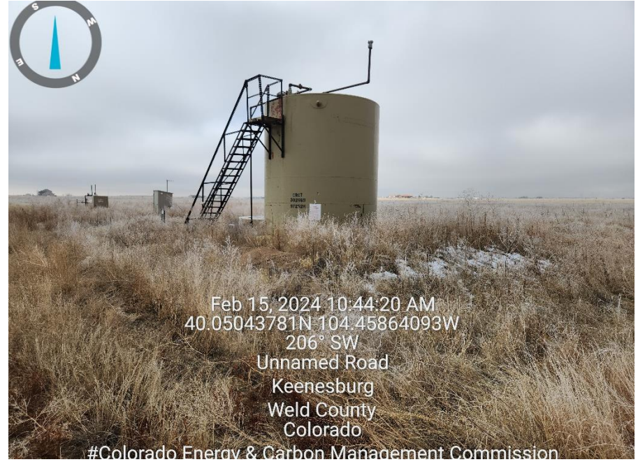
Photo10 Crude oil tank no NFPA or volume placards or sign. Dead weeds on location and inside tank containment.