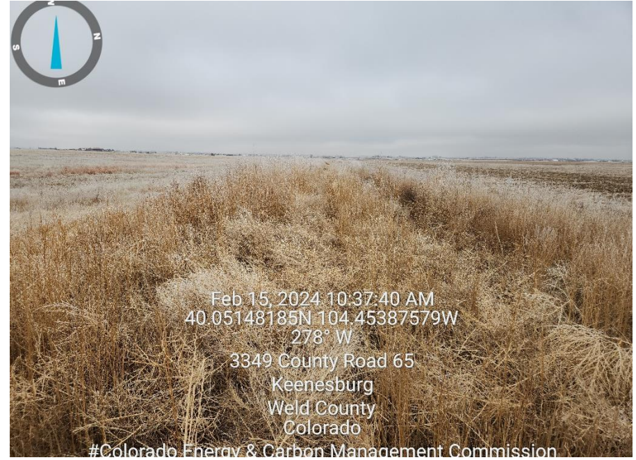
Photo 2 Access road completely Covered in dead vegetation.