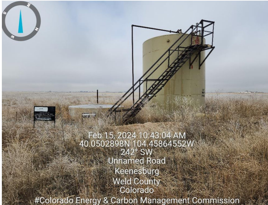
Photo 7 TNK BTRY Dead weeds, battery sign has wrong number,