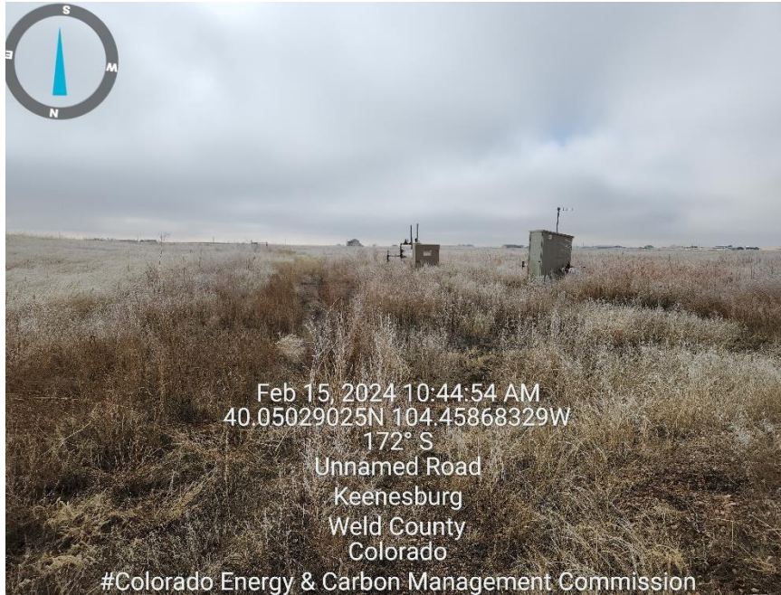
Photo 11 well site and facility completely covered in dead vegetation.