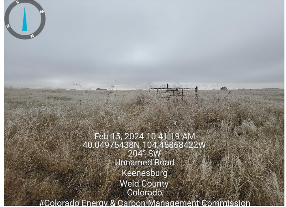
Photo 4 Well site completely covered in dead vegetation. Well sign has wrong location number says 33-17