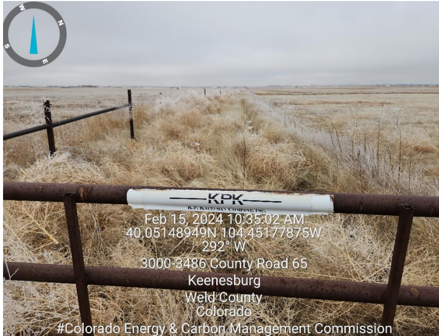
Photo 1 Access road completely Covered in dead vegetation.