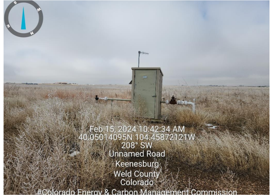
Photo 6 Dead weeds, Unused equipment meter house not connected on sales side of meter