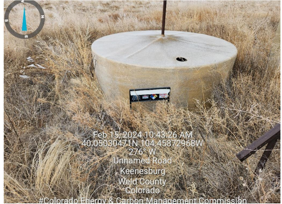
Photo 8 produced water tank has no volume sign open hole on top with no bird netting and dead weeds inside containment.