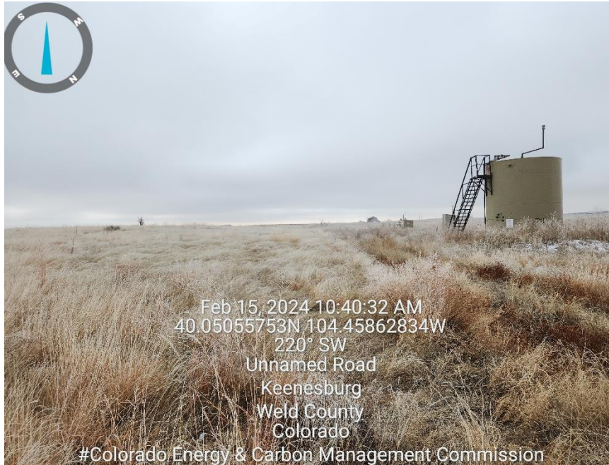
Photo 3 Loc pic Well site and Facility completely covered in dead vegetation.