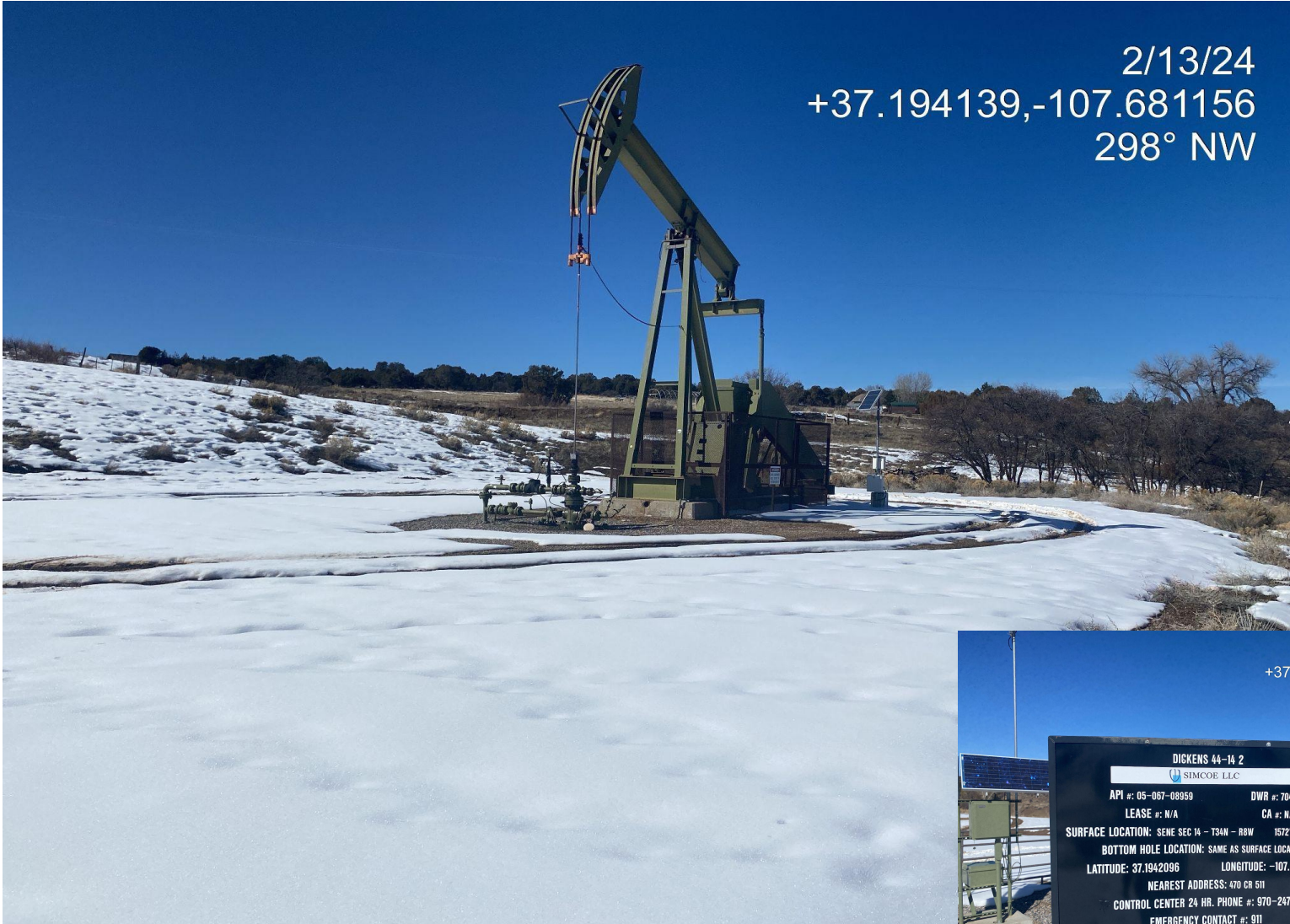
Photo 1. View of the disturbance from the entrance facing center.