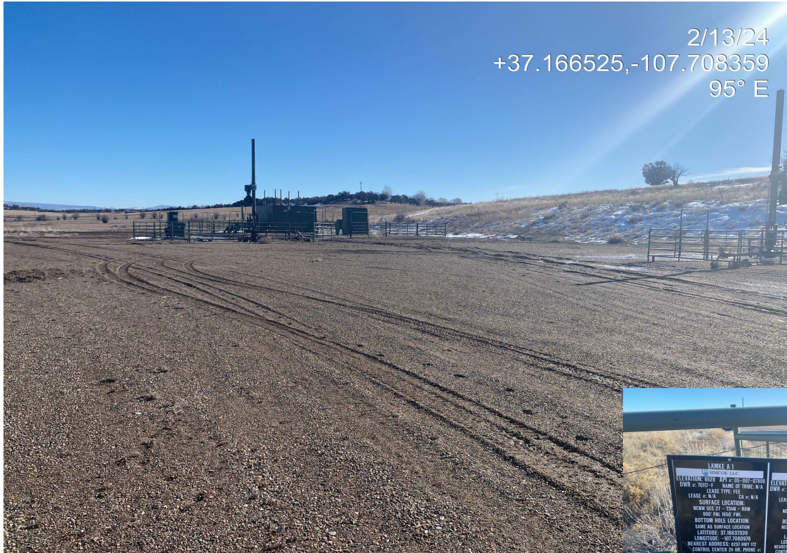
Photo 1. View of the disturbance from the entrance facing center.