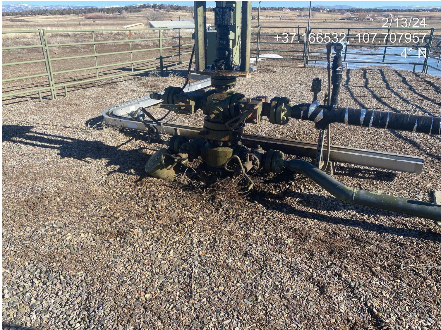
Photo 4. View of impacted material and weedy debris at well head A3.