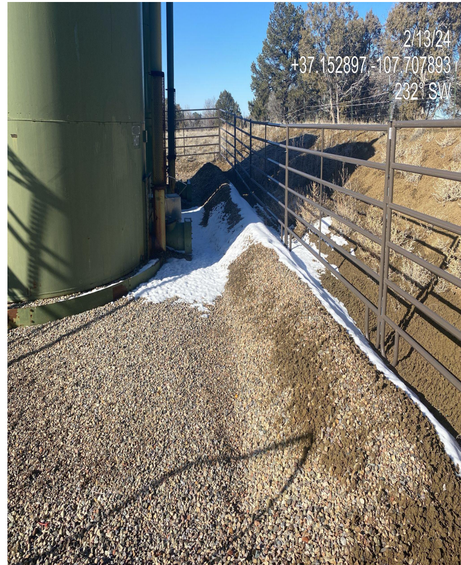
Photo 4. Produced water sign capacity and berm maintenance CA identified in previous inspection have both been addressed/resolved.