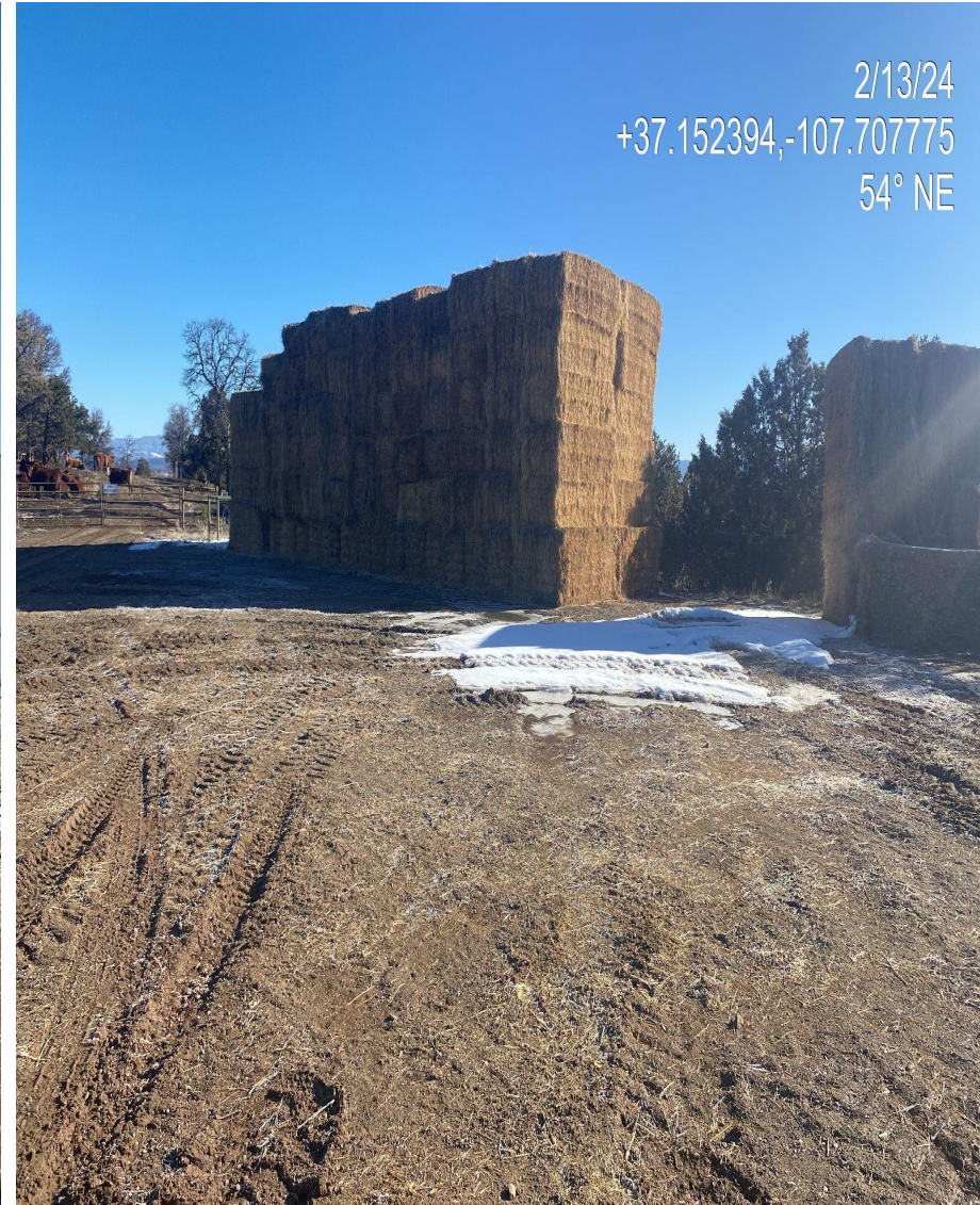
Photo 3. View of surface owner trailer and hay stored on the western and eastern edges of the disturbance.