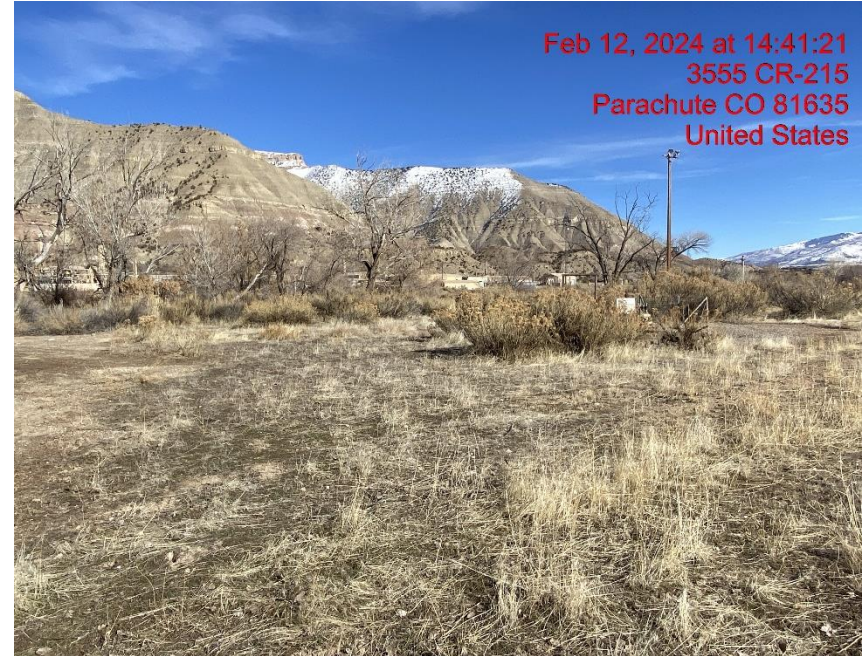
Location Entrance – Photo #09227