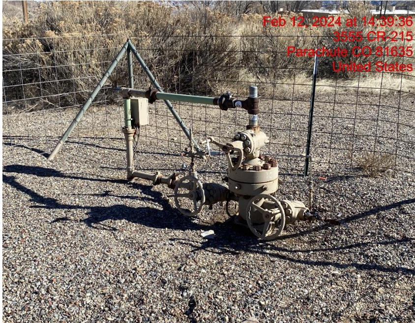
Wellhead – Photo #09221