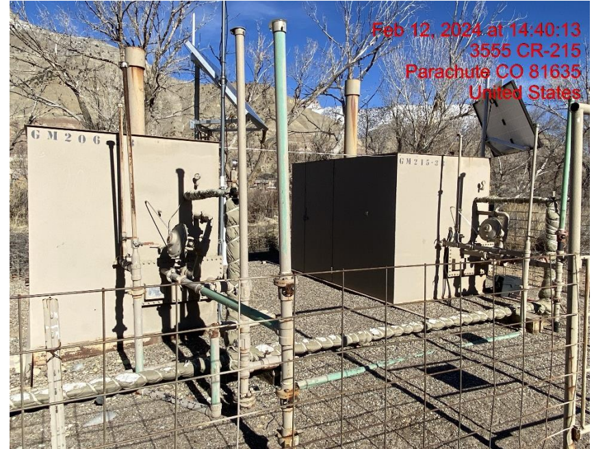
Separators – Photo #09223