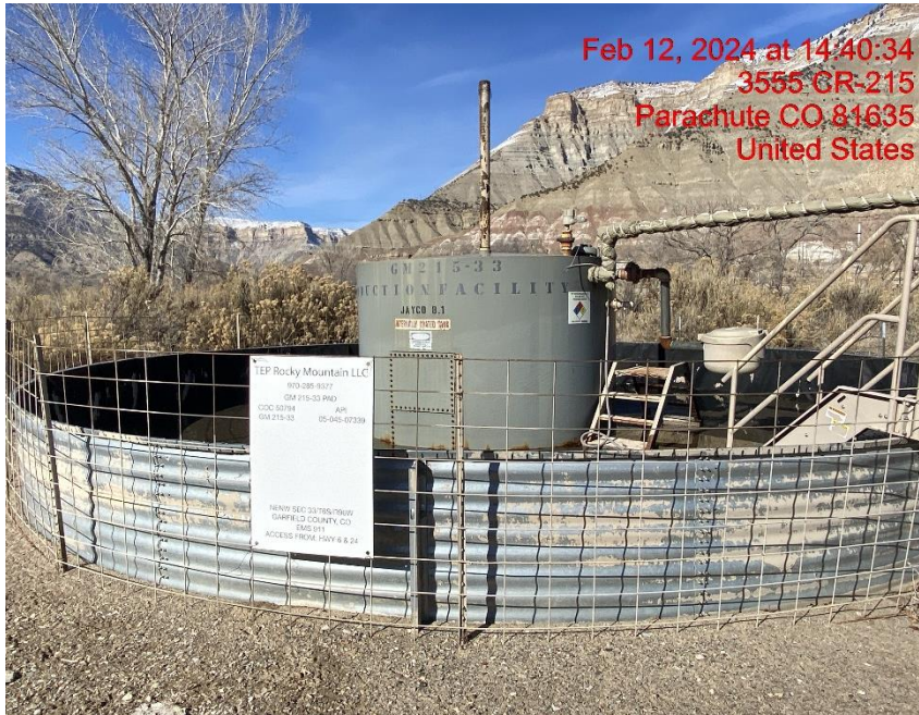
Tank Battery – Photo #09224