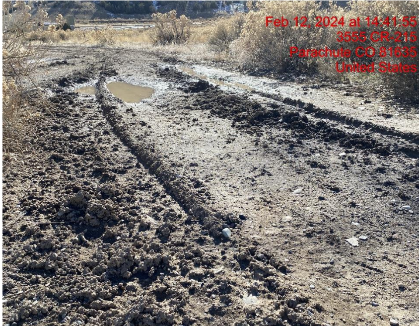
Lack of Stabilization – Photo #09228