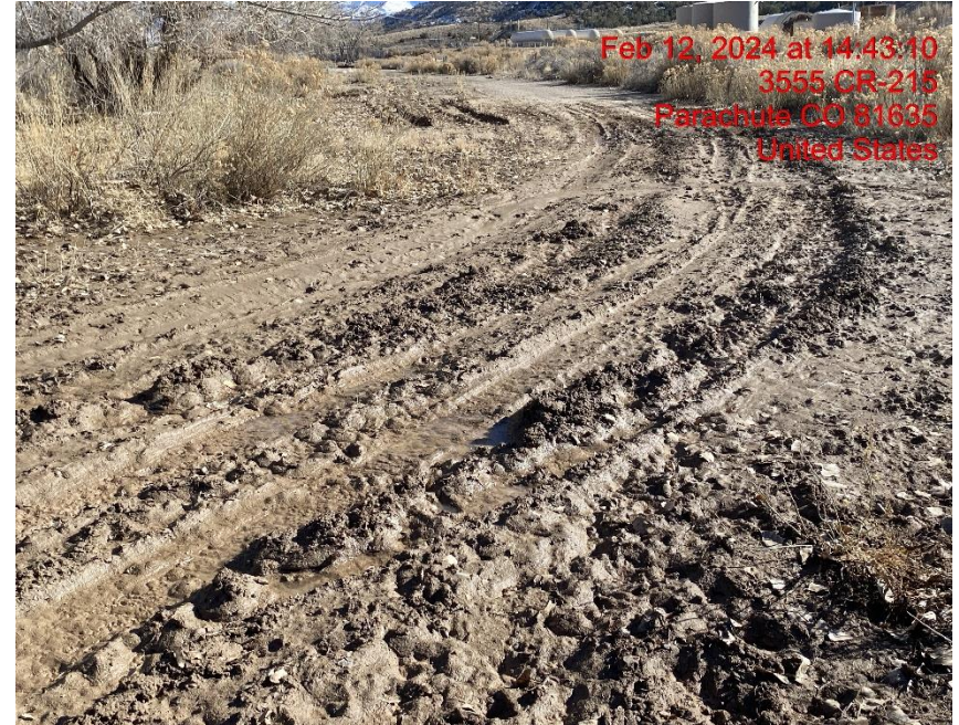
Lack of Stabilization/Insufficient Vehicle Tracking BMPs at Location Entrance/Exit – Photo #09229