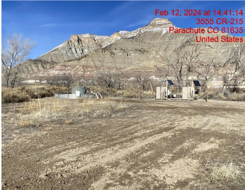
Location Entrance – Photo #09226