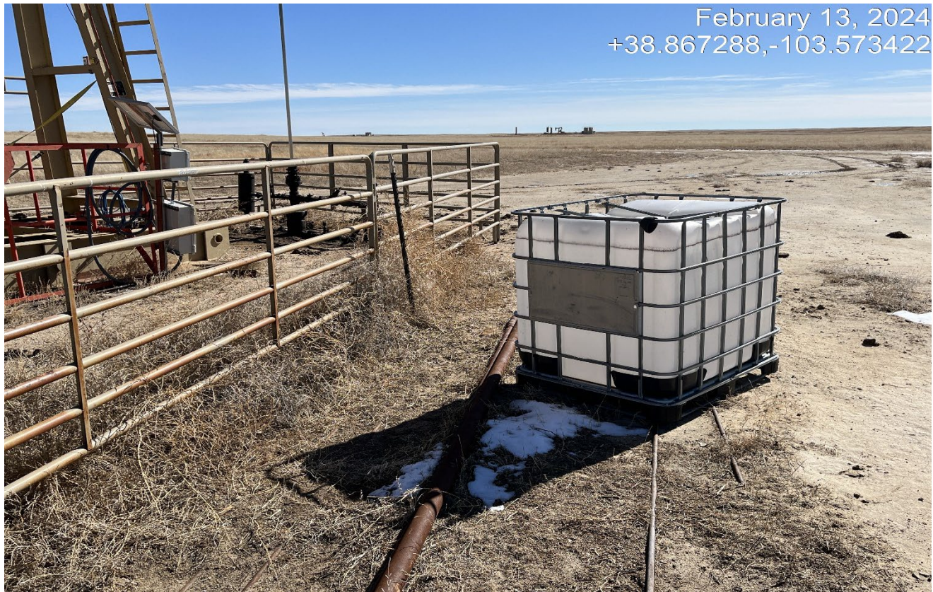
Photo 6. There is some pipe and an empty chemical container that needs to be removed..