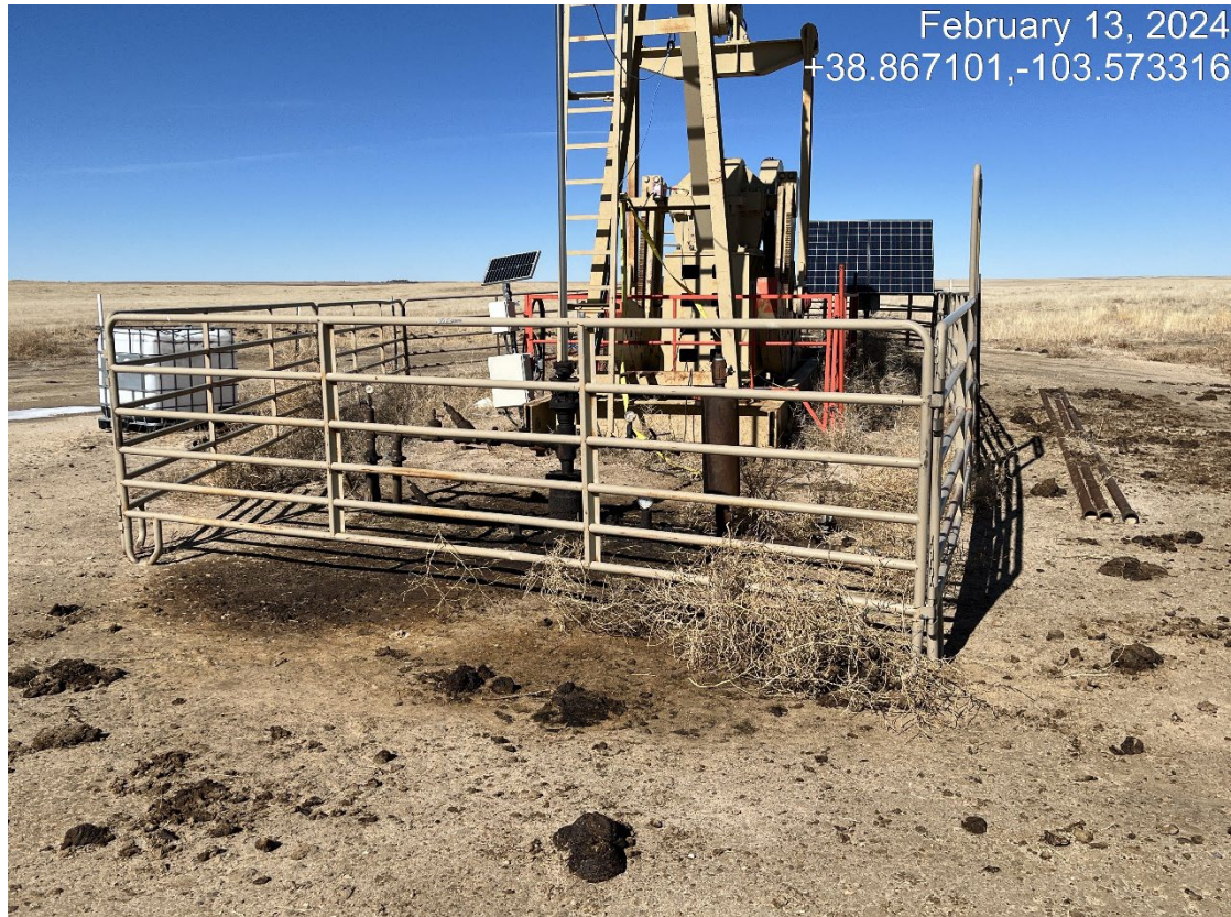
Photo 4. Facing toward the wellhed. There is oil stained soils at the wellhead that need to be cleaned up. There is inadequate signage at the well.