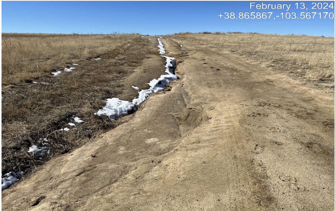
Photo 2. Facing west along the access road. There is erosion along the road from stormwater directed down the slope of the road.