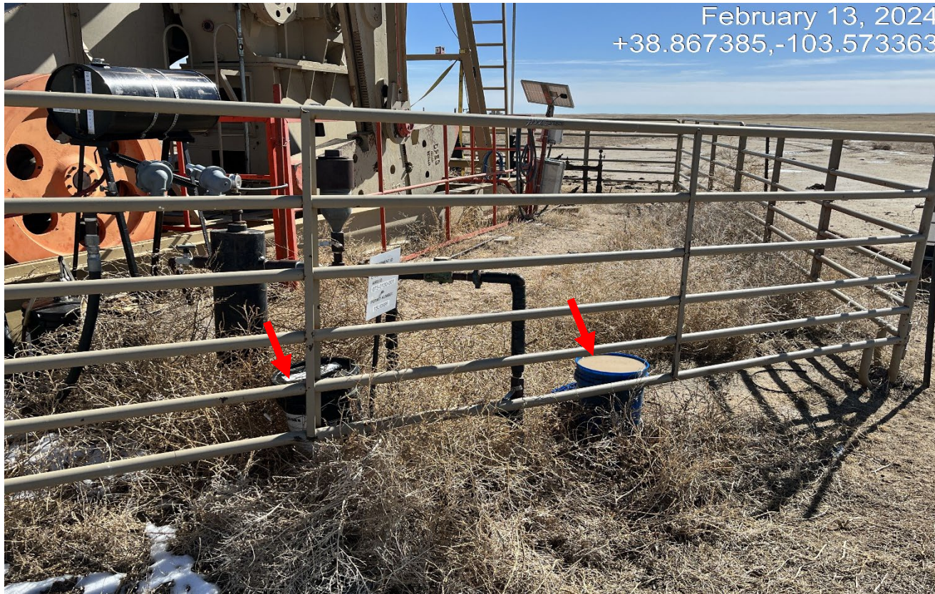
Photo 5. There are two 5 gallon containers one of which is full of oily liquid that has spilled onto the ground. There are undesirable weed debris around the equipment which is a fire hazard.