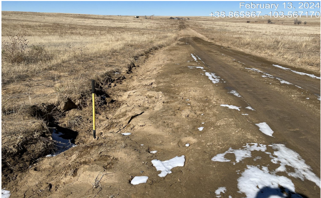
Photo 1. Facing north along the main road. There is erosion along the road sides and there are no BMP's installed to prevent further rerosion.