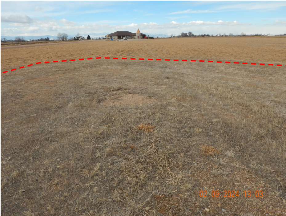
Photo 2. Photo taken from the central well location, facing West. See comments under Photo 1.