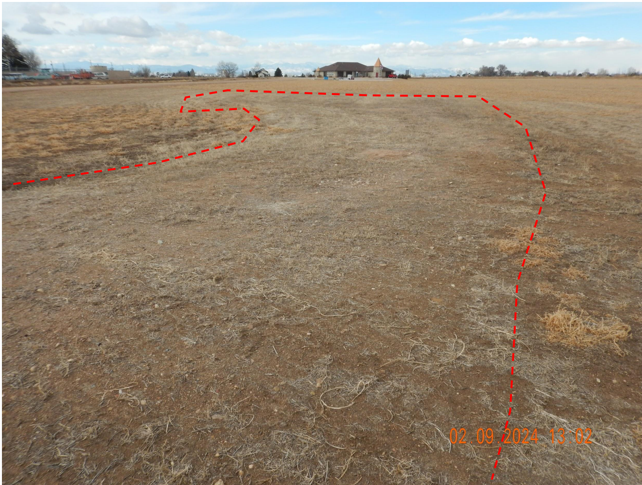
Photo 1. Photo taken from the eastern well location, facing West. Photo illustrates gravel remains, well location has not been contoured and there is no crop growth. Reference area crop is alfalfa.