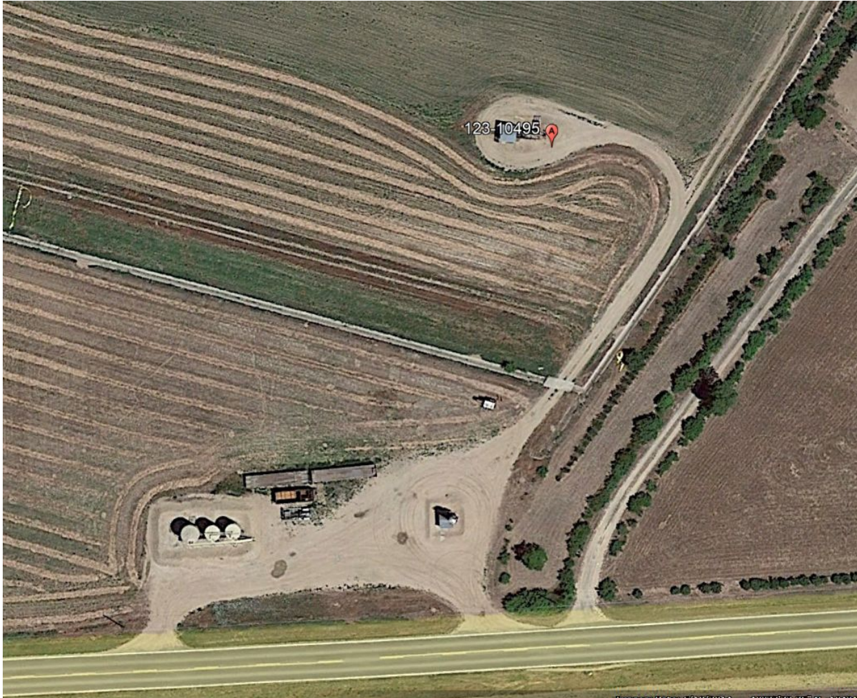
Photo 4. Google Earth aerial imagery taken 6/19/2014 illustrating the well location and tank battery location during active operations.