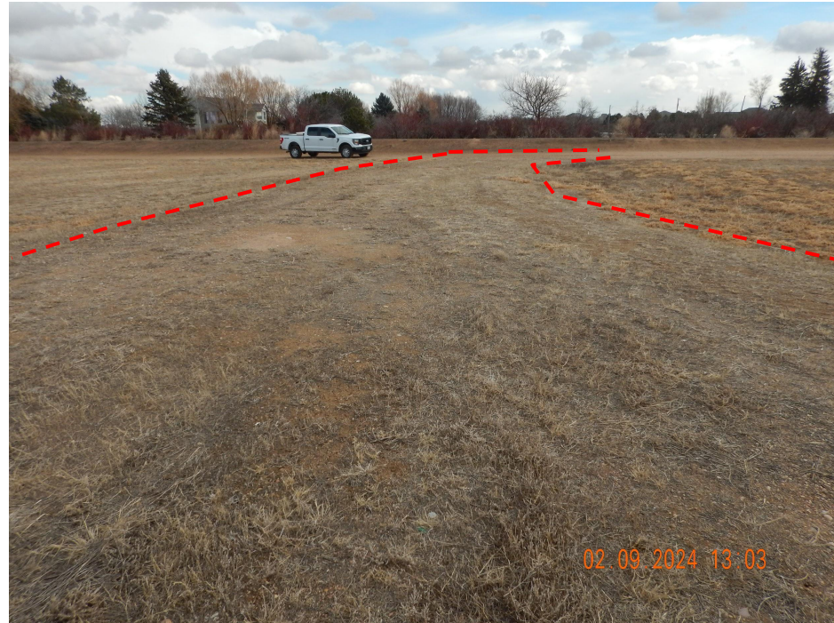
Photo 3. Photo taken from the central well location, facing East. See comments under Photo 1.