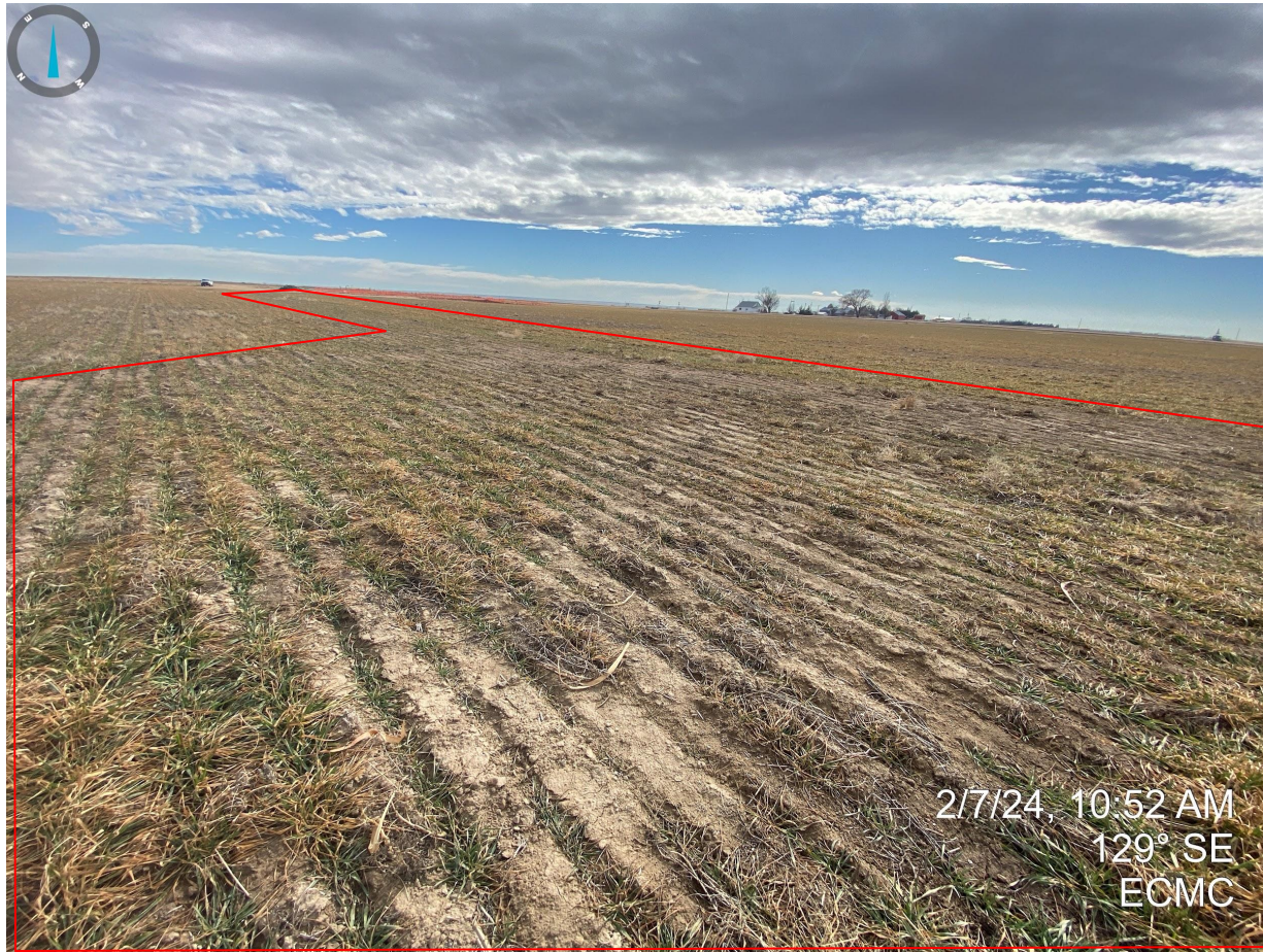
Photo 10. Taken from the approximate center of the former wellhead location, facing southeast. See comments in Photo 9.