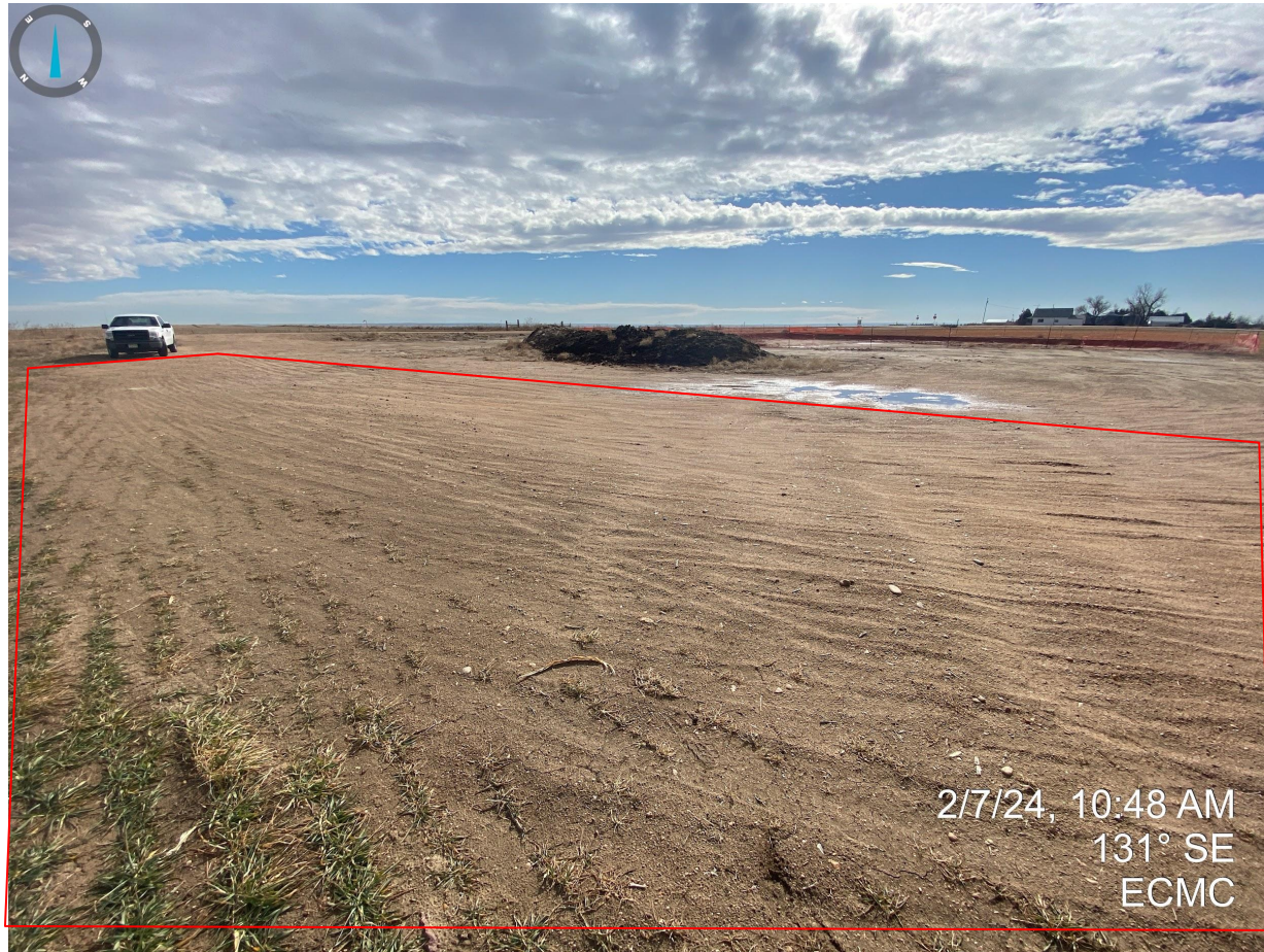
Photo 4. Taken from the northern portion of the former production areas. Photo illustrates the former productions areas that have not been reclaimed, and are not part of active remediation.