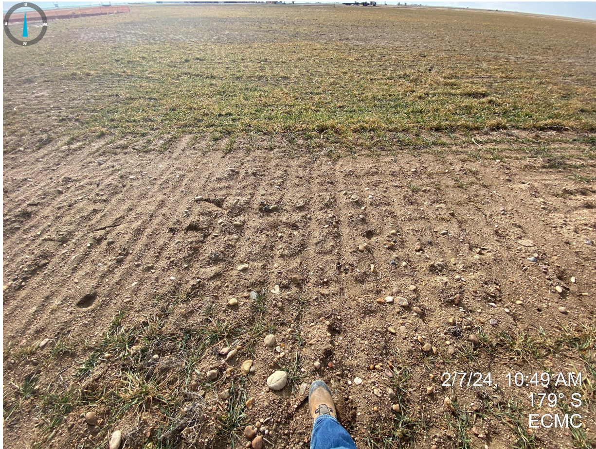
Photo 8. Close up of road base/gravel on the former access road.