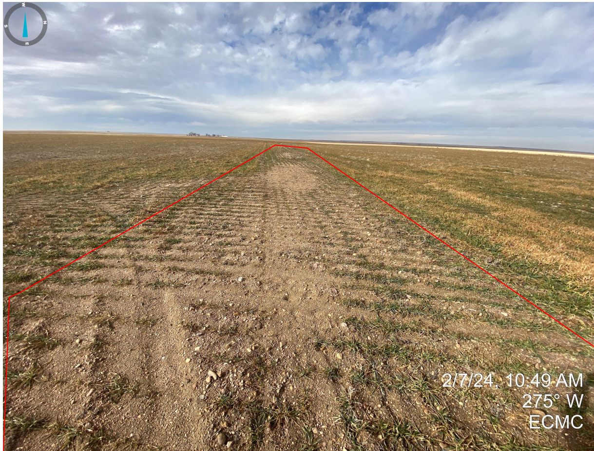
Photo 7. Taken halfway between the former production areas and the wellhead location. See comments in Photo 5.