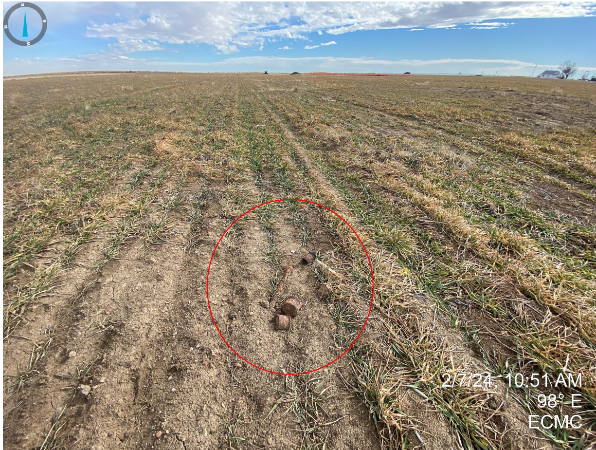
Photo 11. Taken from the northern portion of the former wellhead location. During this inspection, Staff observed debris located throughout the former location. Staff placed debris in a pile for easy identification and removal.