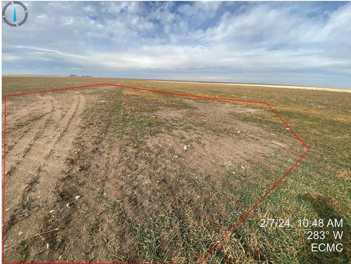
Photo 6. Close up of road base/gravel on the former access road, northwest of the former production areas along the access road.