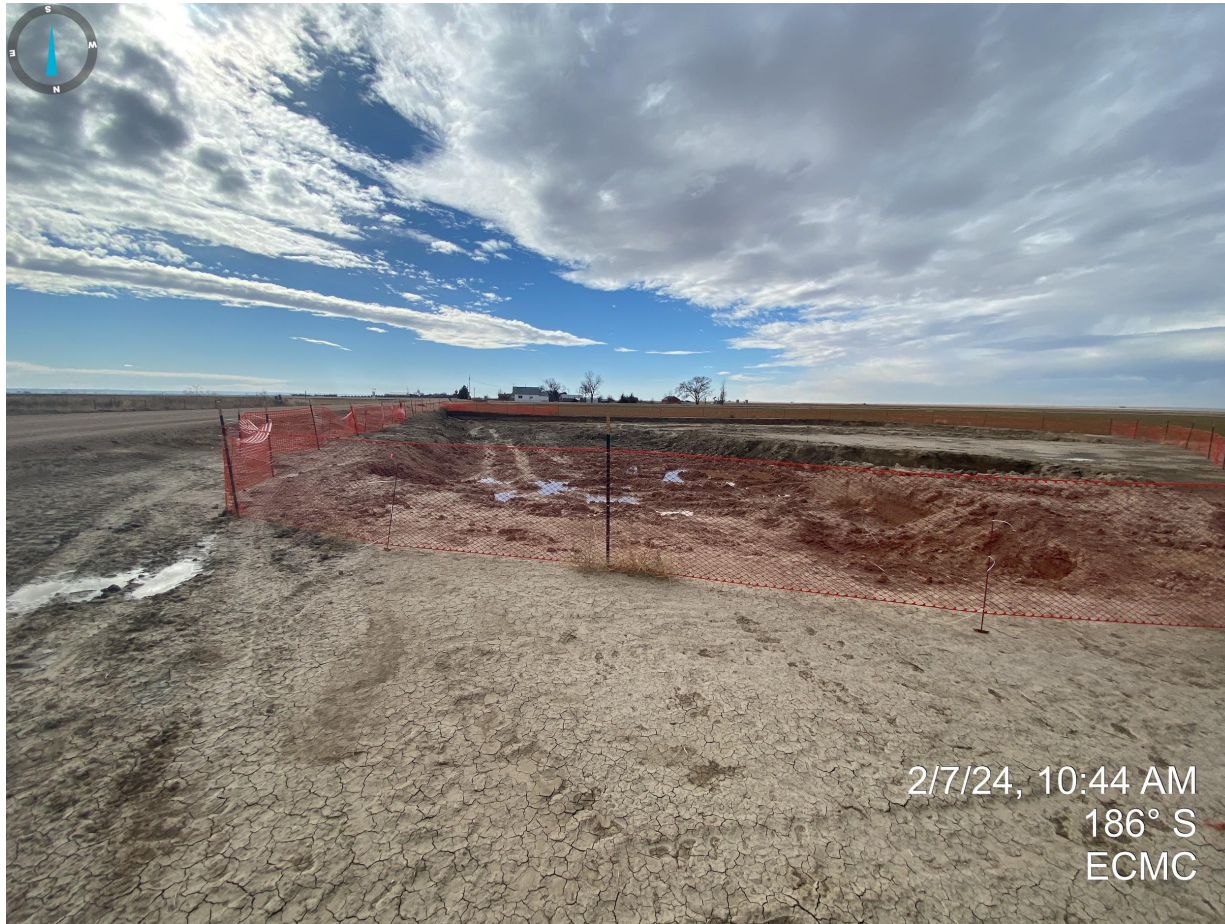
Photo 1. Taken from northeast corner of open excavation. Construction fencing has been installed around the sample holes and excavated area.