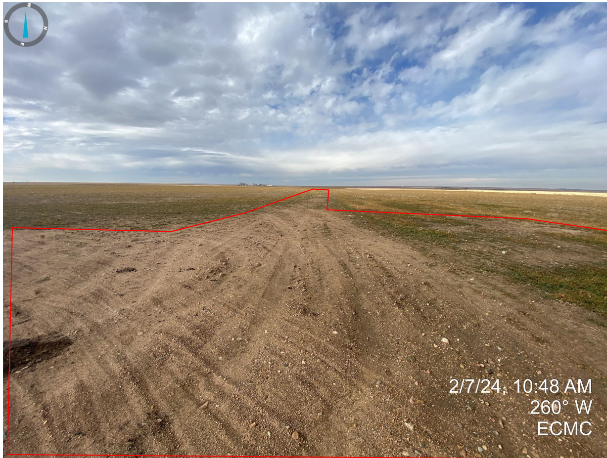
Photo 5. Taken north of the former production areas. Photo illustrates that road base/gravel remains throughout the northern portion of the production areas and along the former access road to the wellhead. Final reclamation activities are required.