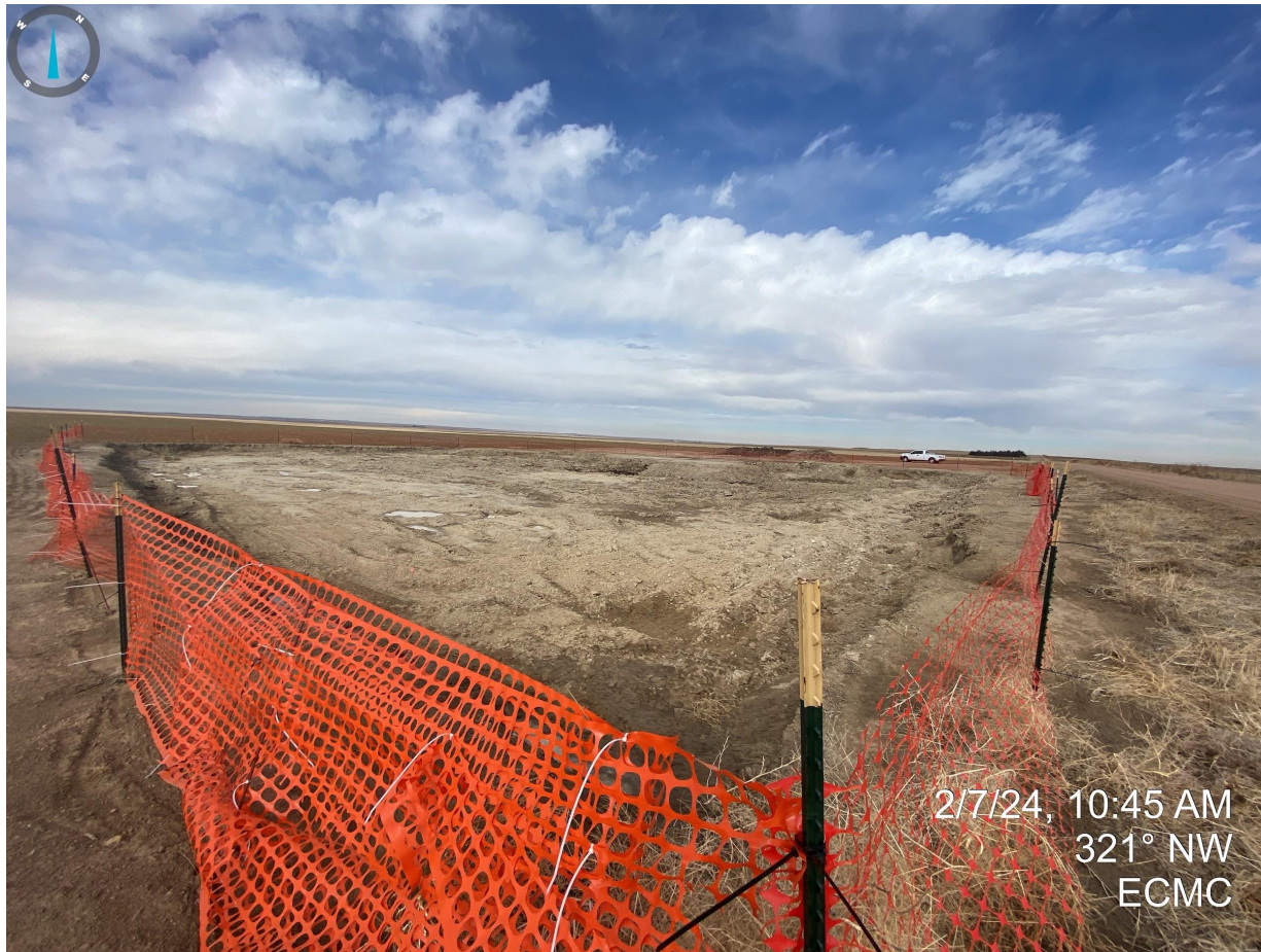
Photo 2. Southeast corner of the open excavation; see comments in Photo 1.