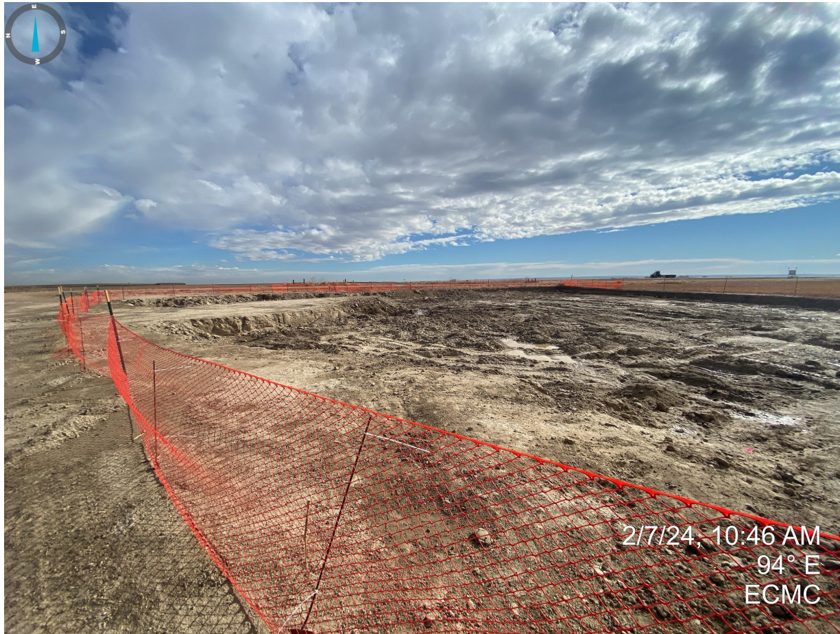
Photo 3. Southwest corner of the open excavation; see comments in Photo 1.