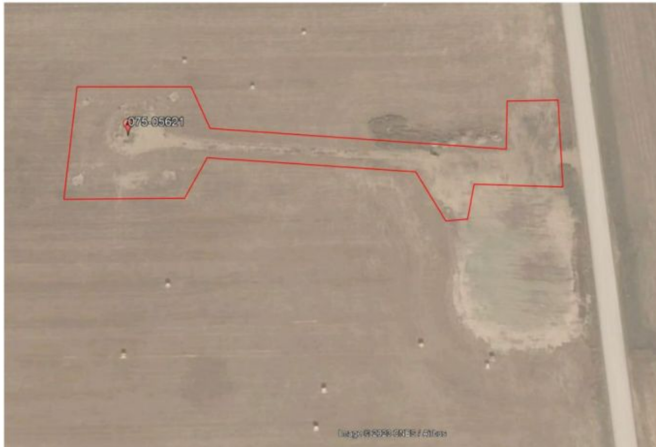
Photo 12. Google Earth aerial imagery (circa 10/2020) illustrating red outline of former access road, well location, and production area disturbances that will require final reclamation activities ASAP. Active remediation should not preclude the commencement of final reclamation activities on the above identified areas. Final reclamation should have been completed by 07/22/2019, per 1004 Rules.