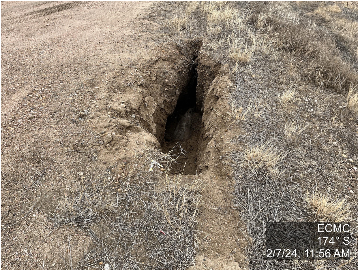
Photo 7. The photo was taken at the tank battery entrance facing South. The photo illustrates subsidence at the entrance.