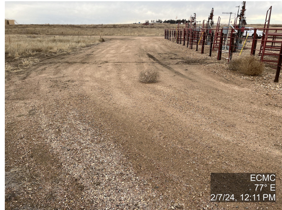
Photo 6. The photo was taken at the Western wellhead group facing East. The photo illustrates the working pad for the group of 4 wellheads.