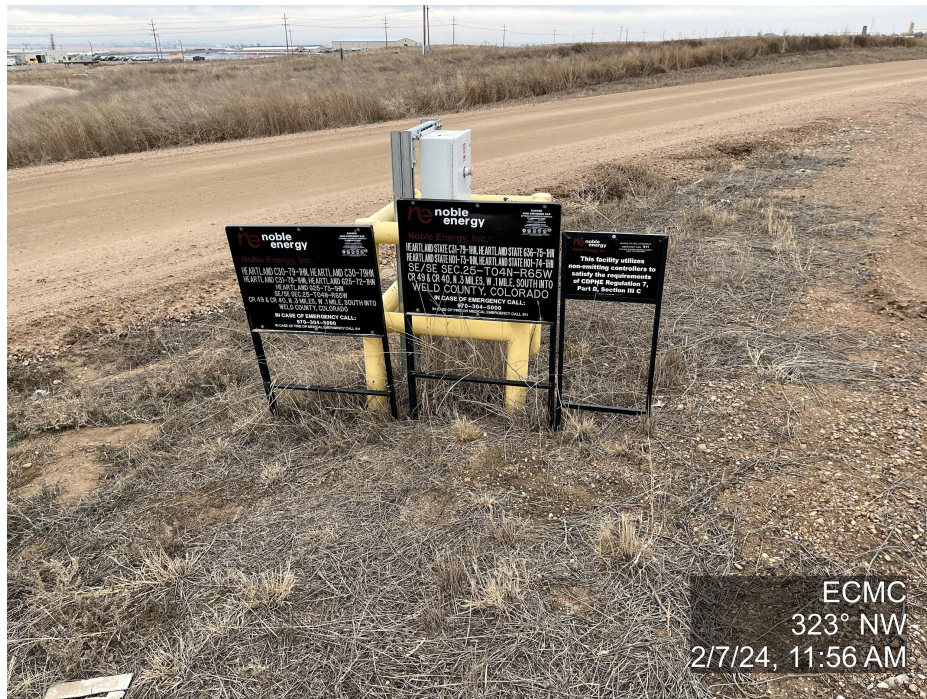
Photo 1. The photo was taken at the location entrance facing Northwest. The photo illustrates the location operator signs.