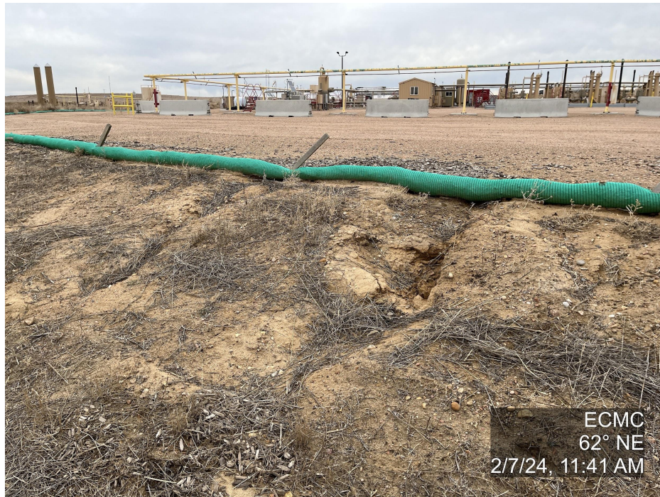
Photo 3. The photo was taken at the Northwest corner of the tank battery location facing Northeast. The photo illustrates some rilling along the working pad into the interim reclaim areas due to the filter wattle not being properly installed. Stakes were not driven all the way into the soil below.