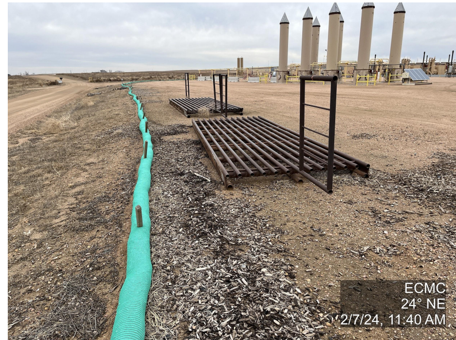
Photo 2. The photo was taken at the tank battery location facing Northeast. The photo illustrates cattle guards being stored on location.