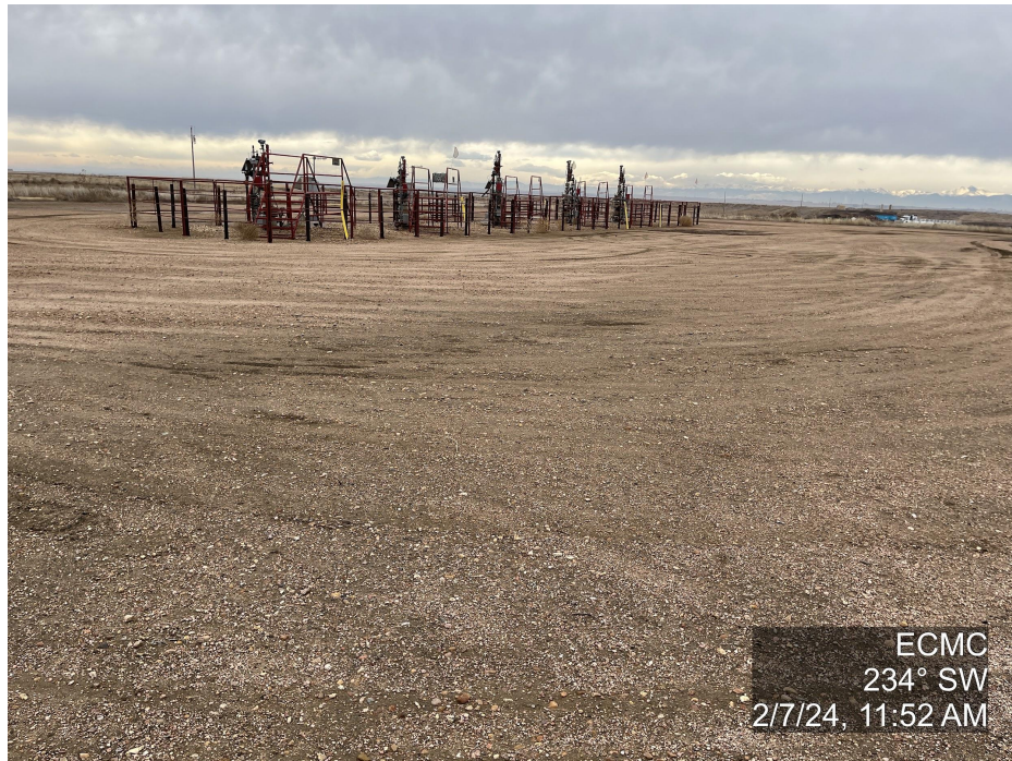
Photo 5. The photo was taken at the Eastern wellhead group facing Southwest. The photo illustrates the working pad for the group of 5 wellheads.