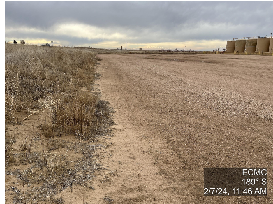
Photo 4. The photo was taken at the tank battery location facing South. The photo illustrates the boundary of the working pad surface and illustrates how the interim is dominated by Cereal rye and Russian thistle.

Photo 3. The photo was taken at the Northwest corner of the tank battery location facing Northeast. The photo illustrates some rilling along the working pad into the interim reclaim areas due to the filter wattle not being properly installed. Stakes were not driven all the way into the soil below.