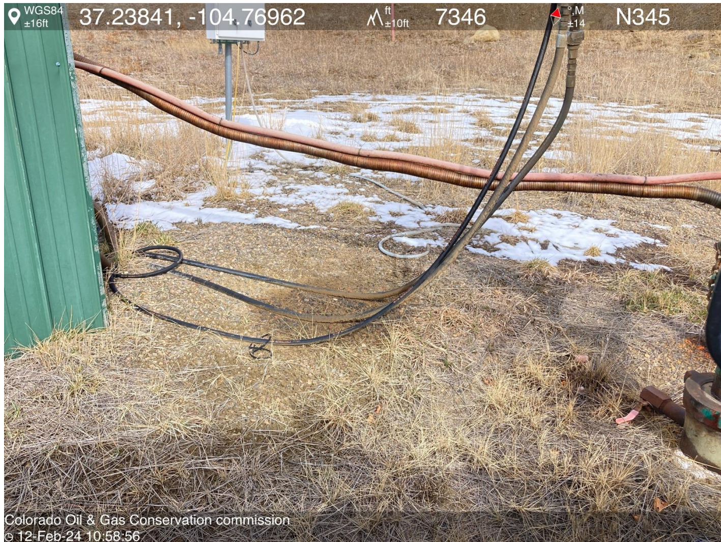
PHOTO 4: AREA OD IMPACTED OIL NEER WELLHEAD APPEARS TO BE LEAKING HYDRUALIC HOSES. Impacted soil identified at various locations through out location. CA DATE 3-12-2024.