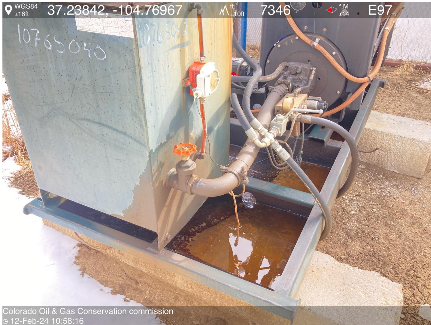
PHOTO 5: OILY WASTE IN ENGINE SKID. COMPLY WITH RULE 1002.f.(2)B, Comply with general provisions of the oil and gas act for wildlife protection AND SB-181. CA DATE 2-13-2024.