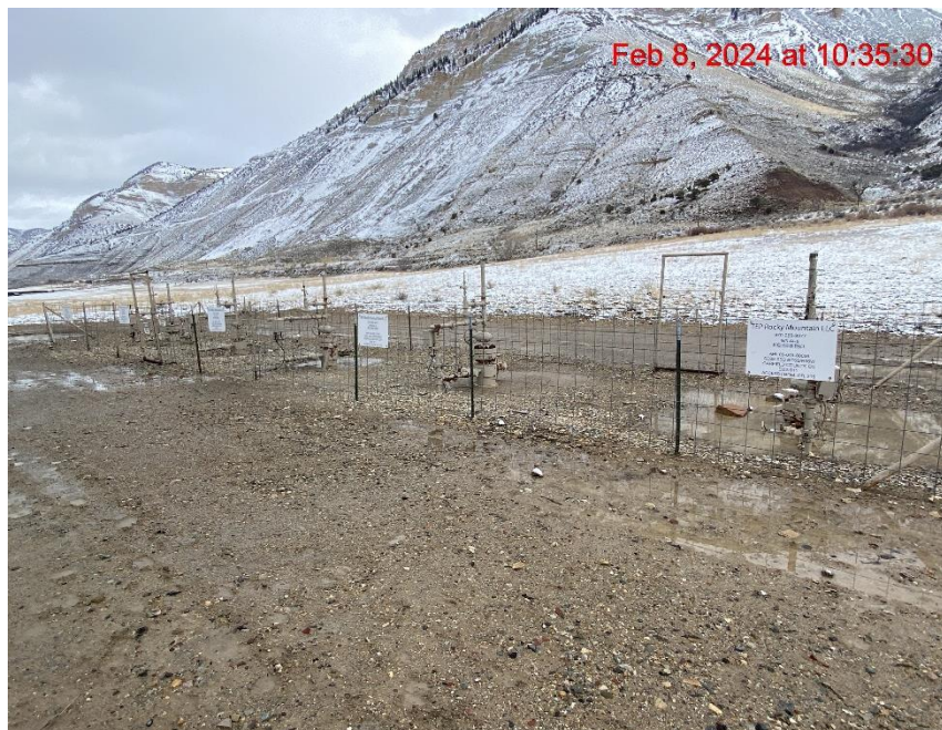
Wellheads – Photo #09185