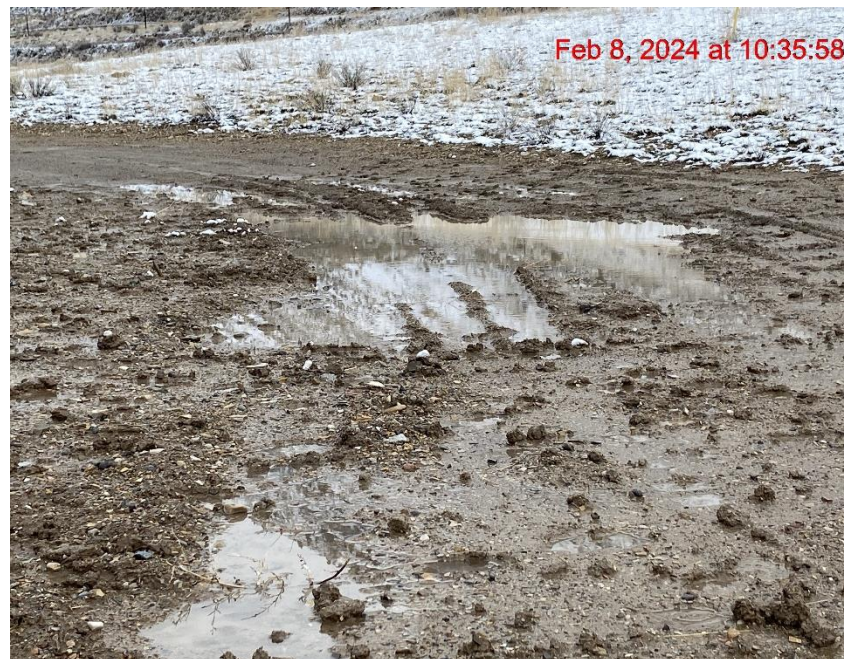
Lack of Stabilization – Photo #09187