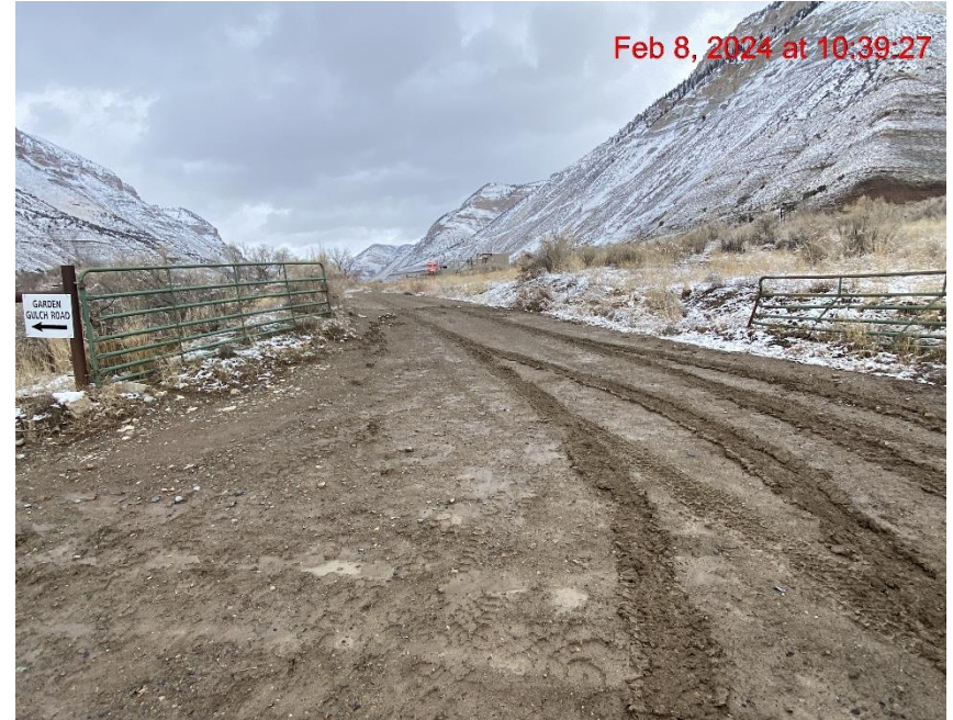
Insufficient Vehicle Tracking BMPs at Location Entrance/Exit – Photo #09194