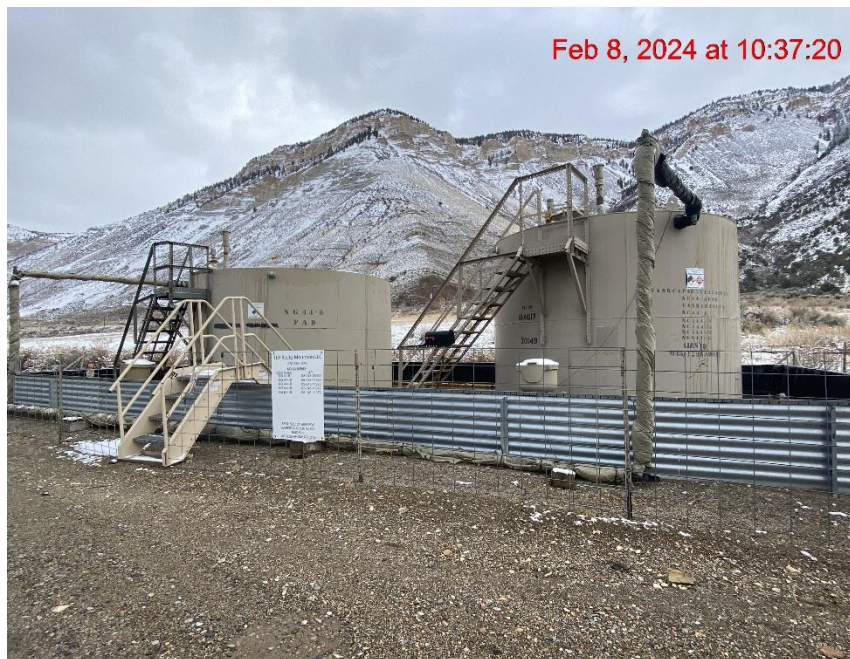
Tank Battery – Photo #09190