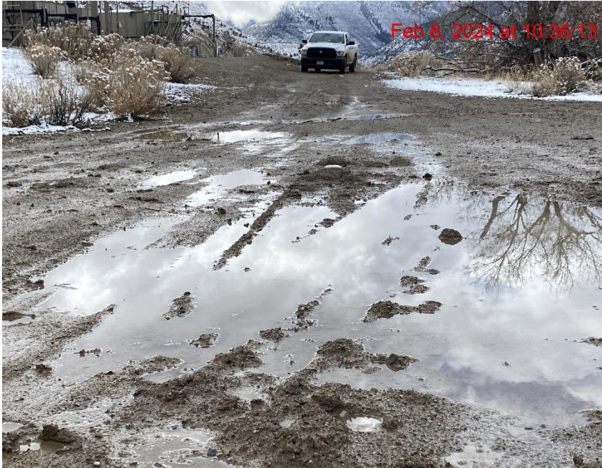
Lack of Stabilization – Photo #09188