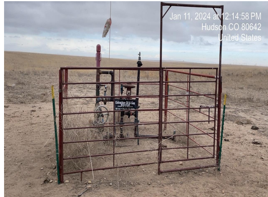
Photo 2. Photo taken of well head. Photo taken facing northwest.