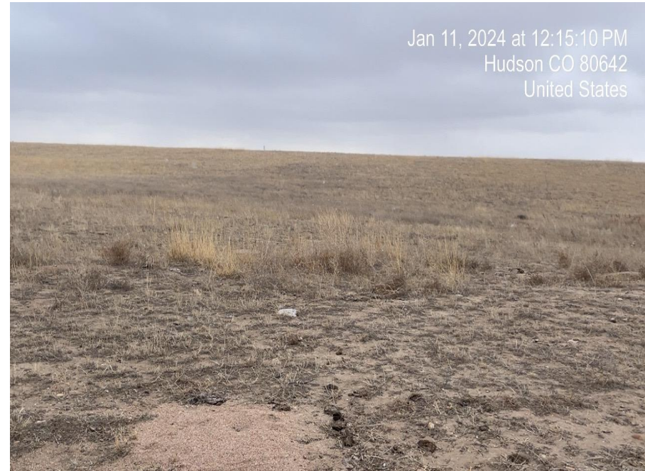
Photo 4. Photo taken of adjacent lands for comparison. Photo taken facing south.