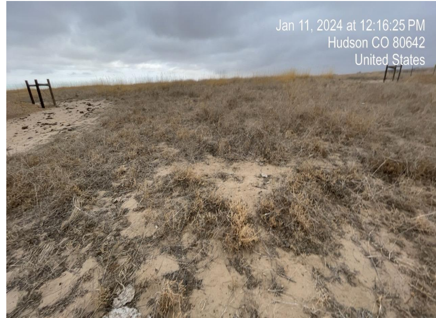
Photo 6. Photo taken of unmanaged weeds (kochia & russian thistle) on site. Photo taken facing east.