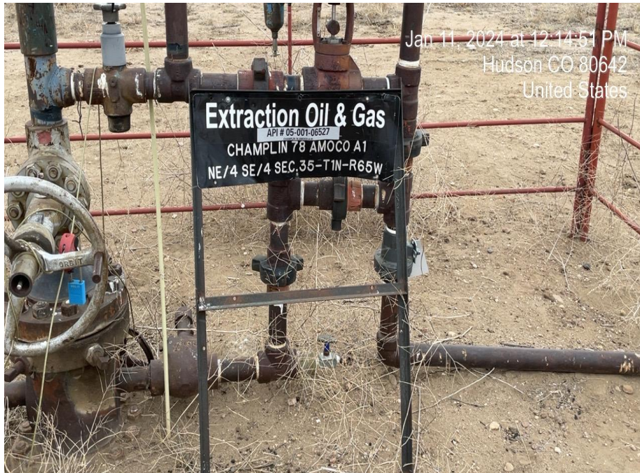
Photo 1. Photo taken of location sign, facing north.