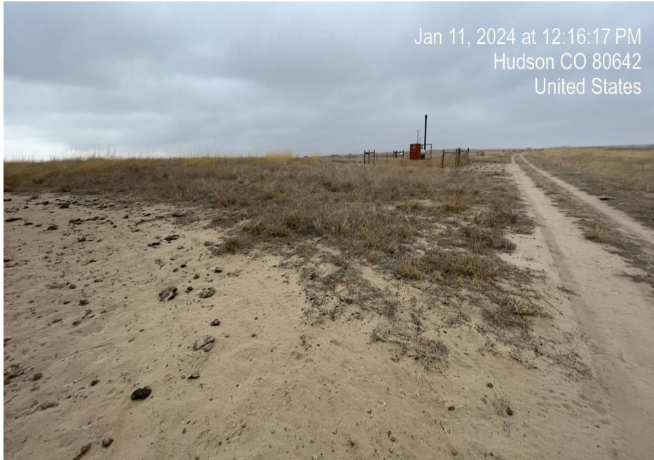
Photo 5. Photo taken of unmanaged weeds (kochia & russian thistle) on site. Photo taken facing northeast.