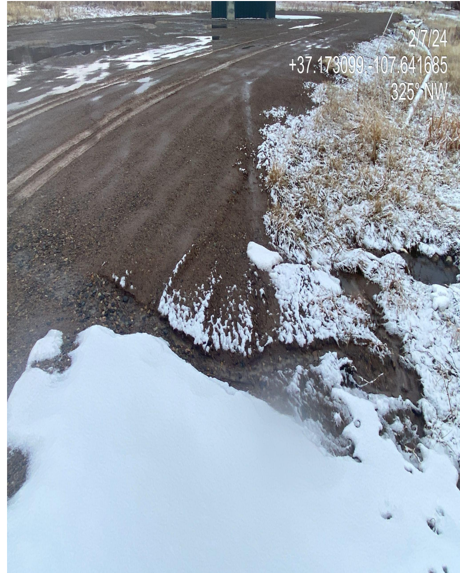
Photo 3. Rill erosion forming on the eastern edge of the disturbance near the access point.