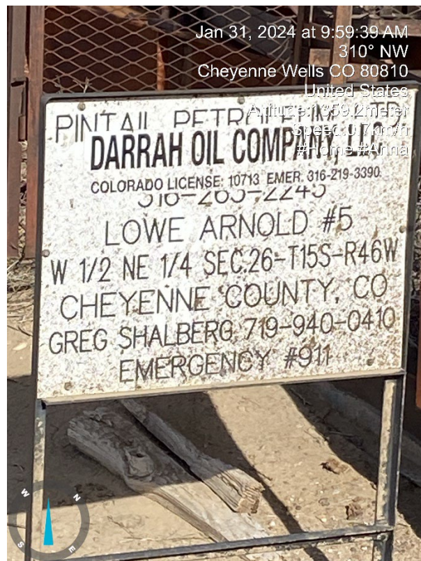
1. Lease sign by unit