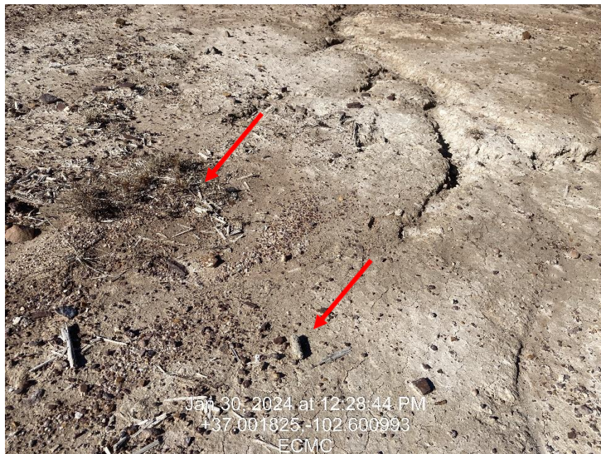
Photo 7 – Area of impacted soils with evidence of past seeding event