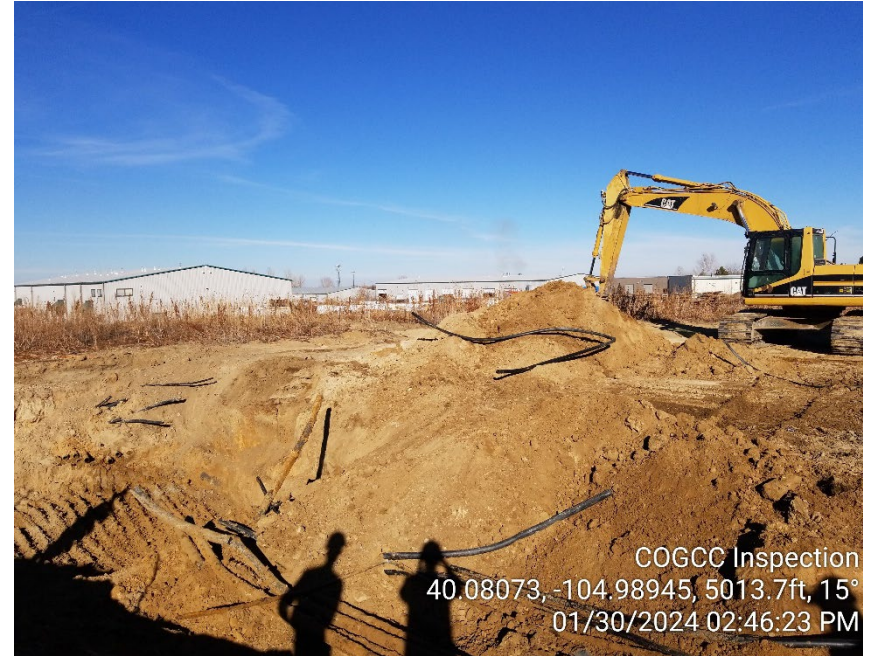
Photo 38 - Open excavation 1/30/2024