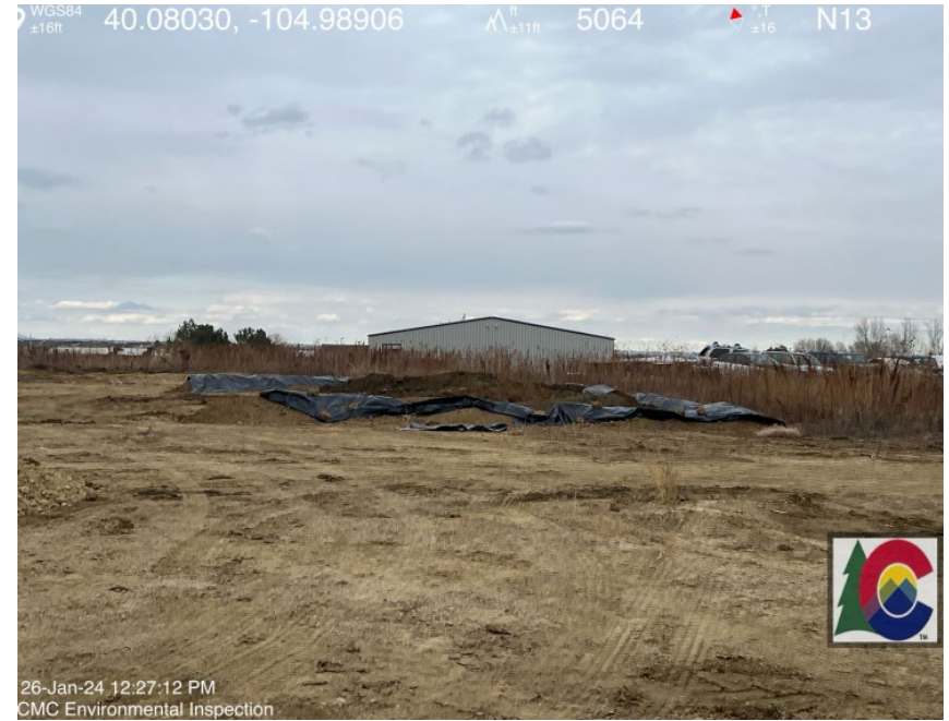
Photo 22 - Soil stockpile 1/26/2024