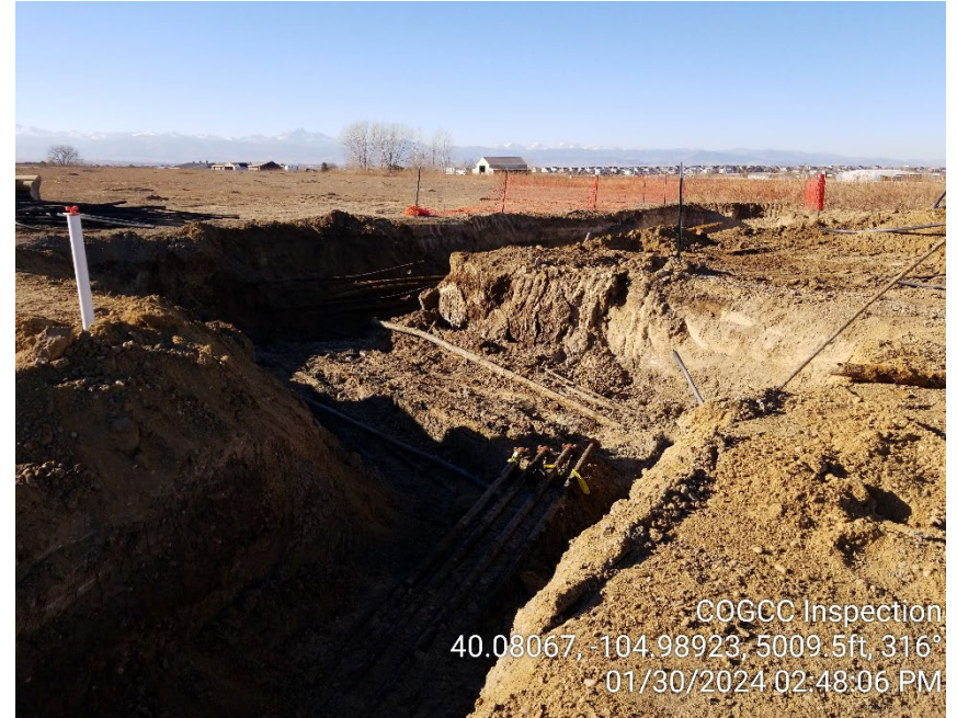
Photo 40 - Open excavation 1/30/2024