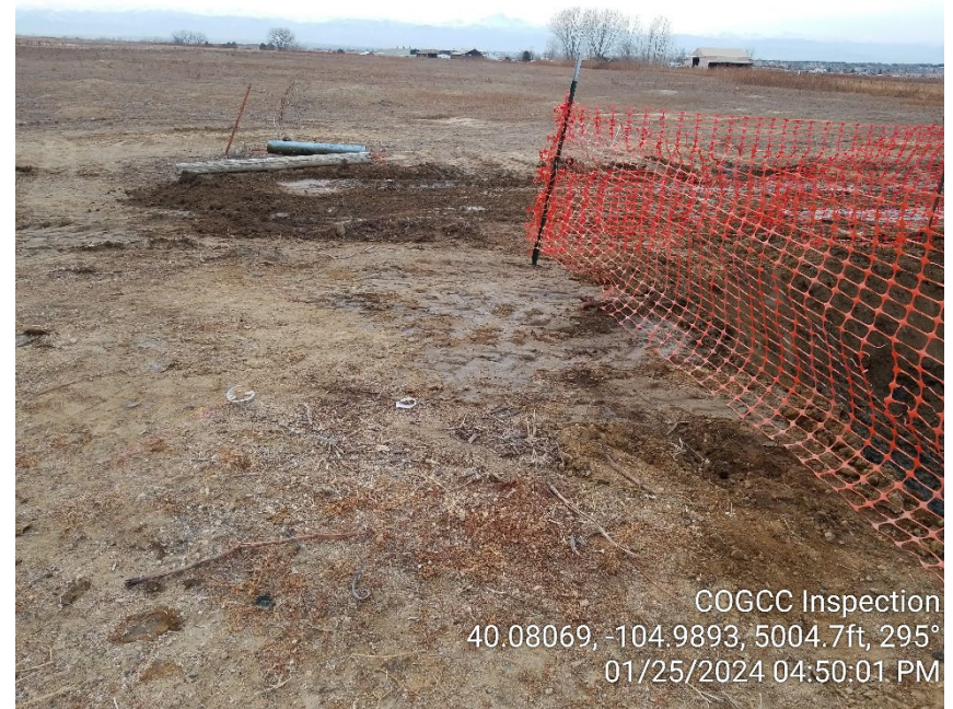
Photo 14 - Spill area 1/25/2024 PM