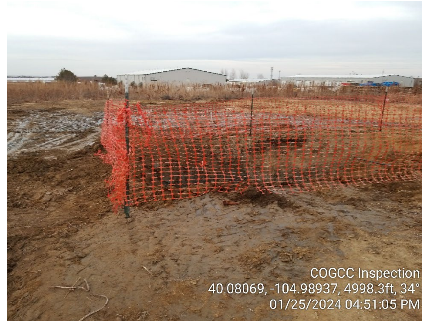
Photo 16 - Spill area 1/25/2024 PM