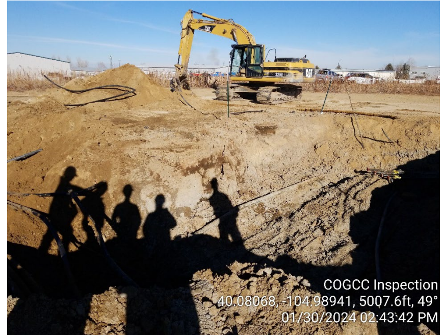
Photo 36 - Open excavation 1/30/2024