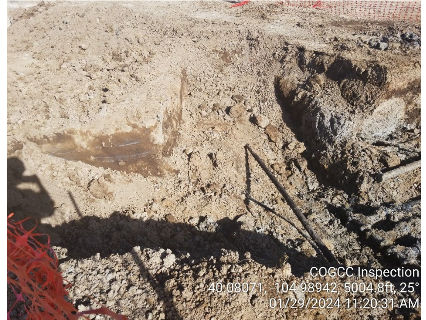
Photo 30 - Open excavation 1/29/2024