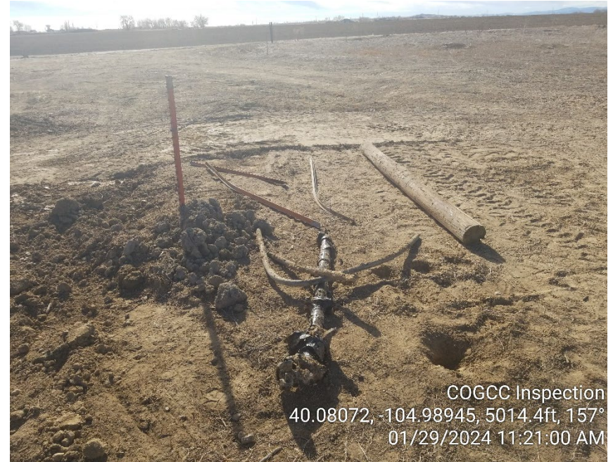
Photo 26 - Spill area 1/29/2024