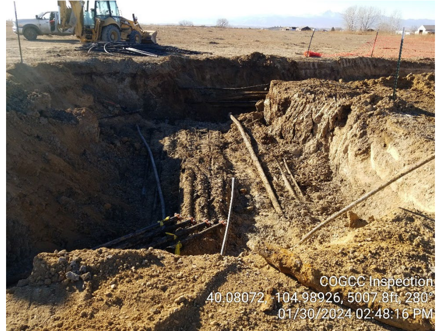
Photo 42 - Open excavation 1/30/2024