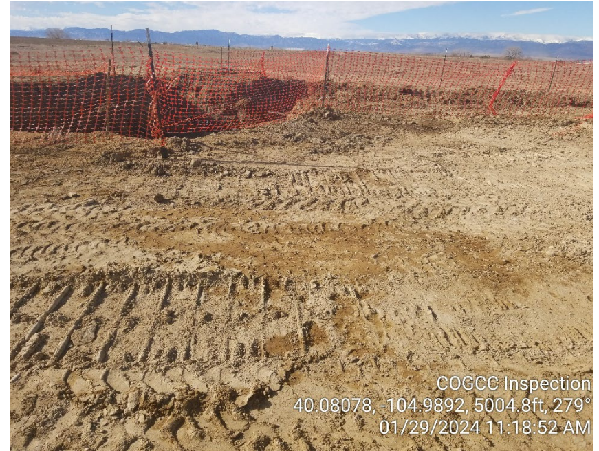
Photo 24 - Spill area 1/29/2024