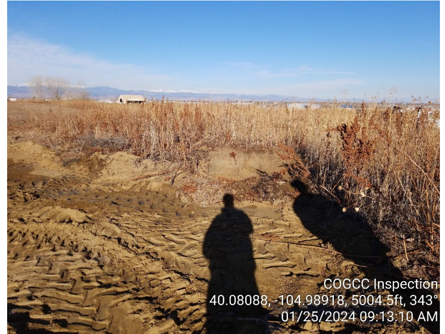
Photo 6 - Spill area 1/25/2024 AM