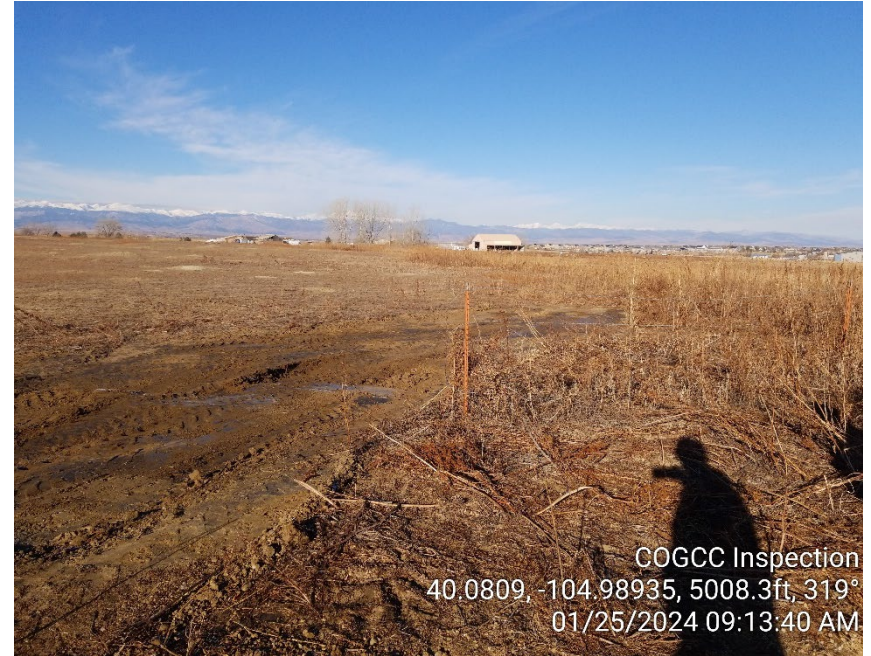
Photo 8 - Spill area 1/25/2024 AM