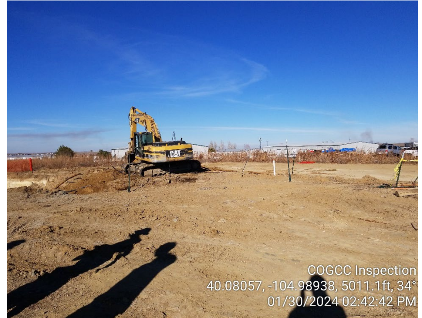
Photo 32 - Spill area 1/30/2024