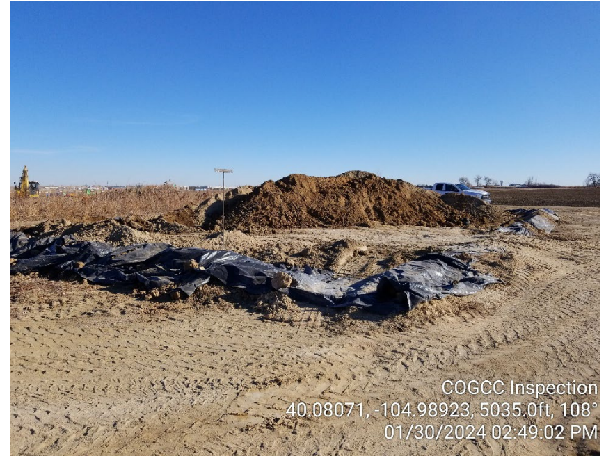
Photo 44 - Soil stockpile 1/30/2024