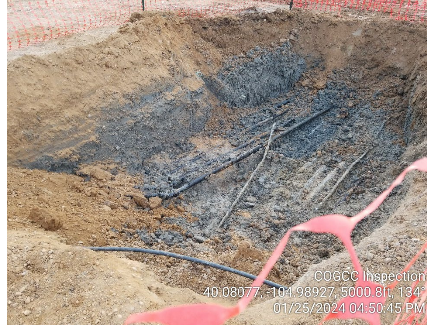
Photo 18 - Open excavation 1/25/2024 PM