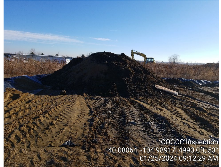
Photo 12 - Soil stockpile 1/25/2024 AM