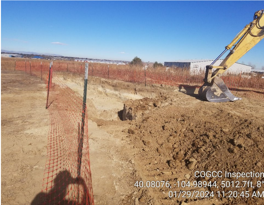
Photo 29 - Open excavation 1/29/2024