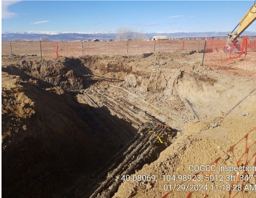
Photo 27 - Open excavation 1/29/2024