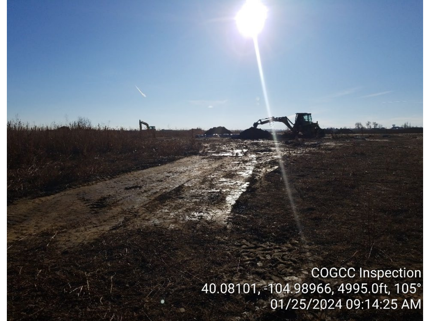
Photo 10 - Spill area 1/25/2024 AM