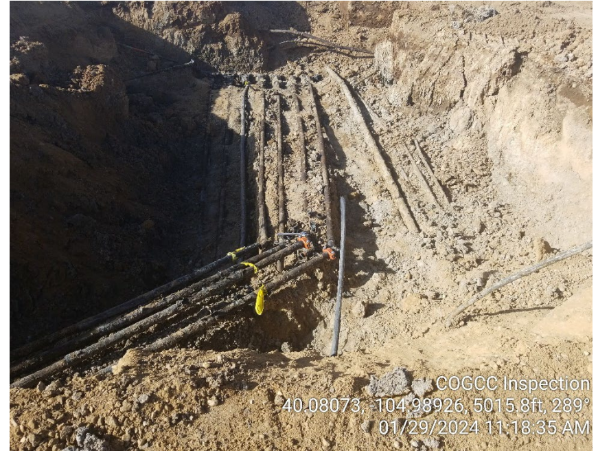
Photo 28 - Open excavation 1/29/2024