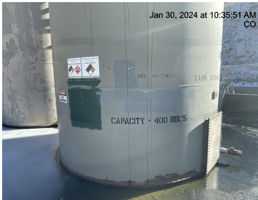
Photo # 4706 Tank labels have inaccurate information/lack required information