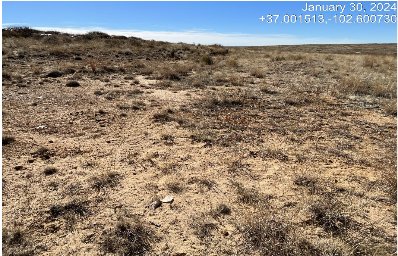
Photo 7. Facing southwest along the cut slope.