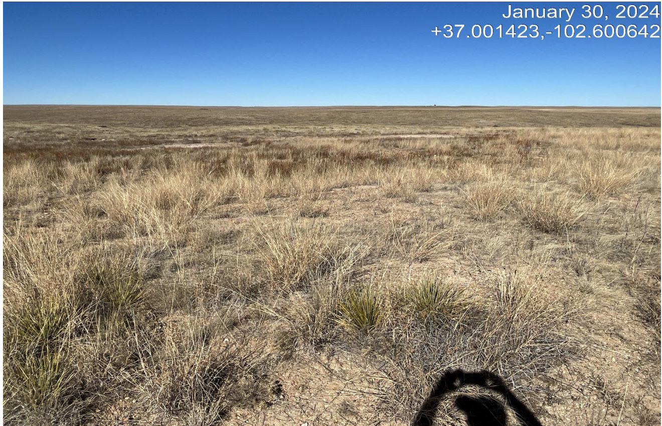
Photo 8. South side of the location facing north.