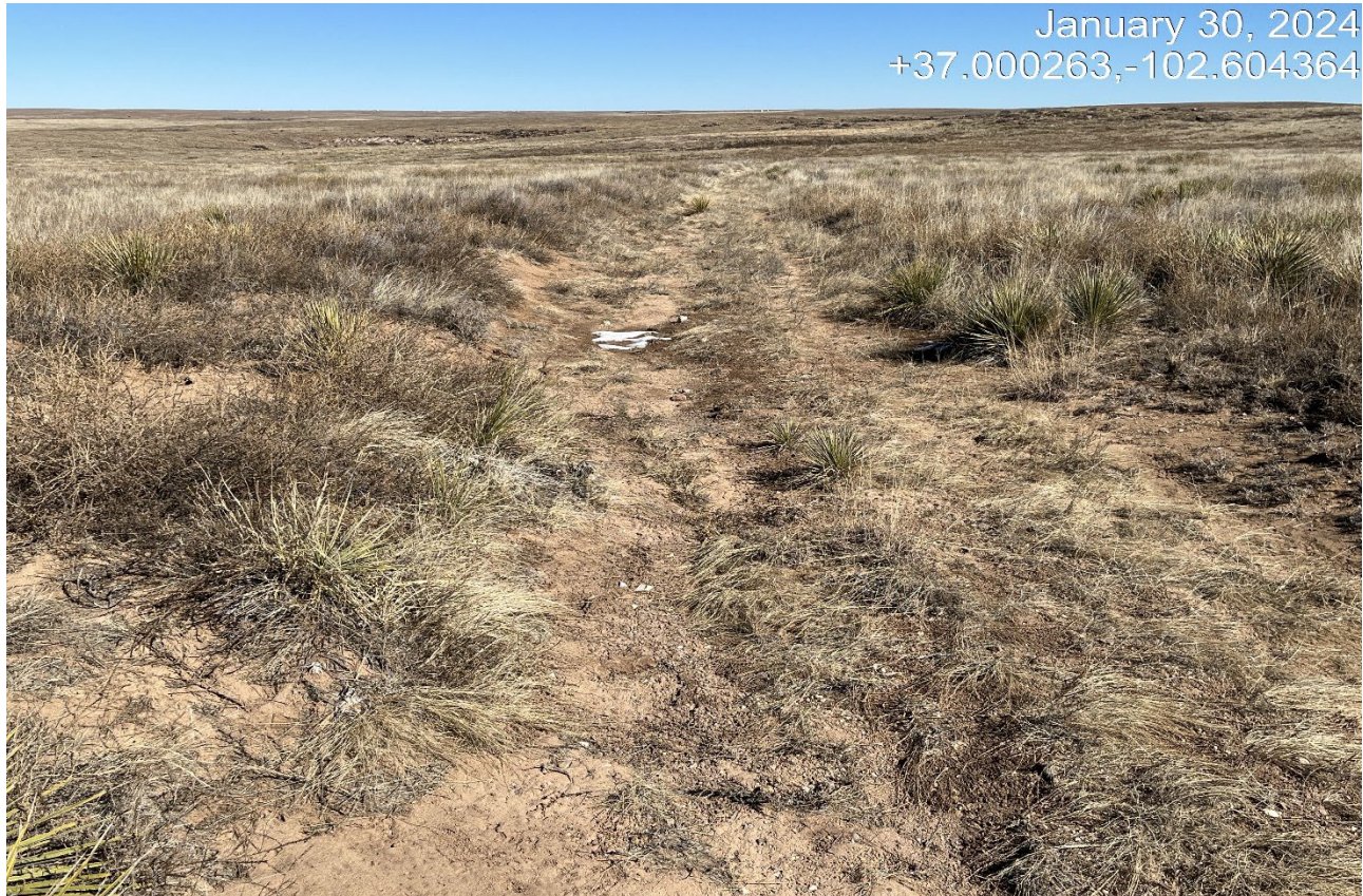
Photo 1. Facing east toward the access road. This area of the road remains swaled and was not recontoured.