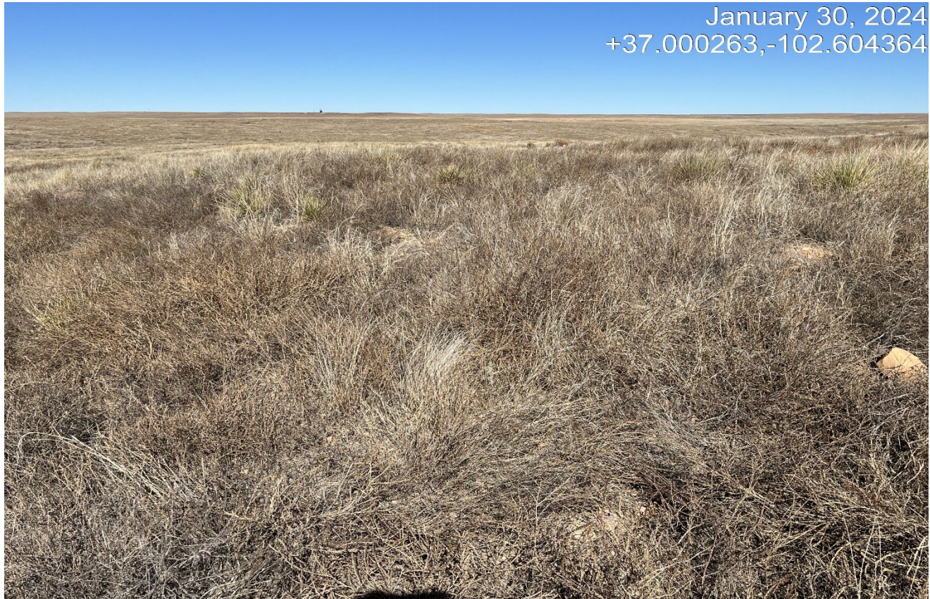
Photo 3. West side of the location consists mostly of undesirable weeds (Russian thistle).