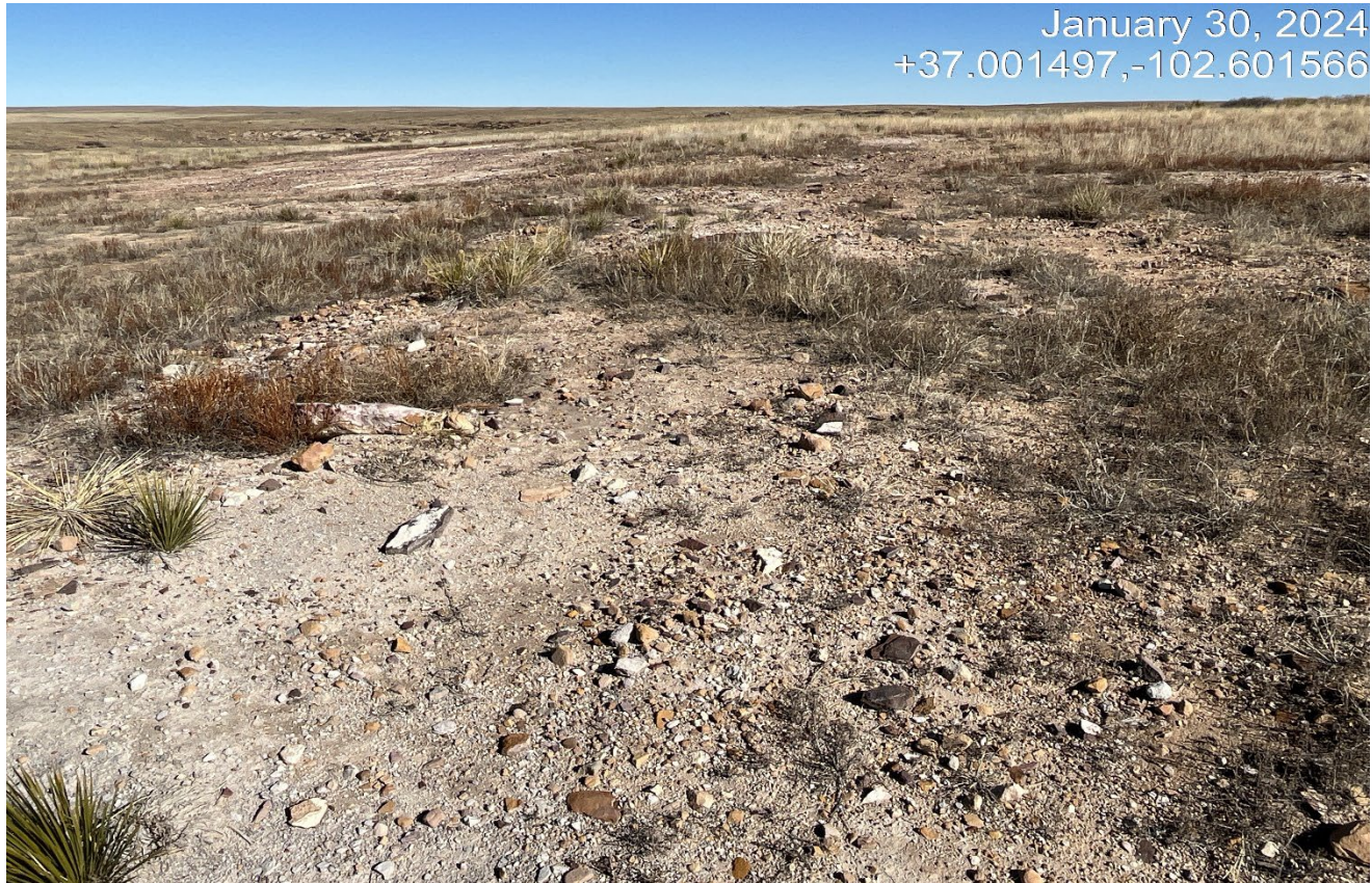
Photo 4. Northwest corner of the location facing east.