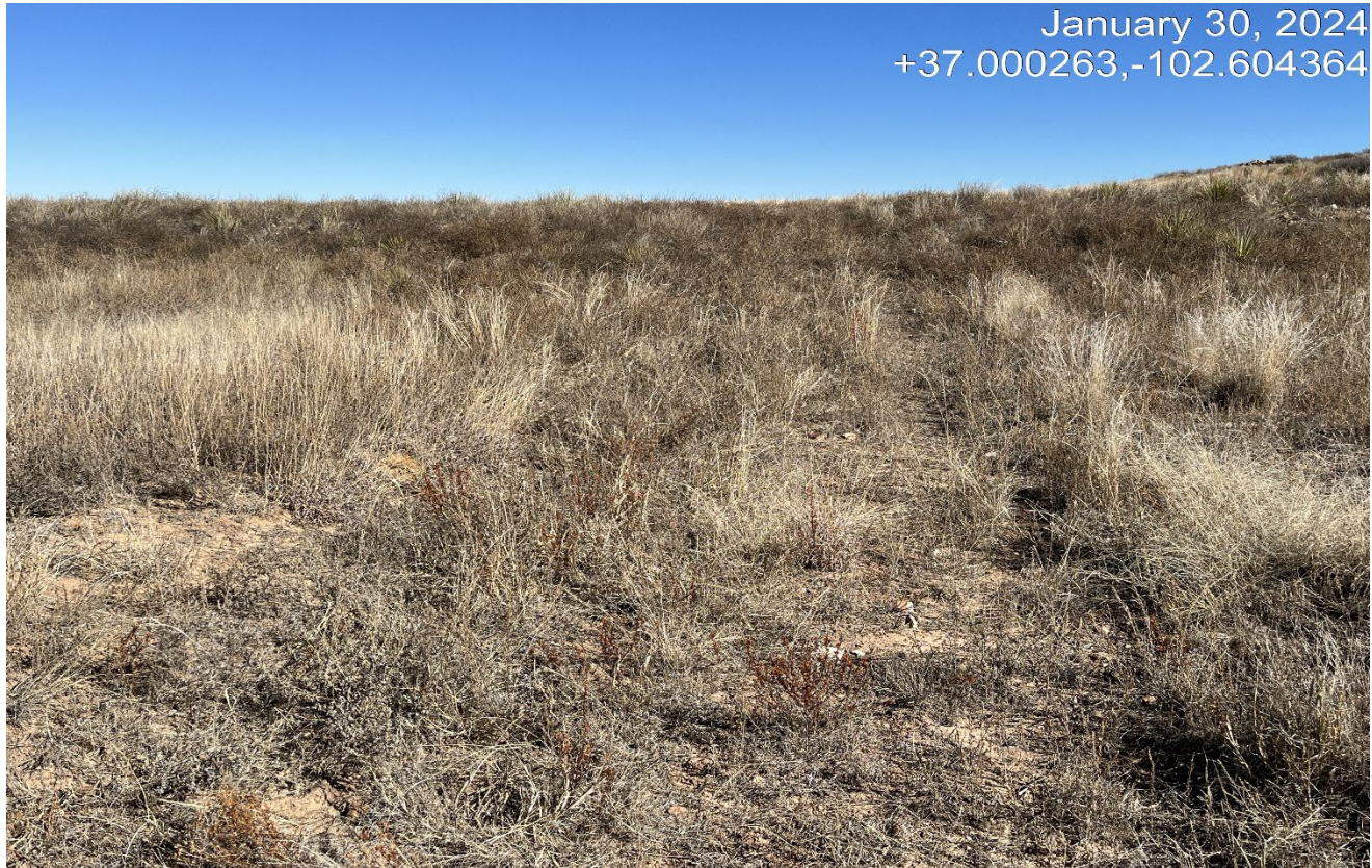
Photo 2. Facing east toward the location. The well pad was never recontoured.