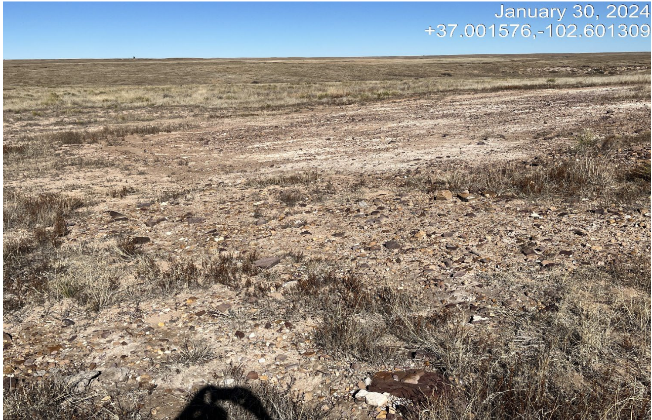
Photo 5. Facing northeast at the north side of the location. The soil appears to be impacted and vegetation is not establishing.