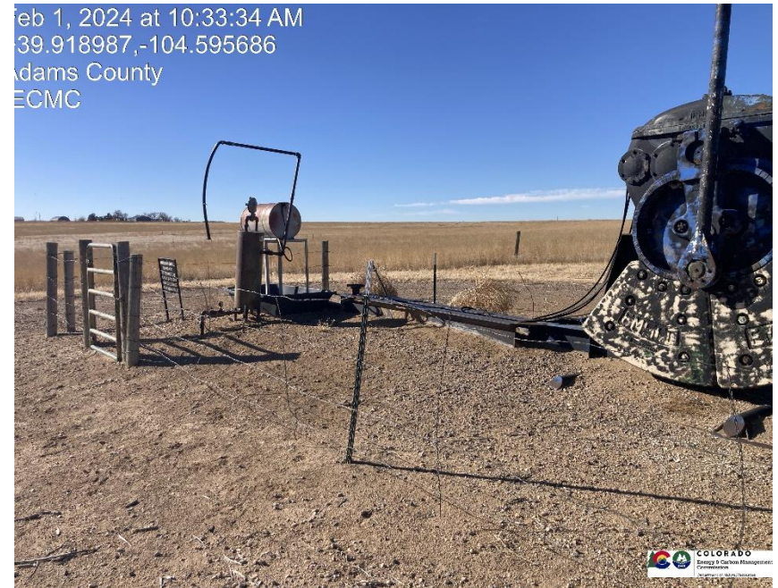
Pic 2 No prime mover on pump jack