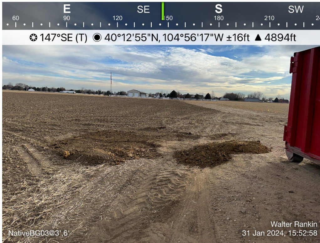
Background Sample Location