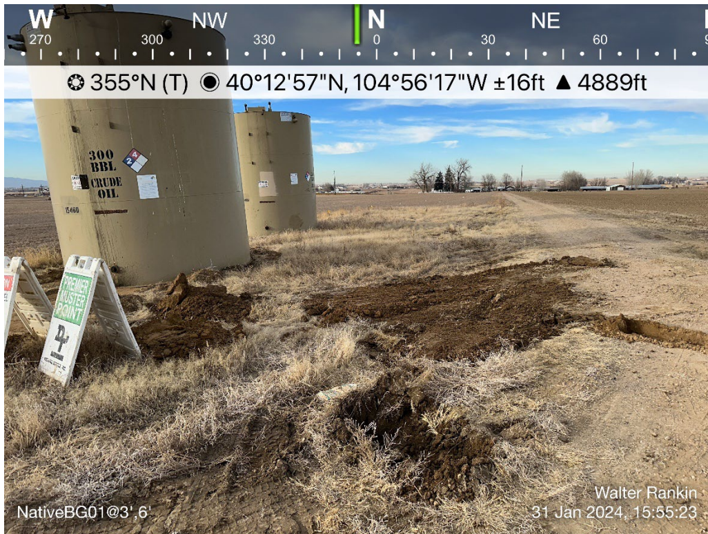
Background Sample Location