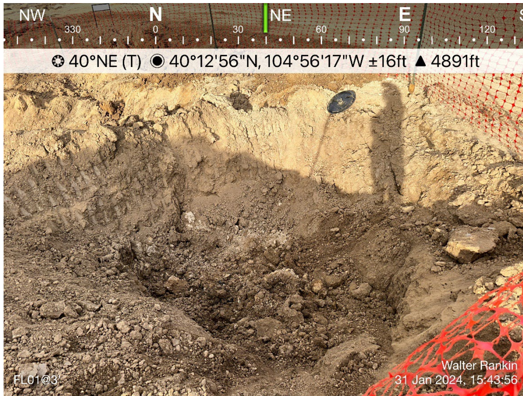
Flowline Sample 01 Excavation