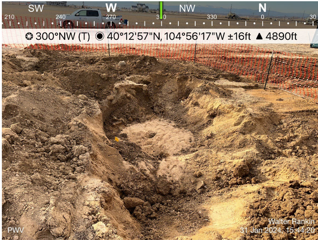
Produced Water Vessel (PWV) Excavation