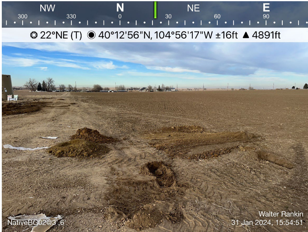
Background Sample Location