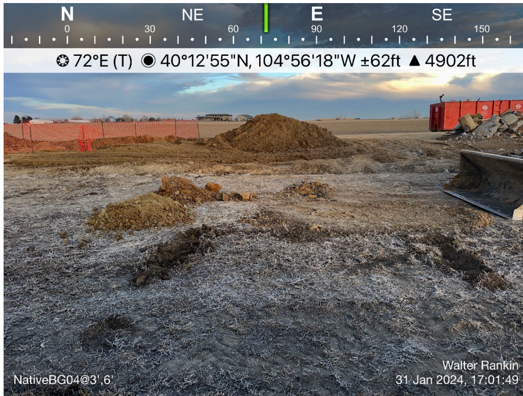
Background Sample Location