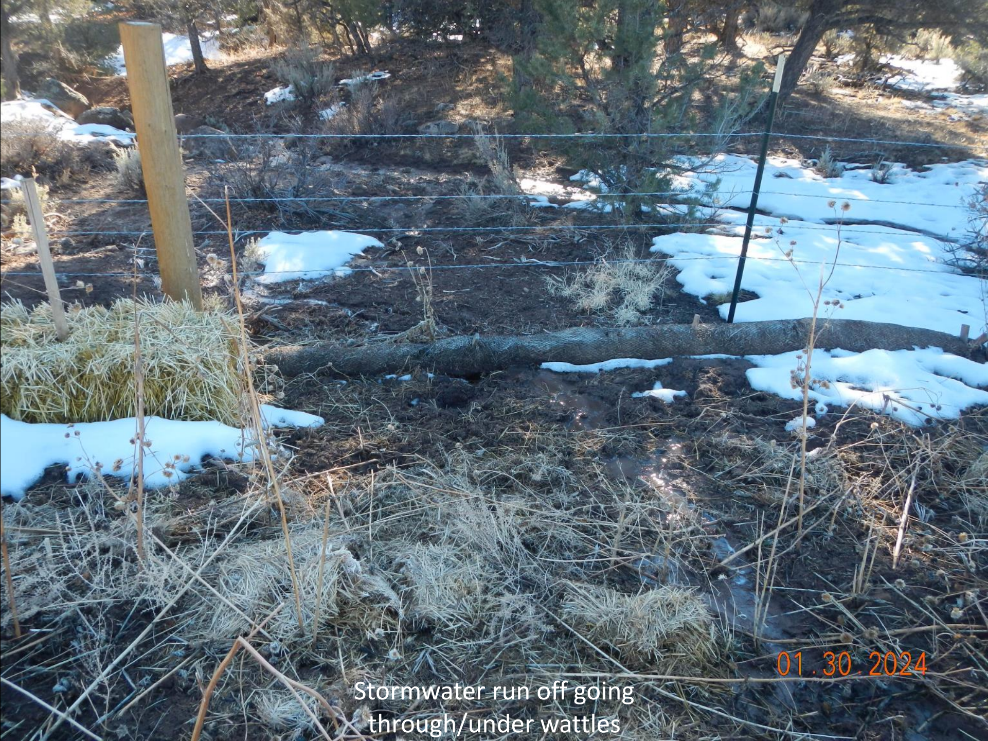
Stormwater run off going through/under wattles