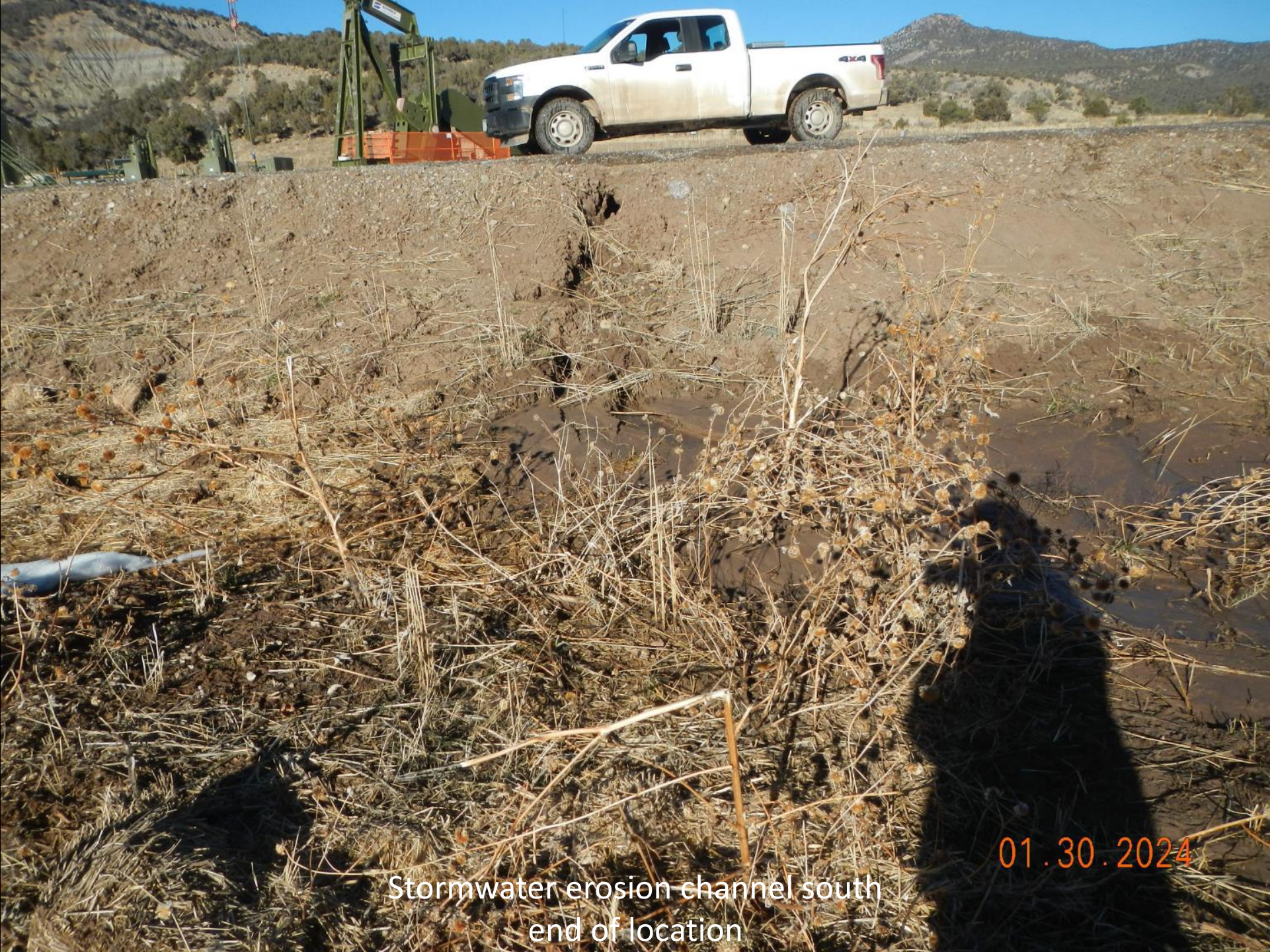
Stormwater erosion channel south end of location