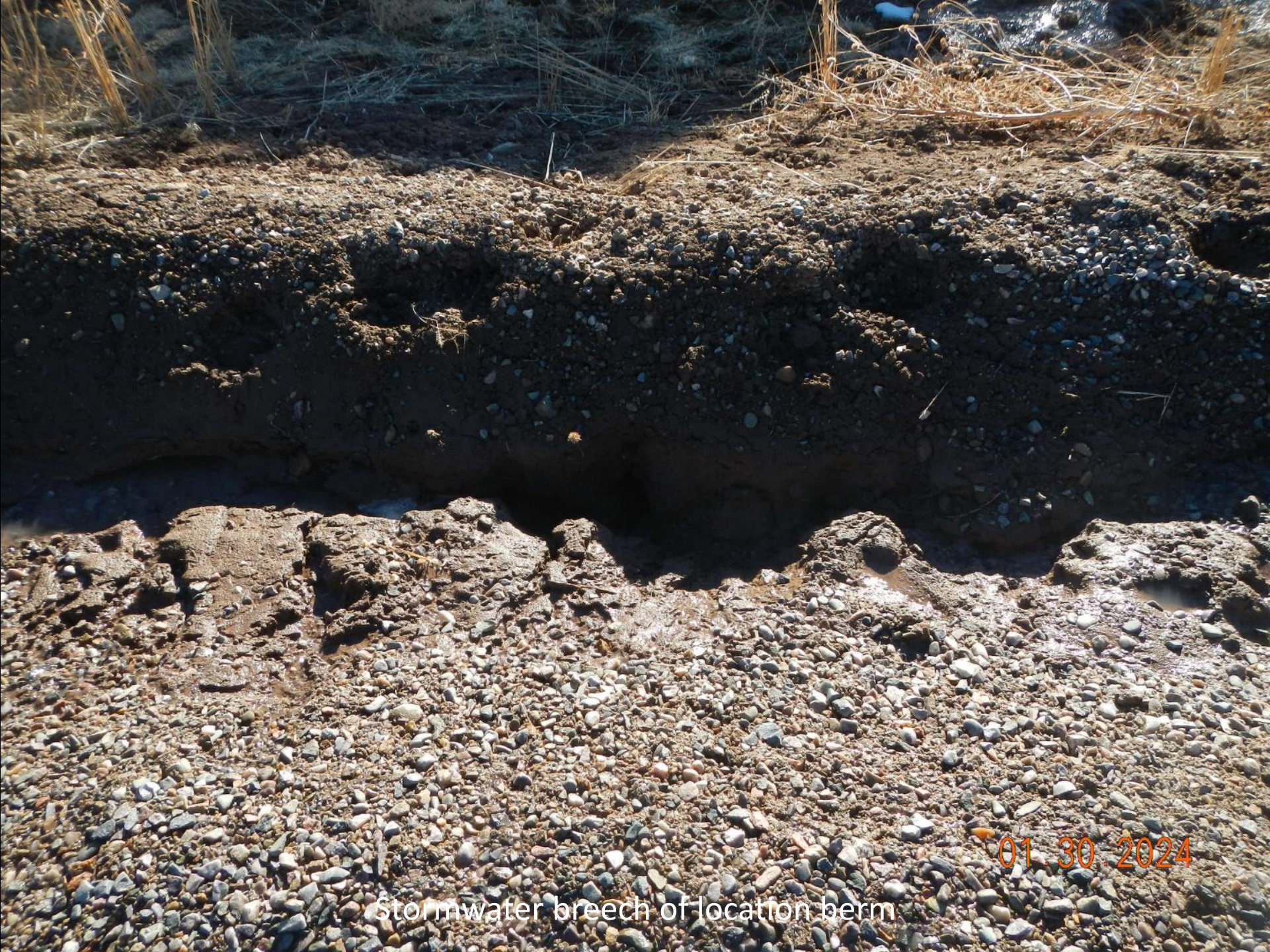
Stormwater breach of location berm