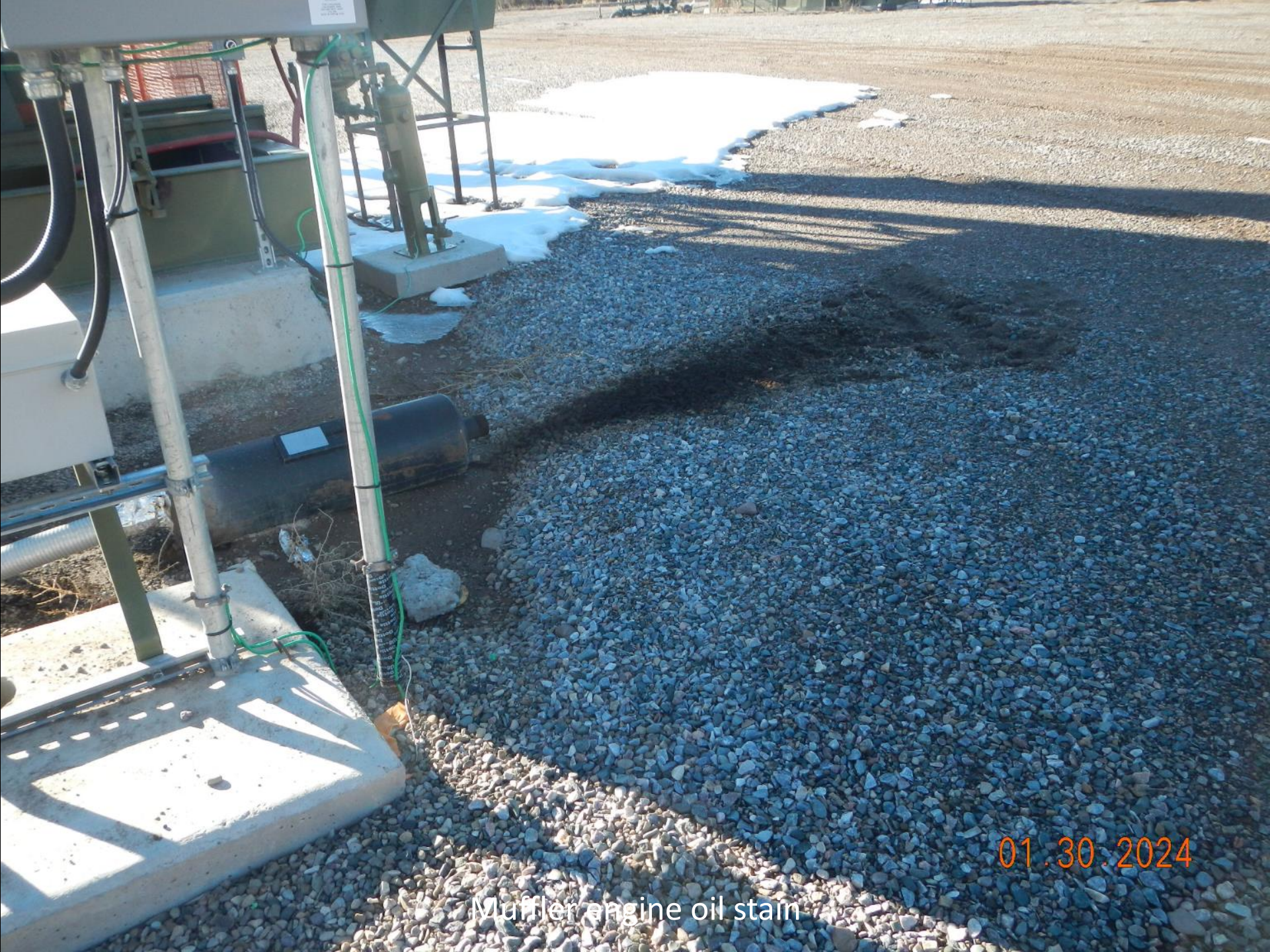
Muffler engine oil stain