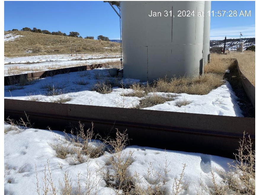
Location from Southwest corner