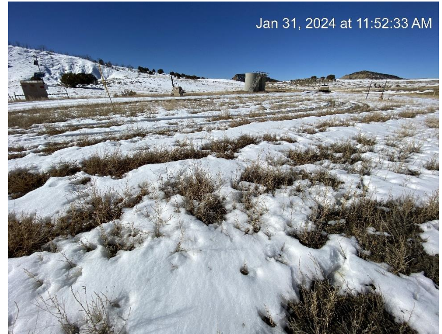
Location from Northeast corner