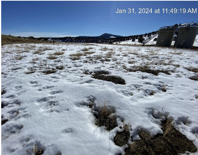
Location from Northwest corner