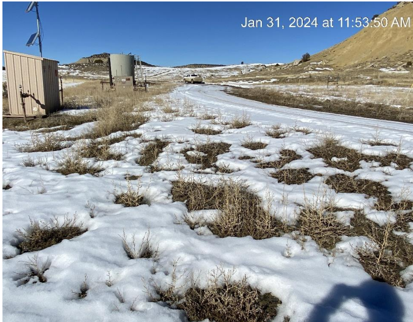
Location from Southeast corner