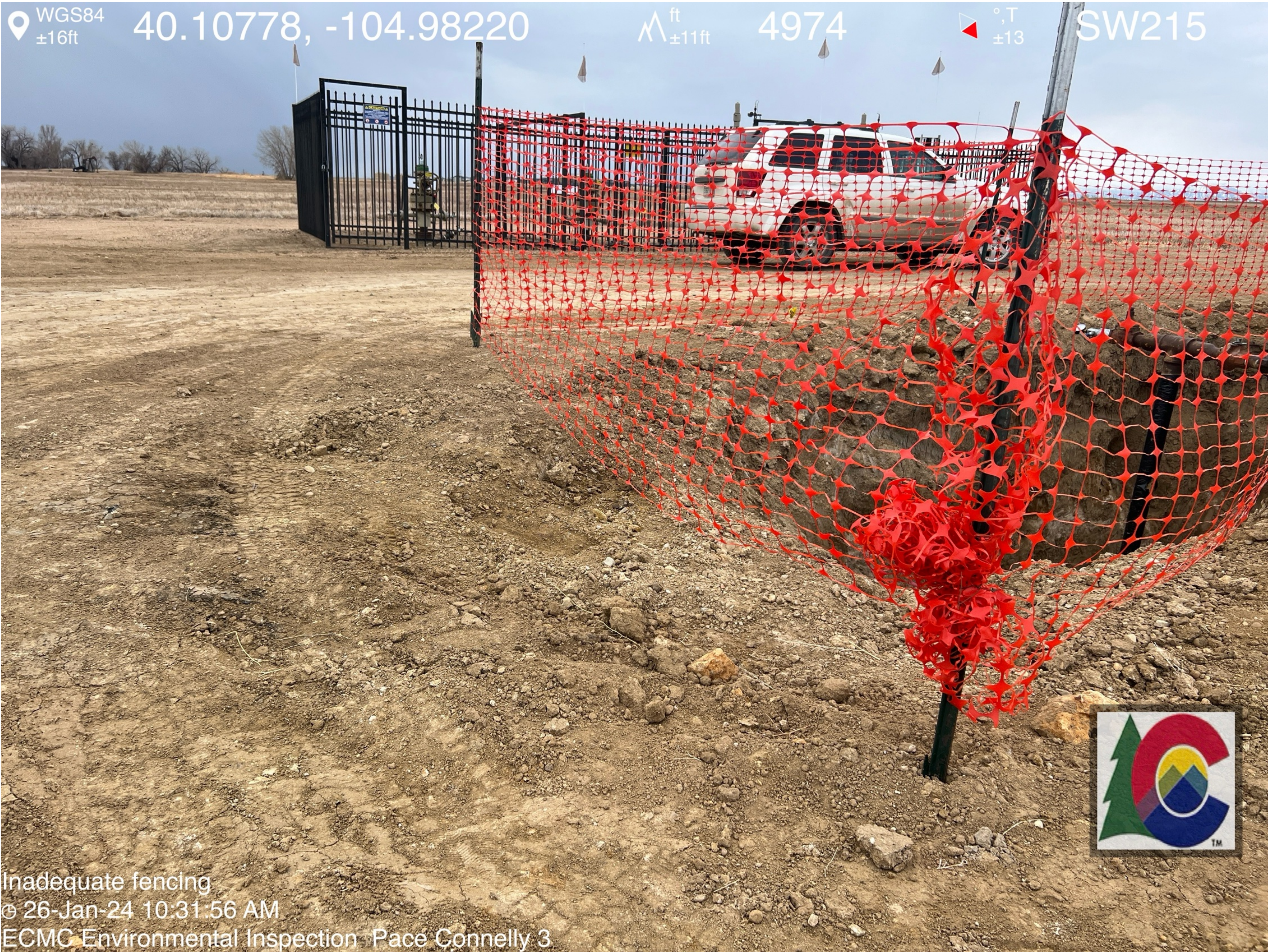
Inadequate fencing Ⓢ 26-Jan-24 10:31:56 AM ECMC Environmental Inspection Pace Connelly 3