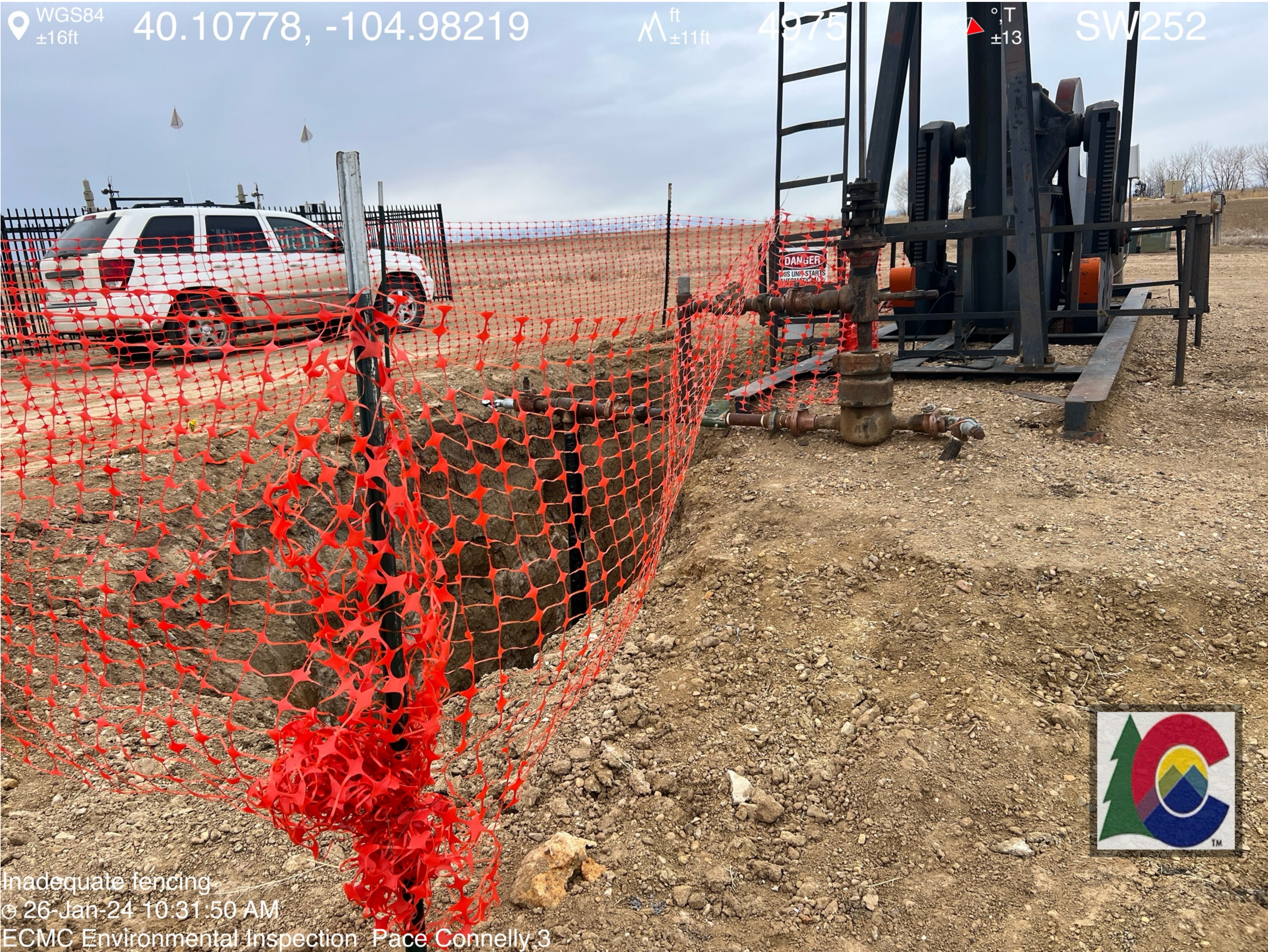
Inadequate fencing © 26-Jan-24 10:31:50 AM ECMC Environmental Inspection Pace Connelly 3