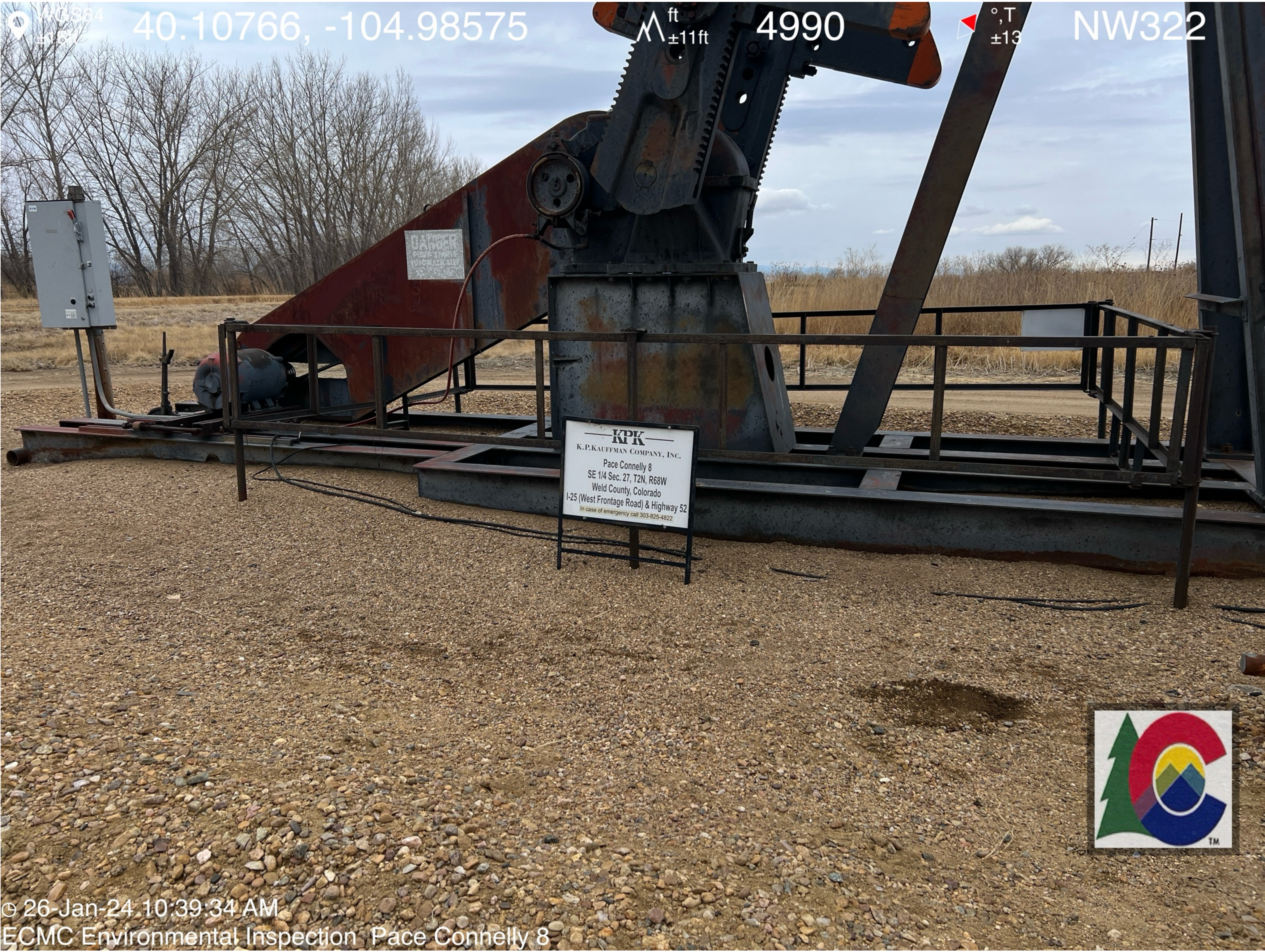
© 26-Jan-24 10:39:34 AM ECMC Environmental Inspection Pace Connolly 8