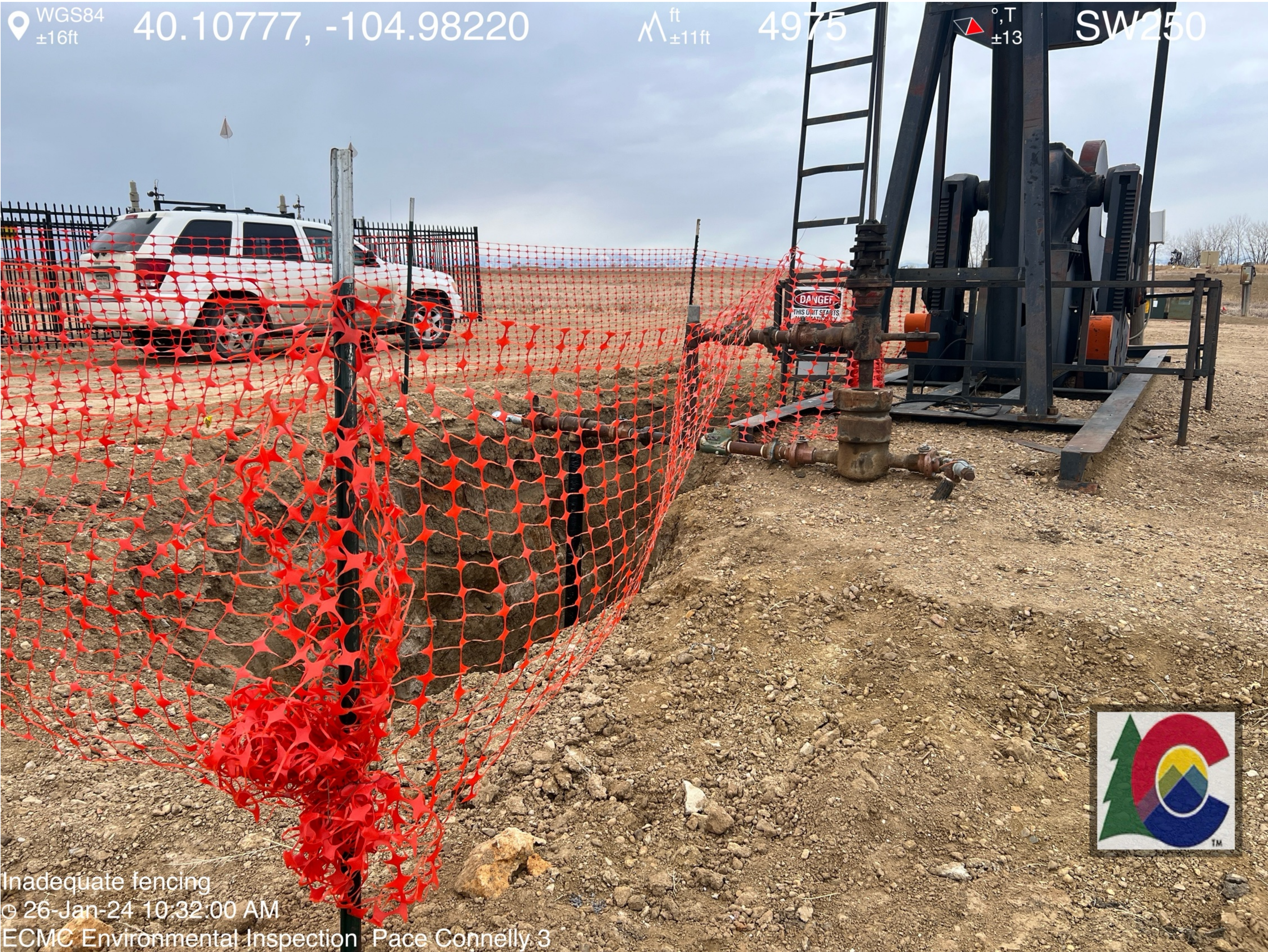
Inadequate fencing