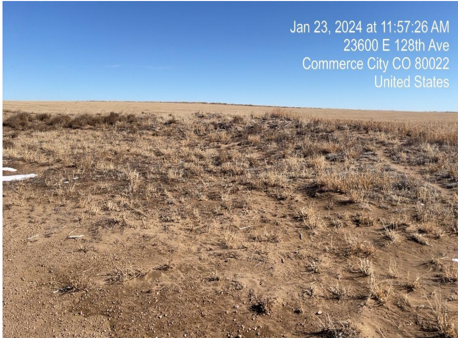
Photo 5. Photo taken of weeds (russian thistle & Kochia) and vegetation on site. Photo taken facing southwest.