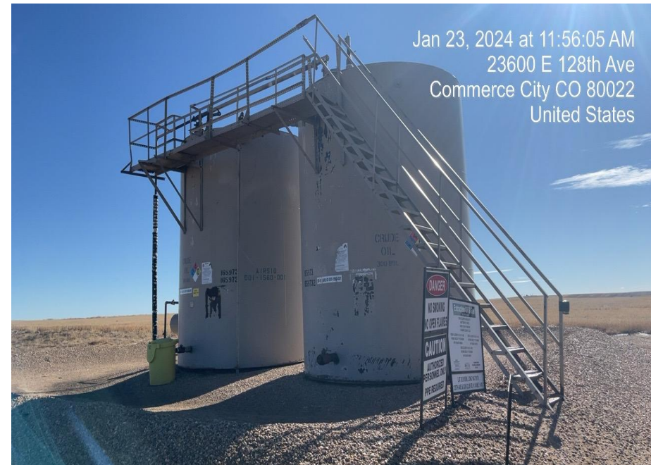
Photo 2. Photo taken of tank battery on pad. Photo taken facing west.