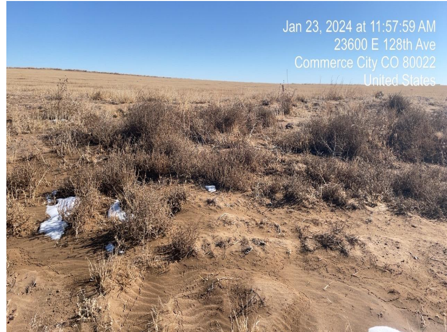
Photo 6. Photo of weeds (russian thistle & Kochia). Photo taken facing south.