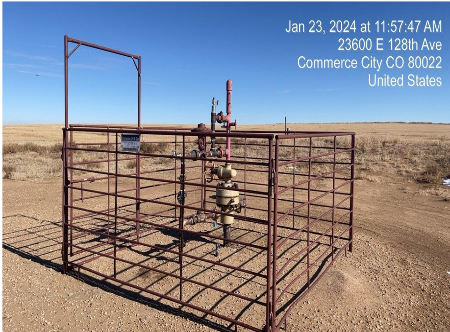
Photo 3. Photo taken of wellhead. Photo taken facing southwest..