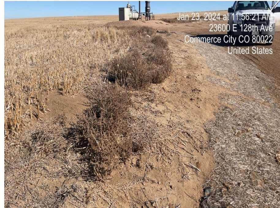
Photo 4. Photo taken of weeds (russian thistle) along access road into pad. Photo taken facing southeast.