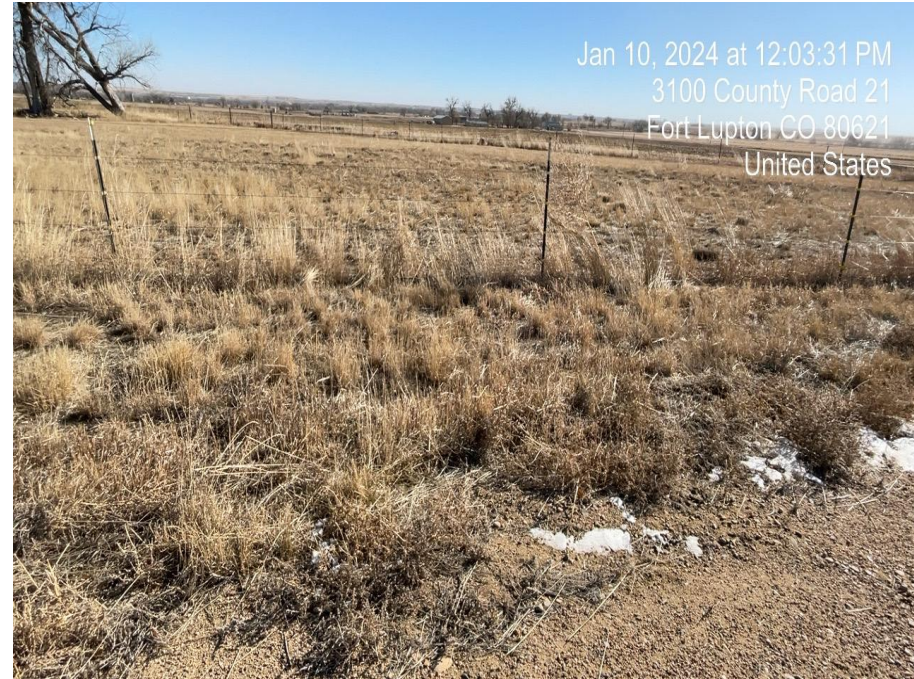
Photo 6. Photo of mowed vegetation on site, and vegetation on adjacent land. Photo taken facing east.