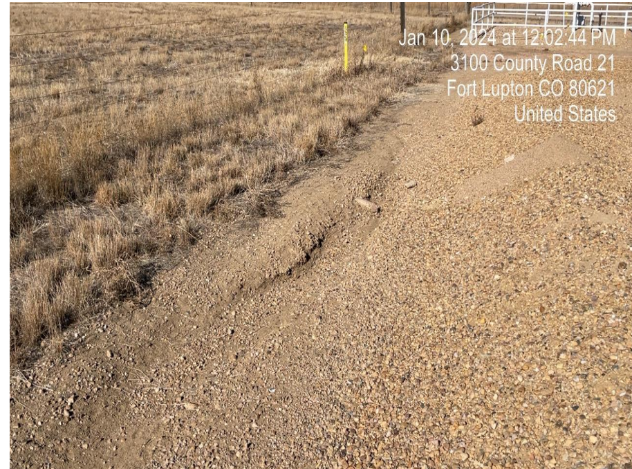
Photo 4. Photo taken of stormwater erosion on access road to site. Photo taken facing southeast.