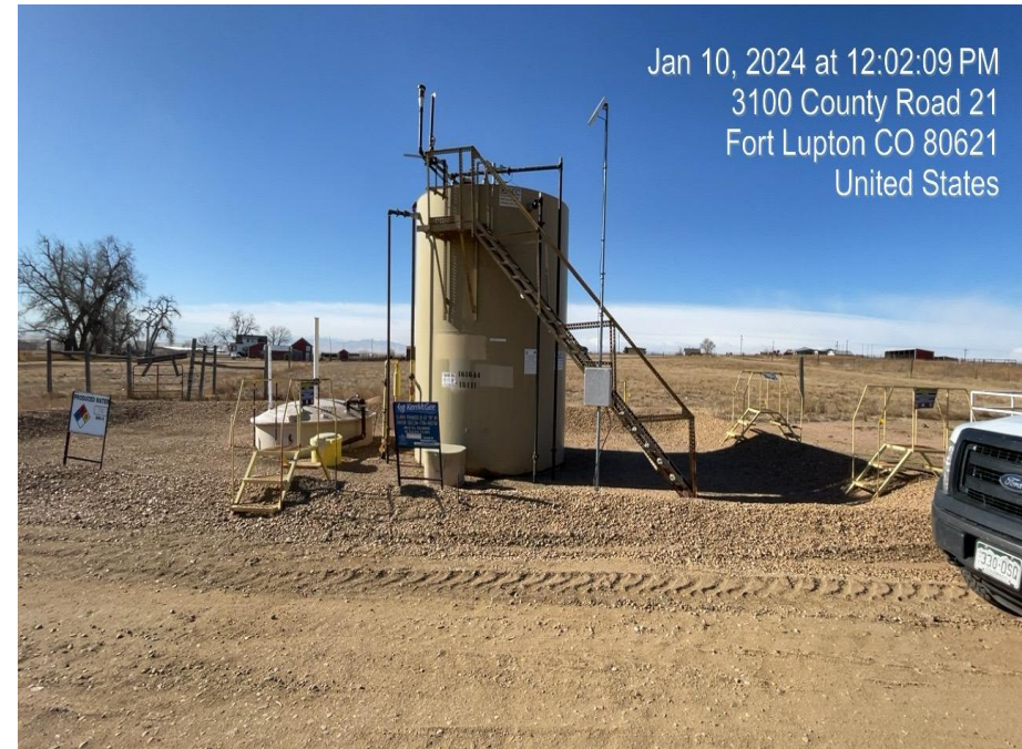
Photo 2. Photo taken of tank battery on pad. Photo taken facing west.