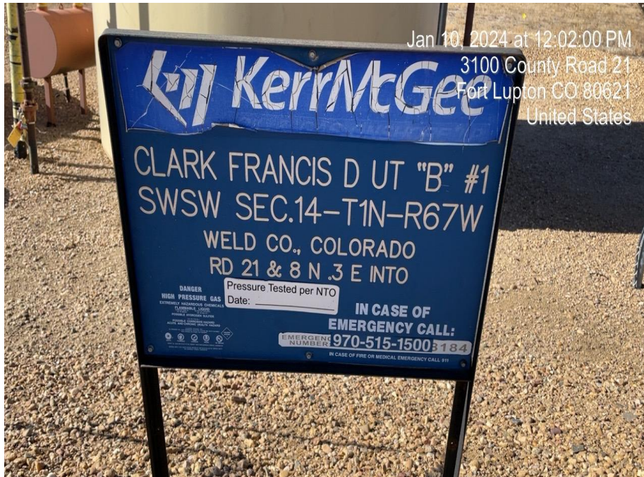
Photo 1. Photo taken of location sign at wellhead, facing north.