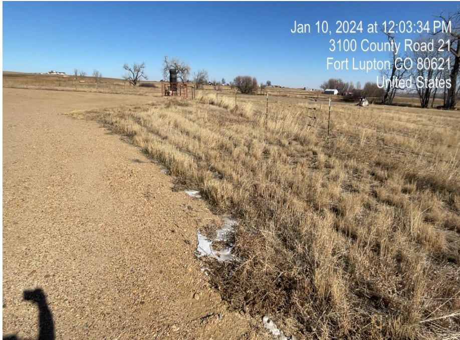
Photo 5. Photo taken of equipment and mowed vegetation on site. Photo taken facing northeast.

Location Name: Francis D. Clark B-1 & tank Battery Location ID: 317773