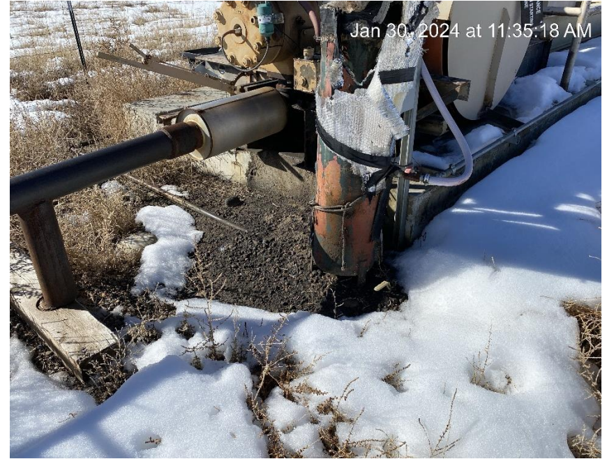
Leak and stained soil