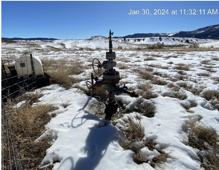
OWP well – 31-13W