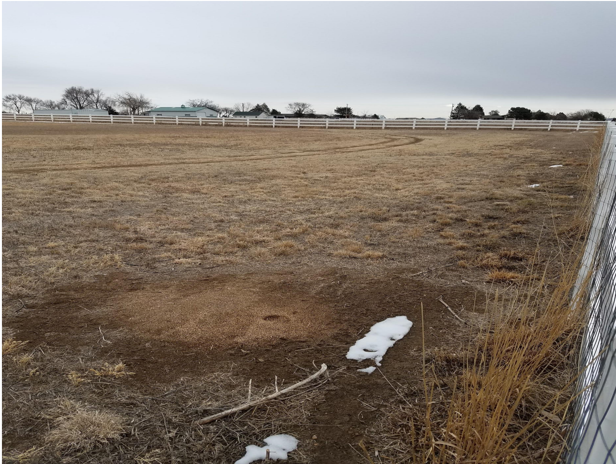
Photo 1. Photo taken from the well location and tank battery, facing East. Photo illustrates a land use change to housing development.