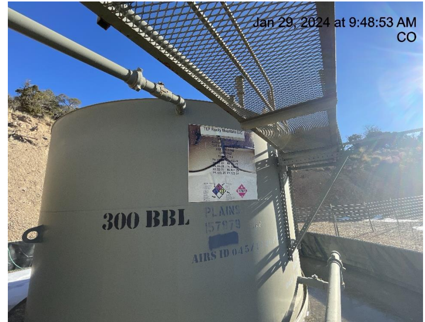
Photo # 4227 Tank label weathered & some required info is illegible