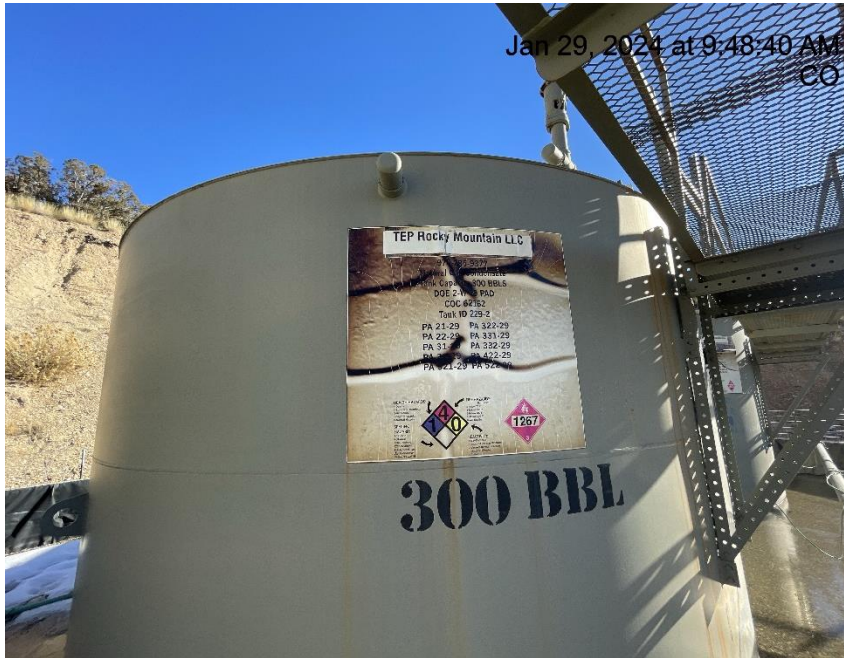
Photo # 4226 Tank label weathered & some required info is illegible