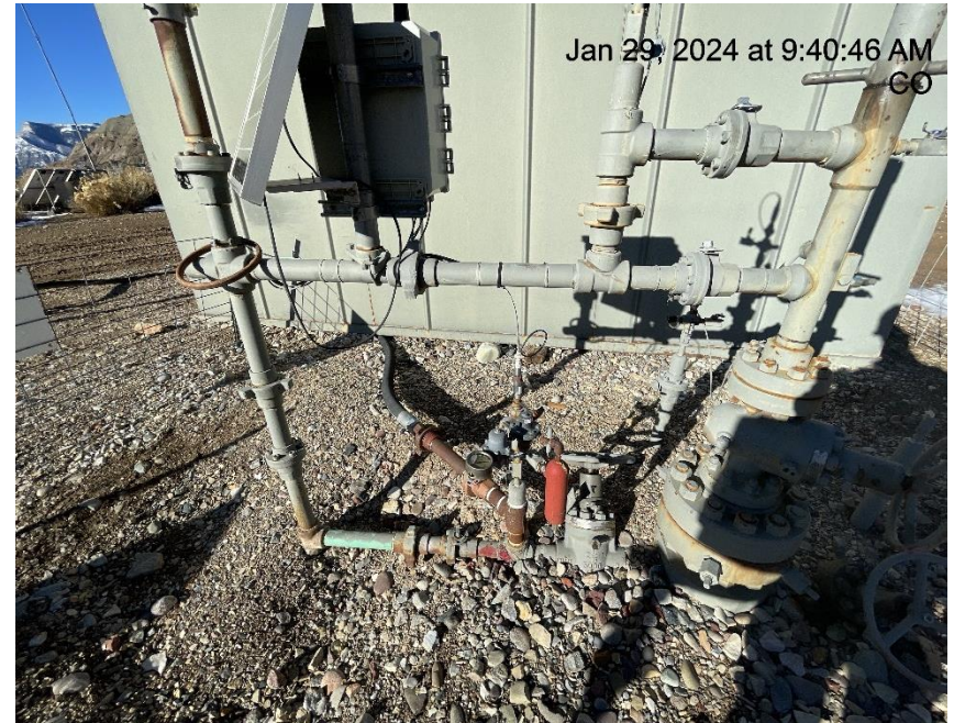
Photo # 4231 Line going from PA 321-29 well flowline to DOE 2-W-29 injection well