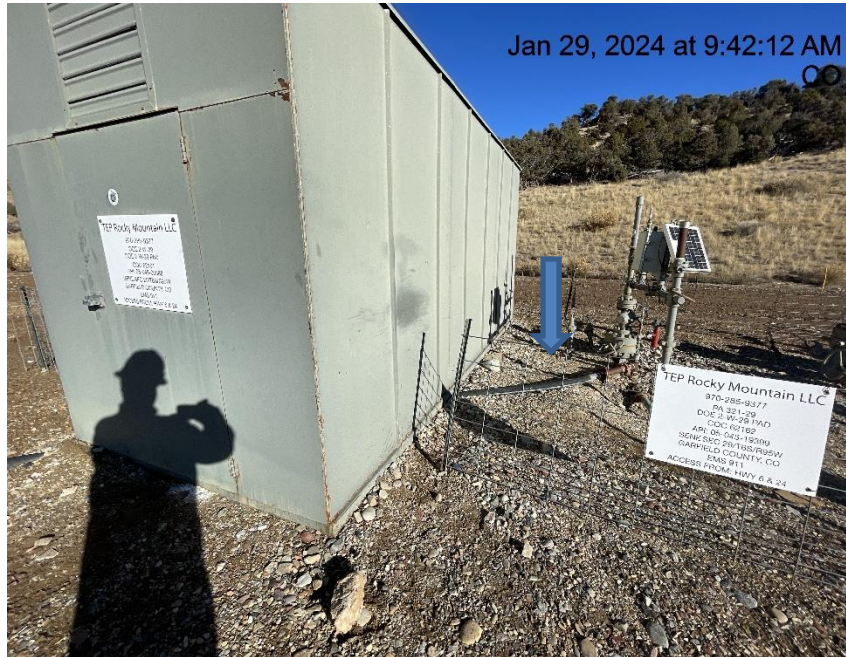
Photo # 4228 Line going from PA 321-29 well flowline to DOE 2-W-29 injection well