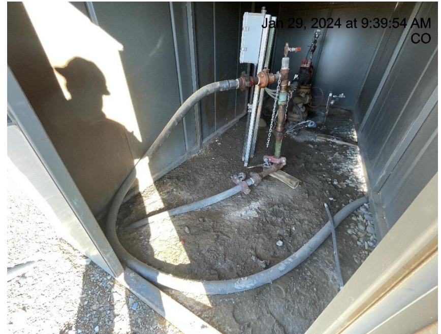
Photo # 4233 Line from PA 321-29 well flowline connected to line on DOE 2-W-29 injection well