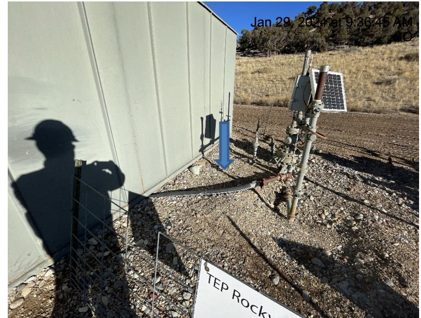
Photo # 4229 Line going from PA 321-29 well flowline to DOE 2-W-29 injection well