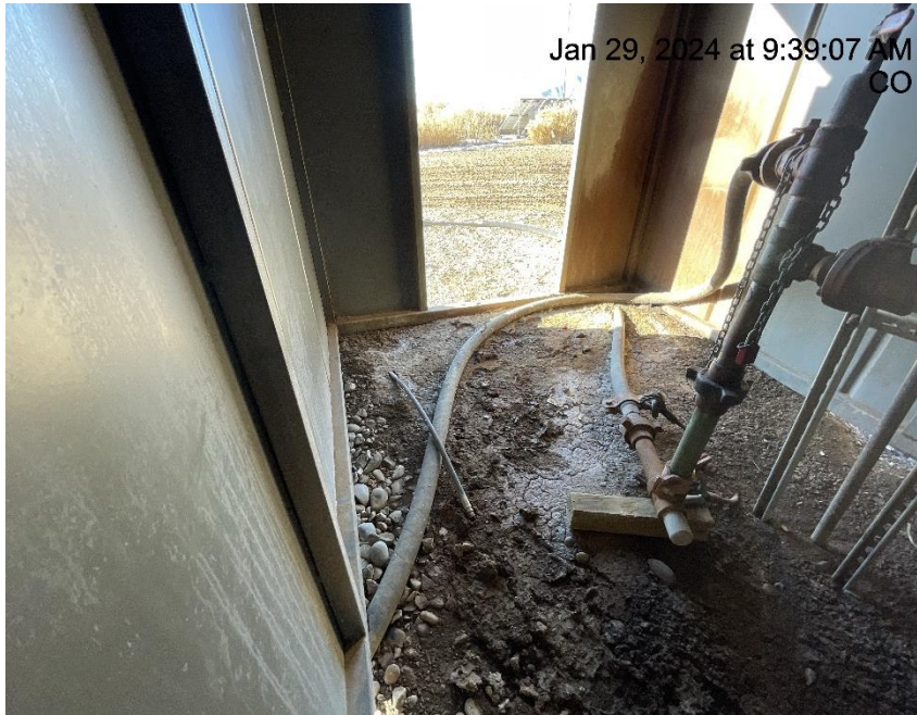
Photo # 4232 Line from PA 321-29 well flowline connected to line on DOE 2-W-29 injection well