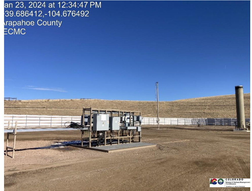
Pic 4 Electric, Flare, ECD.

an 23, 2024 at 12:34:47 PM 39.686412,-104.676492 rapahoe County ECMC