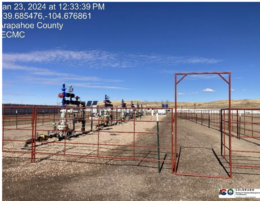
Pic 1 wellheads

Jan 23, 2024 at 12:33:39 PM 39.685476,-104.676861 Wapahoe County ECMC