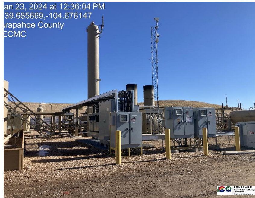
Pic 8 Electric, VRT, VRU, ECD.

an 23, 2024 at 12:36:04 PM 39.685669,-104.676147 rapahoe County ECMC