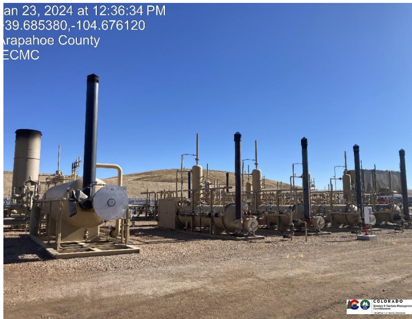
Pic 9 Separators

Jan 23, 2024 at 12:36:34 PM 39.685380,-104.676120 Wapahoe County ECMC