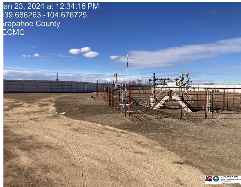
Pic 2 wellhead

Jan 23, 2024 at 12:34:18 PM 39.686263,-104.676725 Wapahoe County ECMC