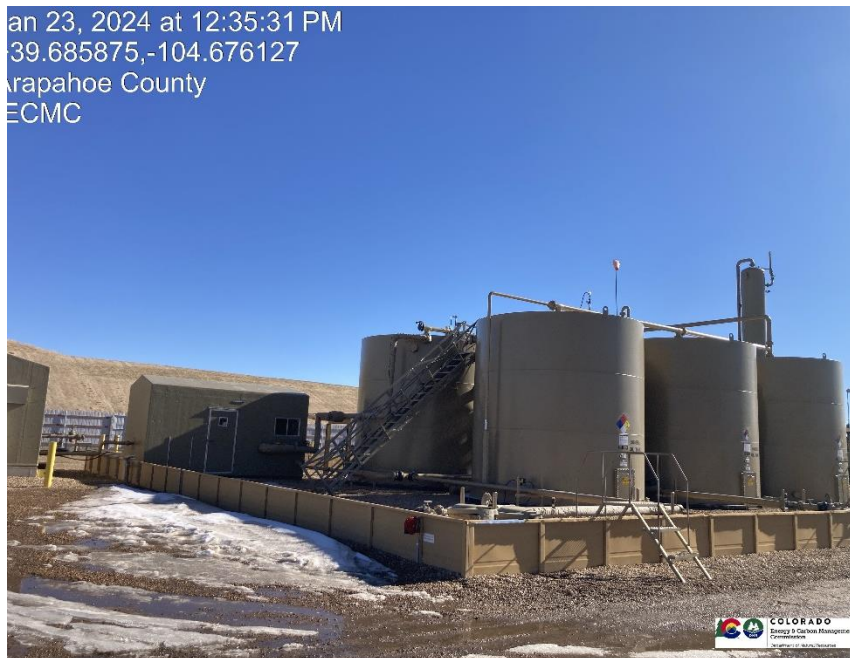
Pic 7 Tanks, LACT

an 23, 2024 at 12:35:31 PM 39.685875,-104.676127 rapahoe County ECMC