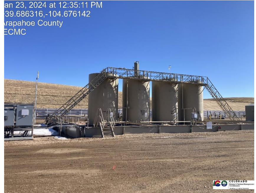
Pic 6 Tanks, VRT

an 23, 2024 at 12:35:11 PM 39.686316,-104.676142 rapahoe County ECMC