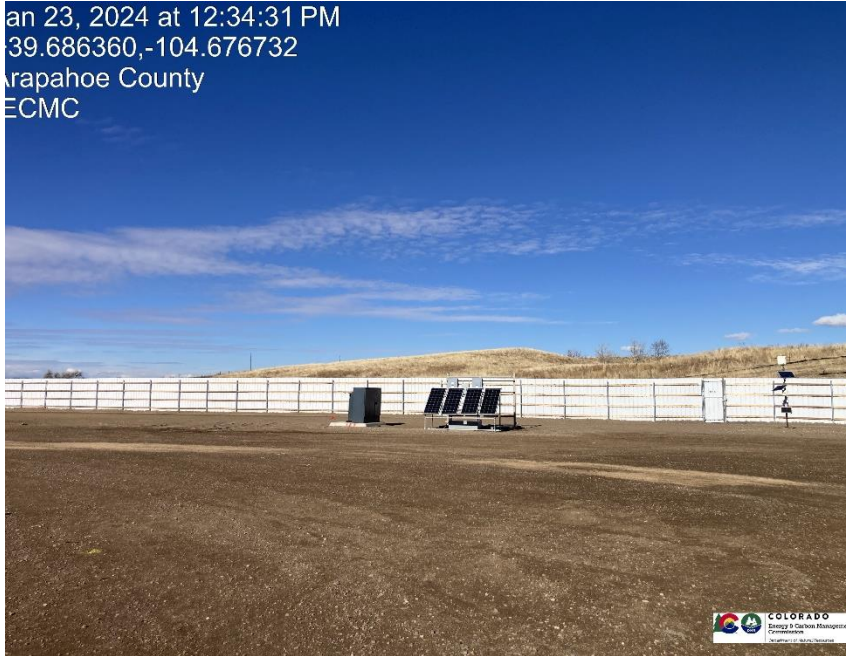
Pic 3 Solar / automation

an 23, 2024 at 12:34:31 PM 39.686360,-104.676732 rapahoe County ECMC