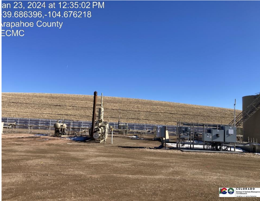
Pic 5 Separators, GMR, Electric, VRU

an 23, 2024 at 12:35:02 PM 39.686396,-104.676218 rapahoe County ECMC