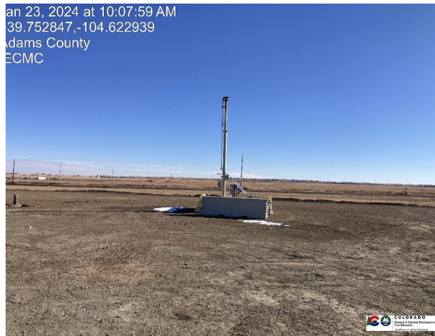
Pic 5 Flare (unused)