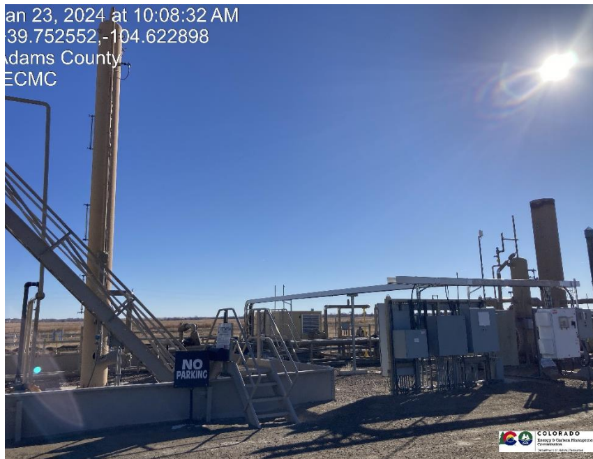
Pic 7 VRT, VRU, electric

an 23, 2024 at 10:08:32 AM 39.752552,-104.622898 Adams County ECMC