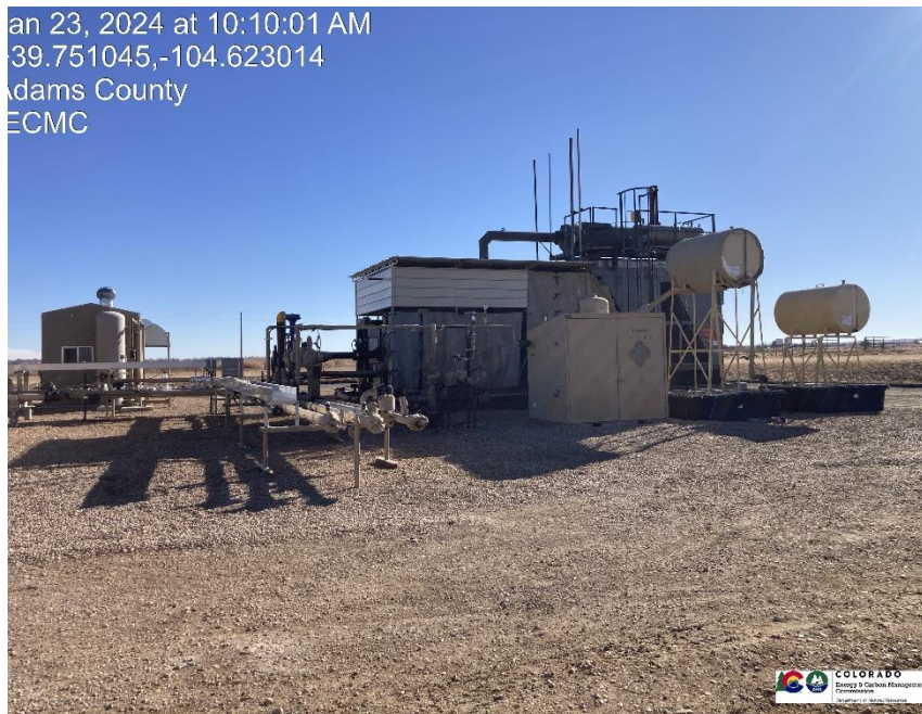
Pic 12 Compressor

an 23, 2024 at 10:10:01 AM 39.751045,-104.623014 Adams County ECMC