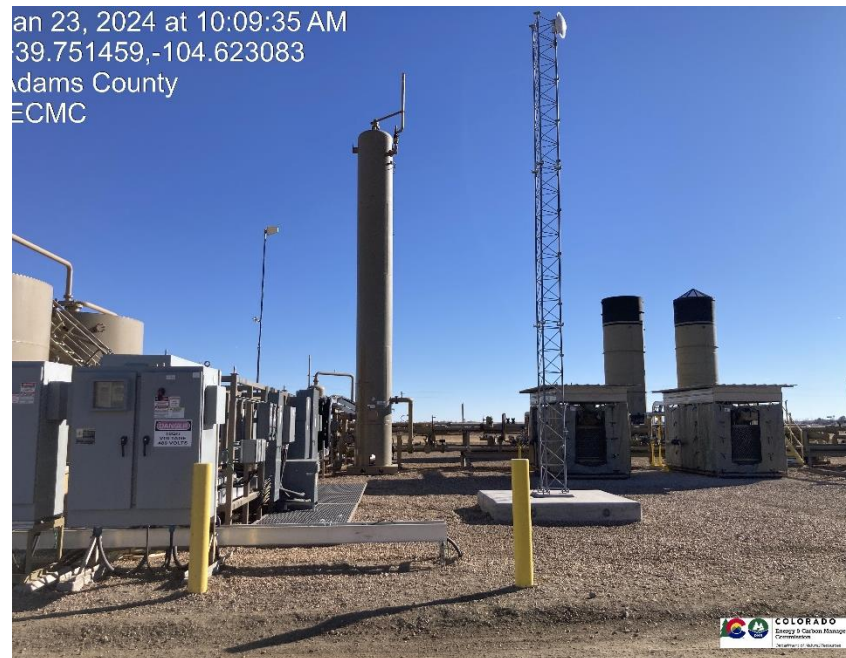
Pic 10 VRT, VRU, electric

an 23, 2024 at 10:09:35 AM 39.751459,-104.623083 Adams County ECMC