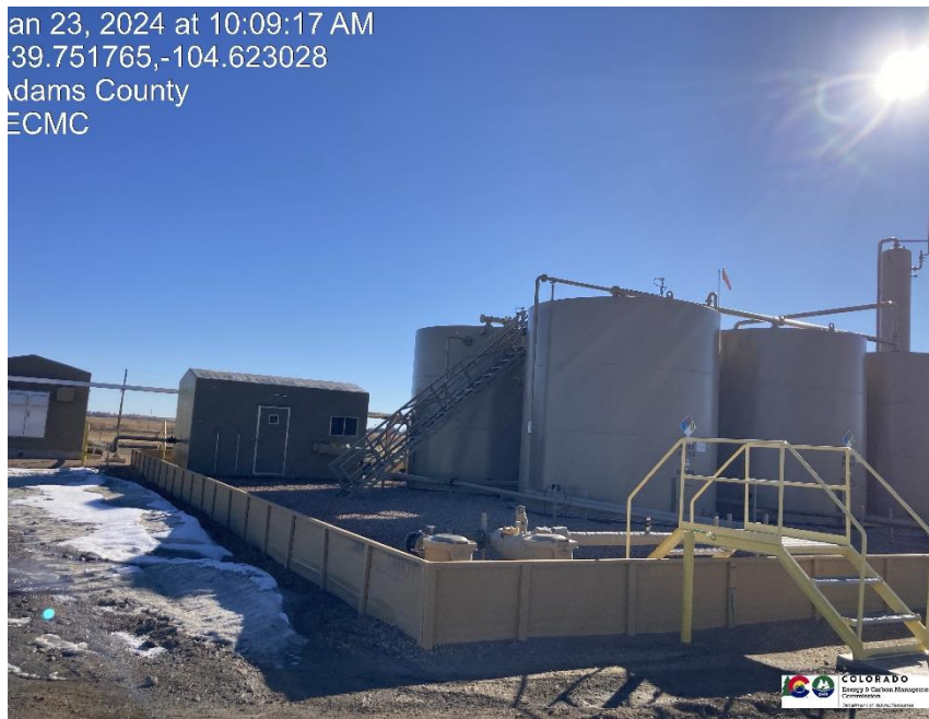
Pic 9 Tanks, LACT

an 23, 2024 at 10:09:17 AM 39.751765,-104.623028 Adams County ECMC