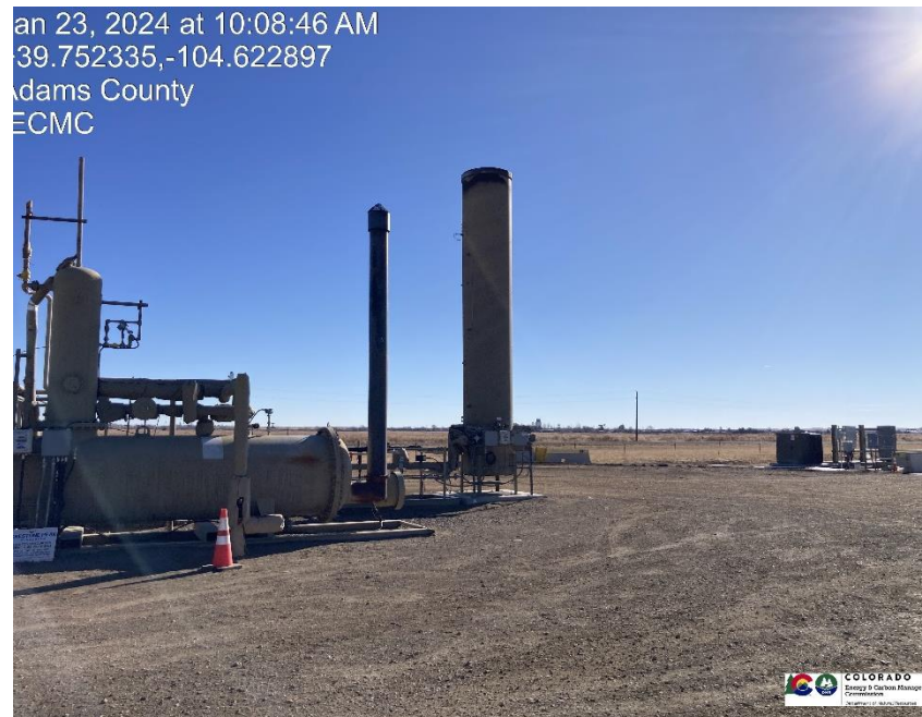
Pic 8 ECD, Separator, electric

an 23, 2024 at 10:08:46 AM 39.752335,-104.622897 Adams County ECMC