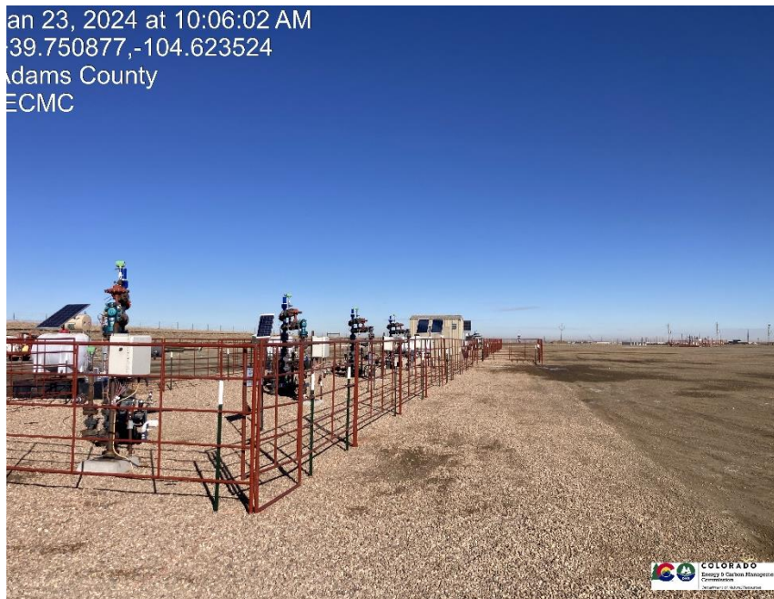
Pic 1 wellheads

an 23, 2024 at 10:06:02 AM 39.750877,-104.623524 Adams County ECMC