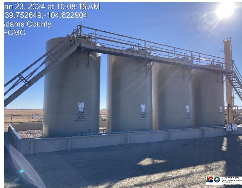
Pic 6 Tanks