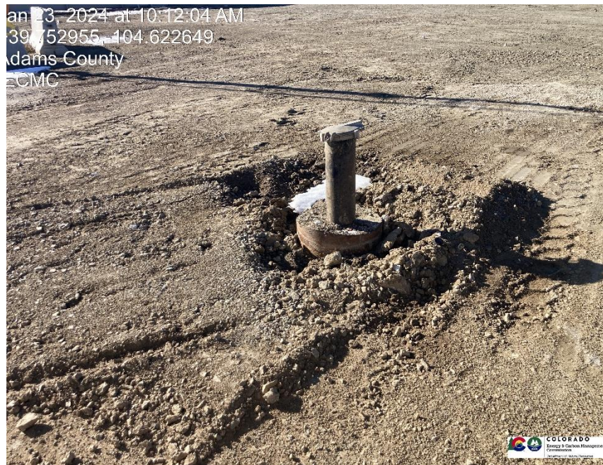
Pic 3 Water well