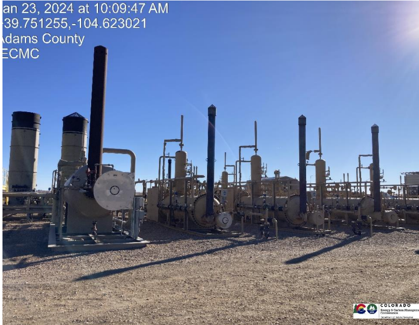
Pic 11 Separators, ECD

Jan 23, 2024 at 10:09:47 AM 39.751255,-104.623021 Adams County ECMC