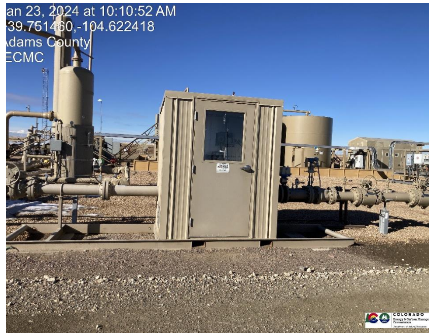
Pic 13 GMR

an 23, 2024 at 10:10:52 AM 39.751460,-104.622418 Adams County ECMC