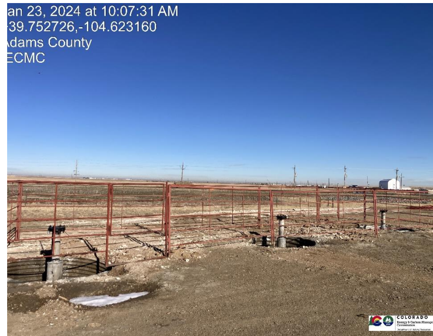
Pic 4 Plugged wells on location.