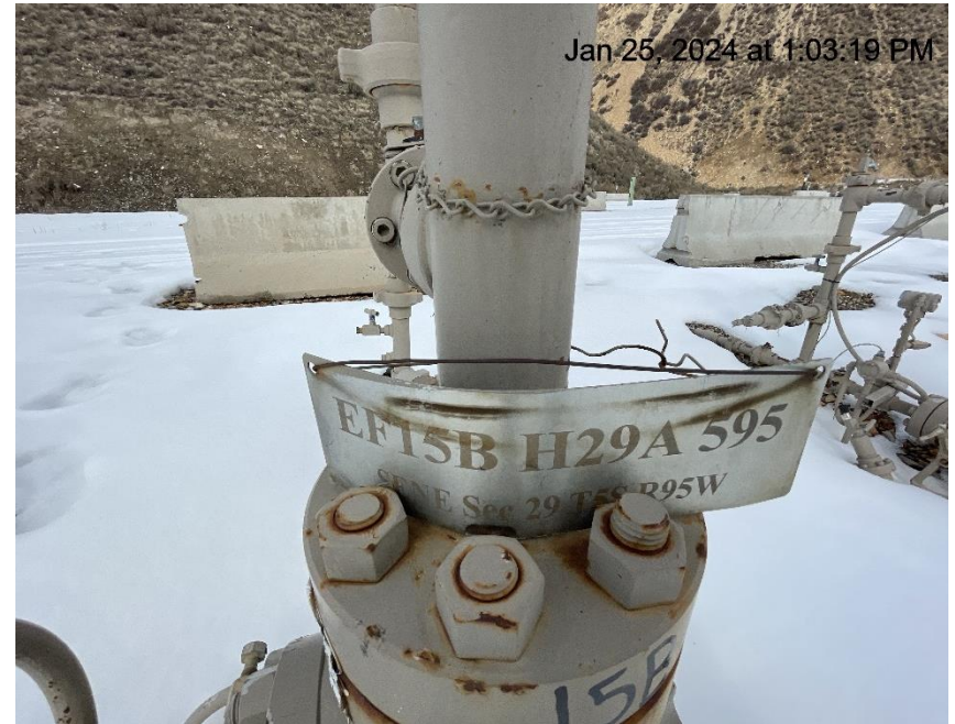
Photo # 4018 All wellhead signs on location lack required information/wellhead signage insufficient/signs are not in compliance with CECMC rules