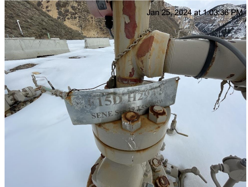
Photo # 4017 All wellhead signs on location lack required information/wellhead signage insufficient/signs are not in compliance with CECMC rules