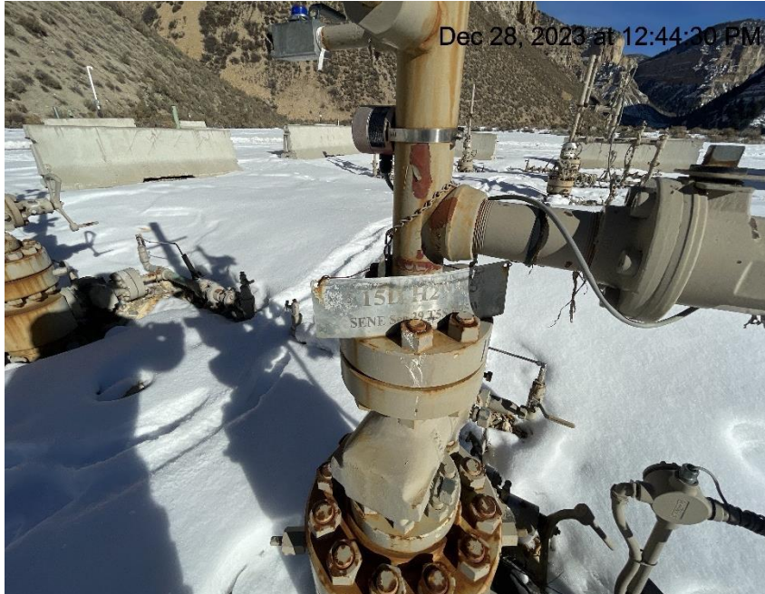
Photo # 1207 From inspection 708902630 conducted on 12/28/2023 All wellhead signs on location lack required information/wellhead signage insufficient/signs are not in compliance with CECMC rules