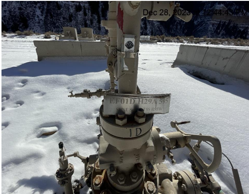
Photo # 1209 From inspection 708902630 conducted on 12/28/2023 All wellhead signs on location lack required information/wellhead signage insufficient/signs are not in compliance with CECMC rules