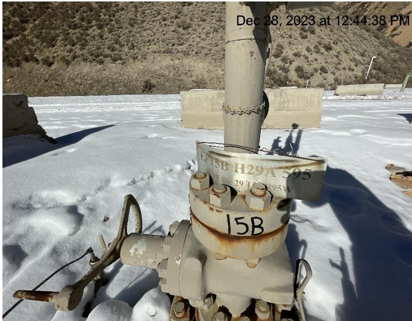
Photo # 1208 From inspection 708902630 conducted on 12/28/2023 All wellhead signs on location lack required information/wellhead signage insufficient/signs are not in compliance with CECMC rules