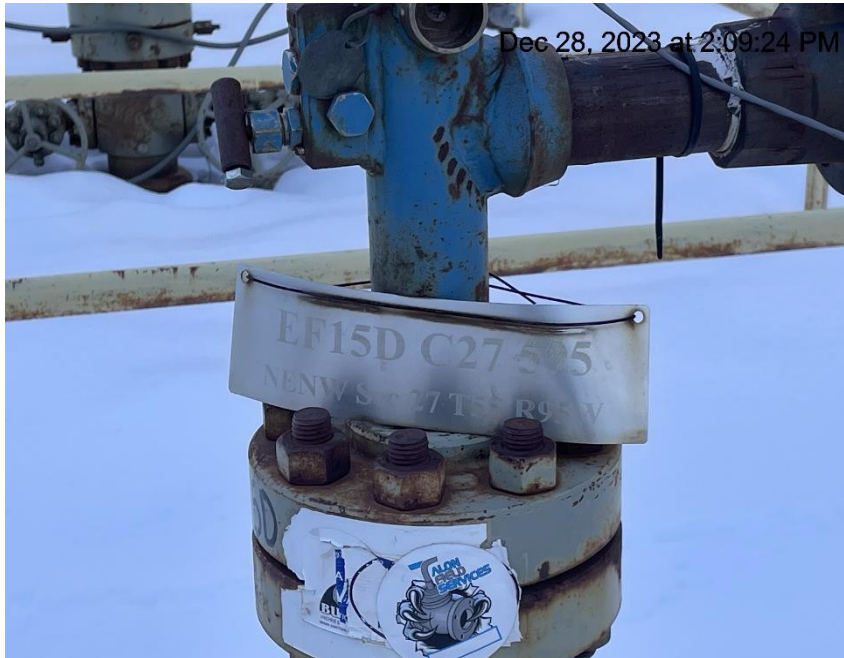
Photo # 1367 From inspection 708902651 conducted on 12/28/2023 Wellhead sign lacks required info/sign in not in compliance with CECMC rules