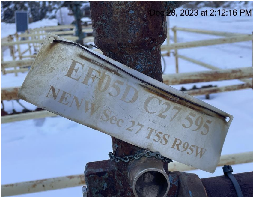
Photo # 1368 From inspection 708902651 conducted on 12/28/2023 Wellhead sign lacks required info/sign in not in compliance with CECMC rules