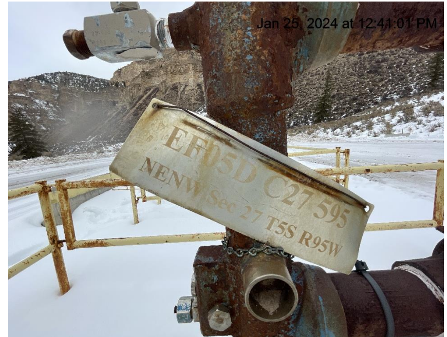
Photo # 3980 Wellhead sign lacks required info/sign in not in compliance with CECMC rules