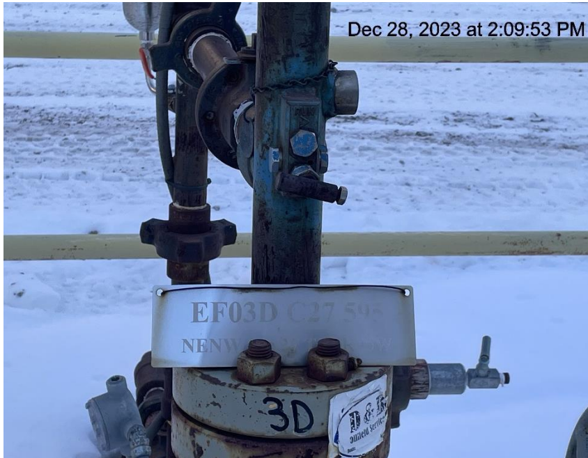
Photo # 1369 From inspection 708902651 conducted on 12/28/2023 Wellhead sign lacks required info/sign in not in compliance with CECMC rules