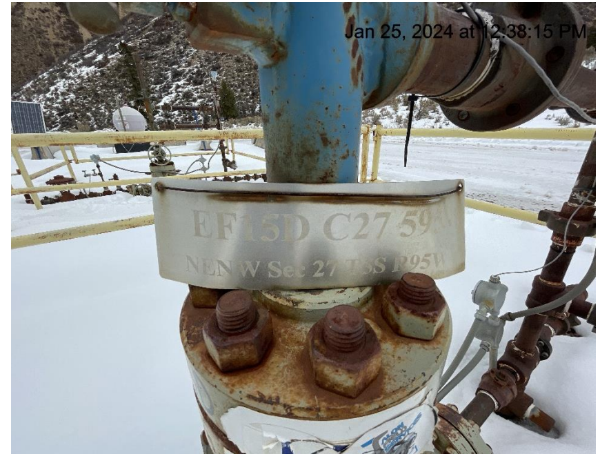
Photo # 3979 Wellhead sign lacks required info/sign in not in compliance with CECMC rules