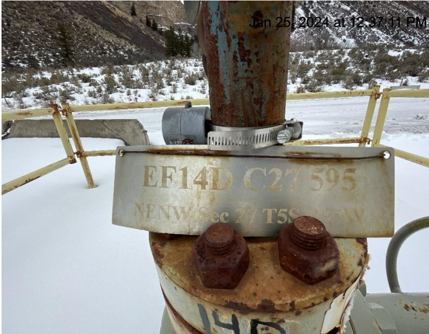
Photo # 3982 Wellhead sign lacks required info/sign in not in compliance with CECMC rules