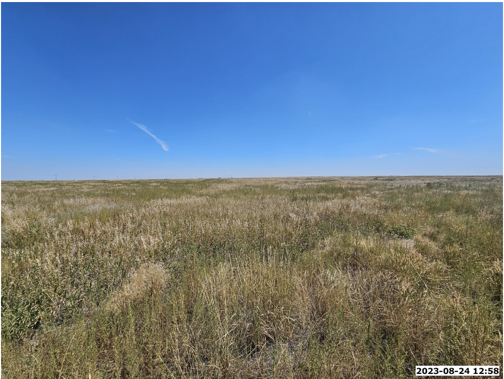
VIEW - EAST