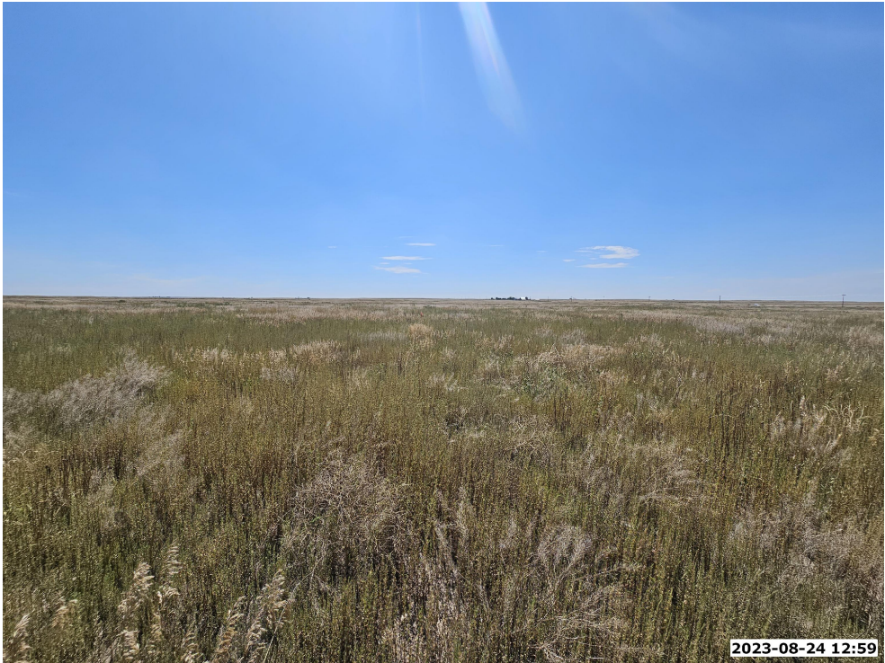
VIEW - SOUTH