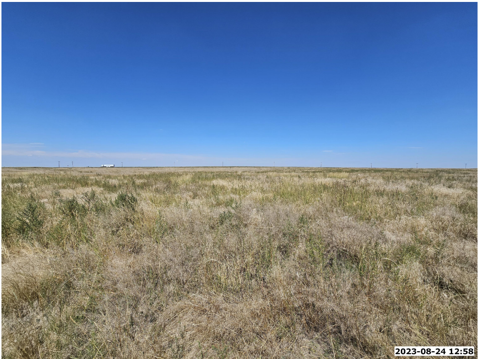
VIEW - NORTH