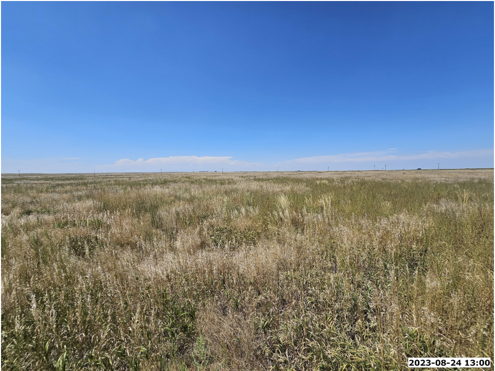
VIEW - WEST