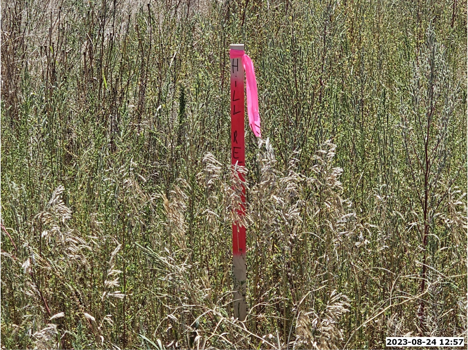
VIEW - CLOSE UP