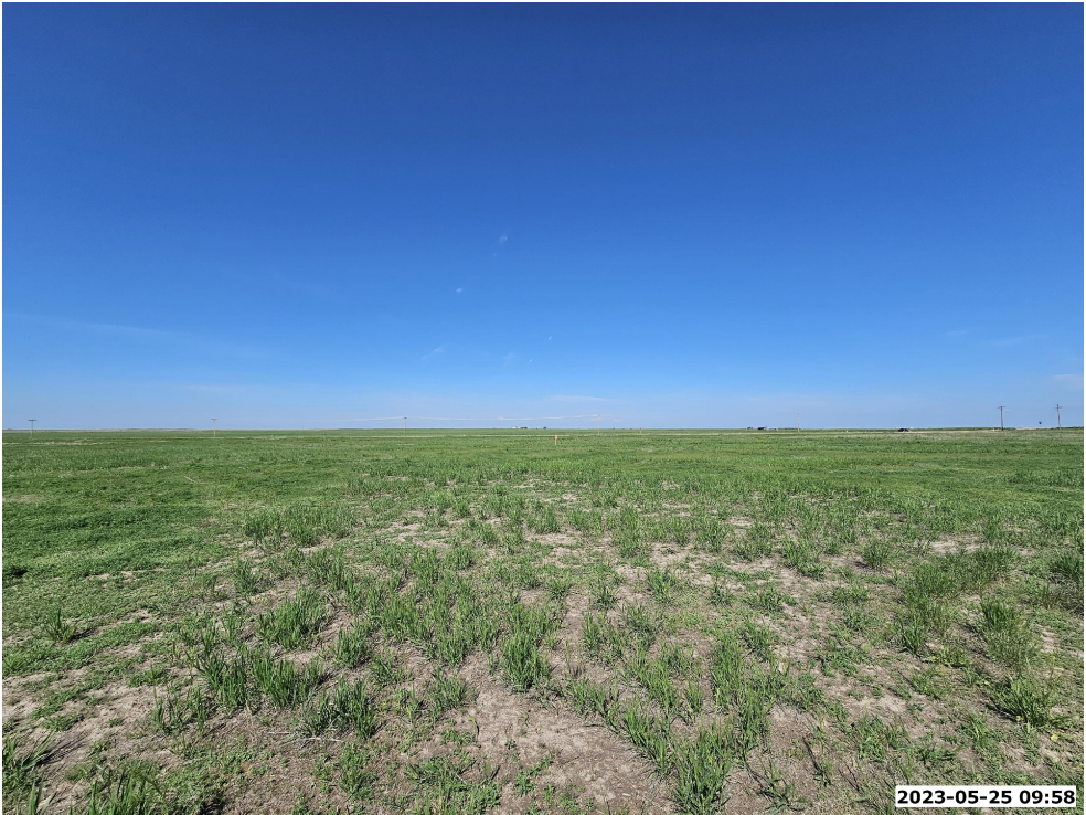
LOCATION PICTURE OF HILL 2527 WELL PAD - CAMERA VIEW WEST

K:\VERDAD\2022_199_HILL_2527\T8N_R60W_SEC_30DWGHILL_2527_T8N_R60W_SEC_30.dwg, 8/3/2023 11:05:09 PM, ssundberg