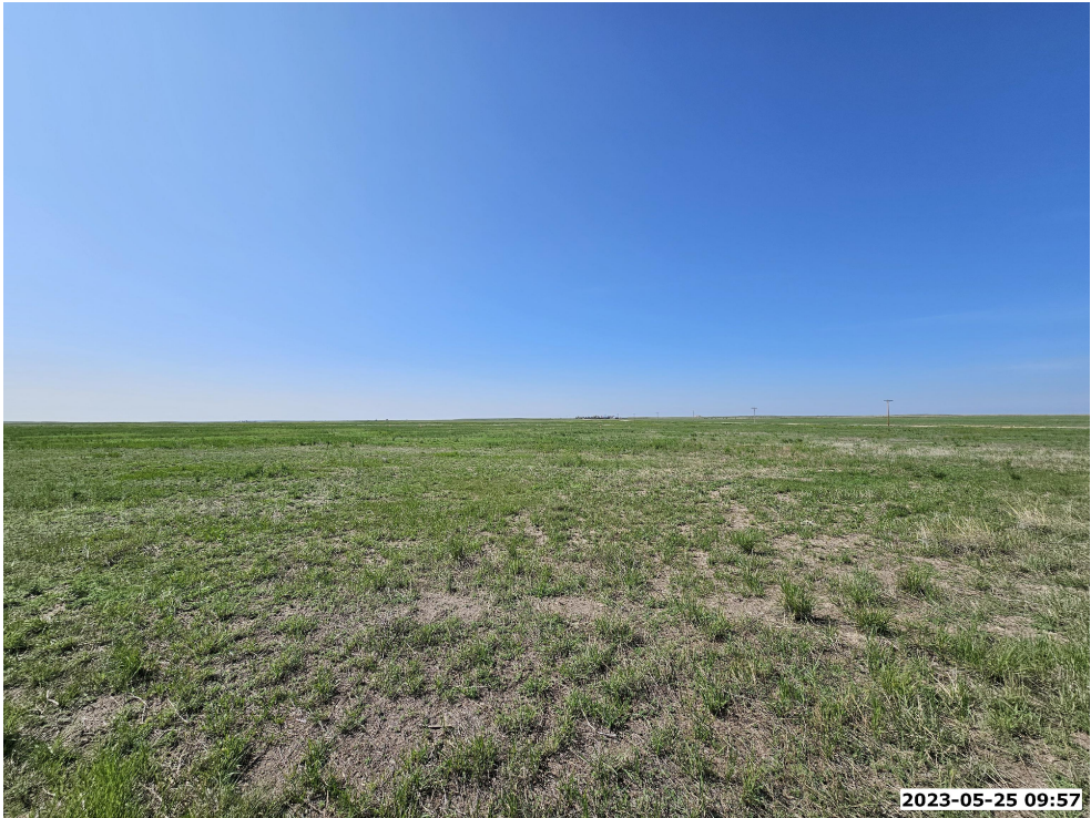
LOCATION PICTURE OF HILL 2527 WELL PAD - CAMERA VIEW SOUTH