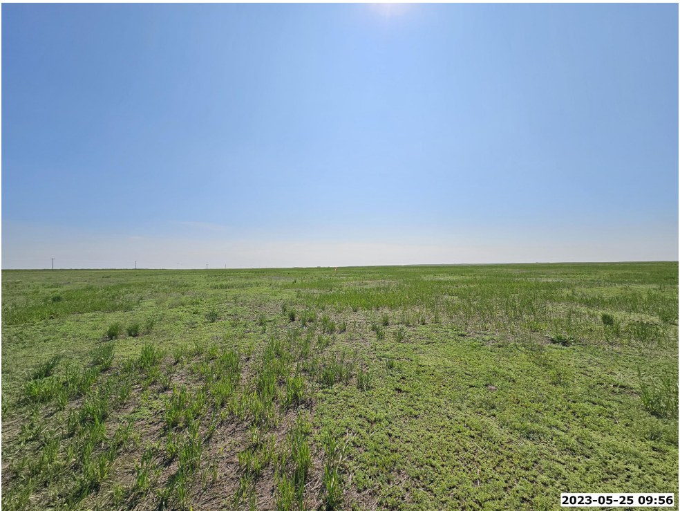
LOCATION PICTURE OF HILL 2527 WELL PAD - CAMERA VIEW EAST