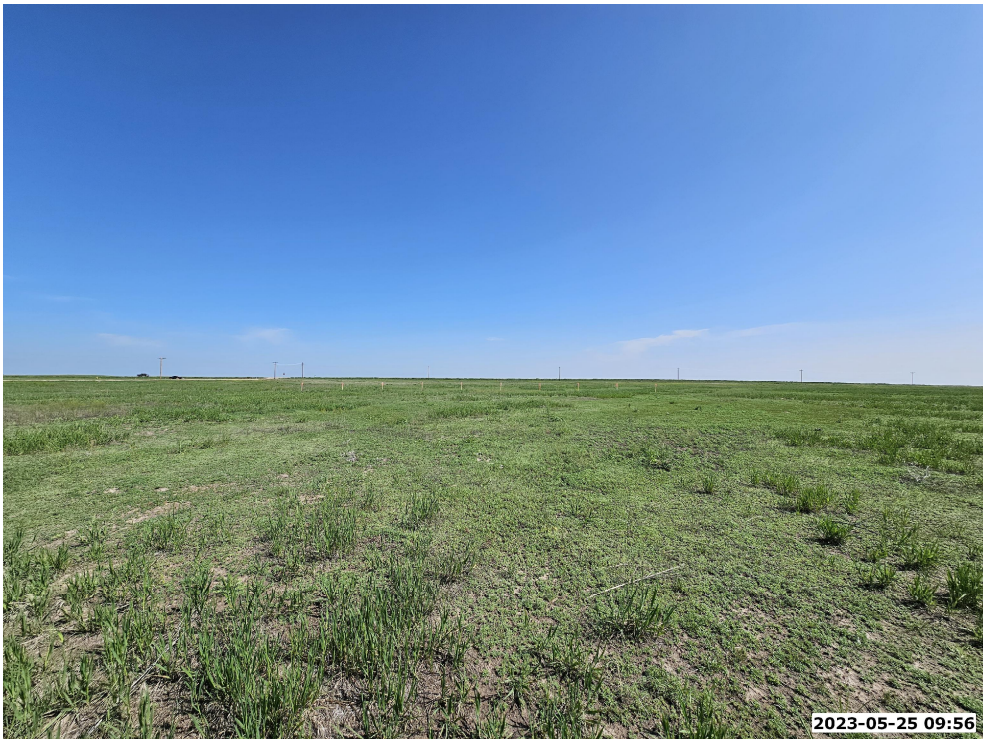
LOCATION PICTURE OF HILL 2527 WELL PAD - CAMERA VIEW NORTH

NW1/4 NW1/4 SECTION 30, TOWNSHIP 8 NORTH, RANGE 60 WEST, 6TH P.M., WELD COUNTY, COLORADO