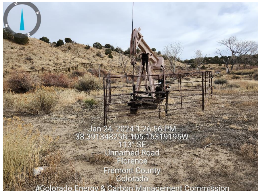
Photo 4 well head