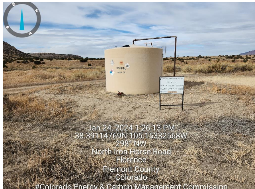
Photo 2 TNK BTRY