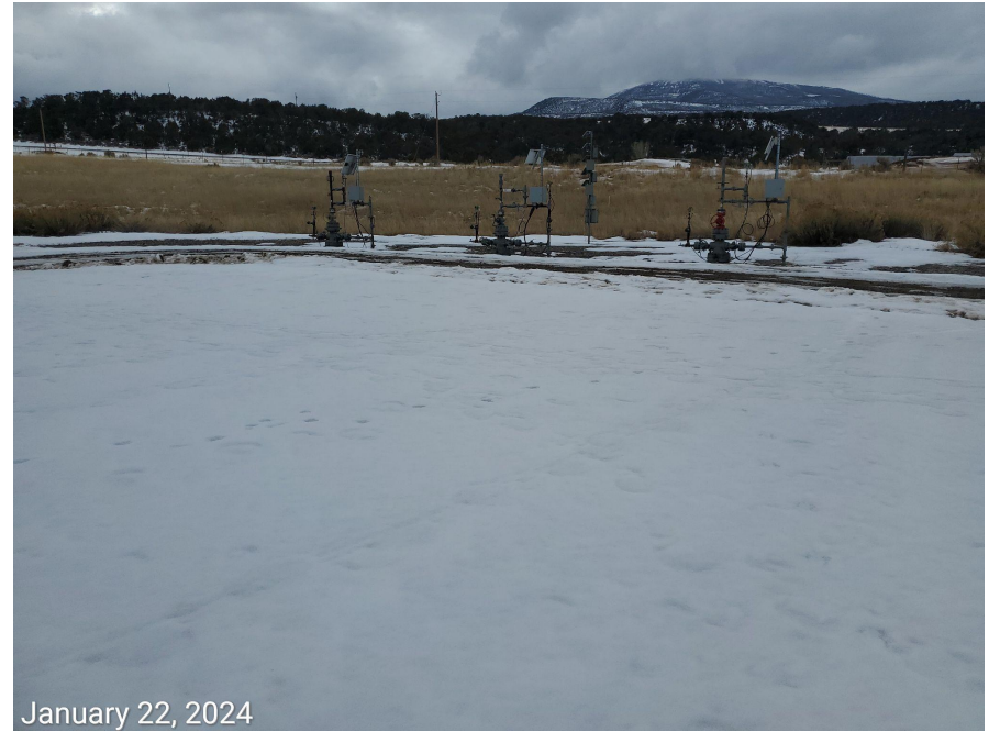
Photo 1: Photos 1-2 taken from the east end of the Location. Photos provide an overview of the Location from south, southwest, northwest and north.