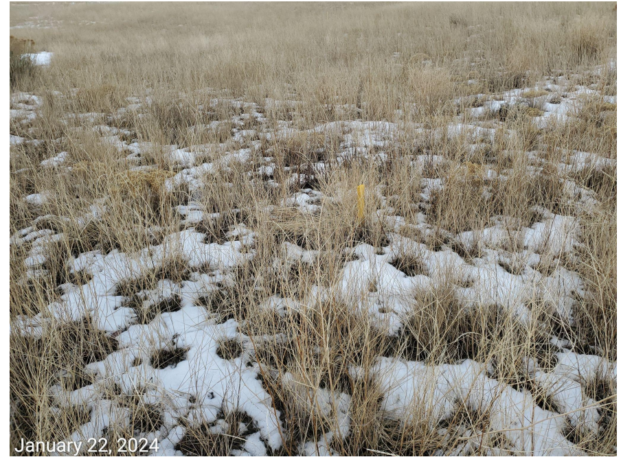
Photo 3: Example of anchor markers that do not comport with 1003.a / 606.j