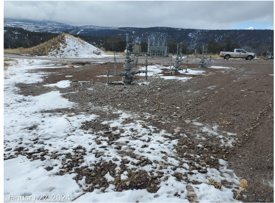
Photo 1: Photos 1-2 taken from the east end of the Location. Photos provide an overview of the Location from southwest, northwest, north to northeast.