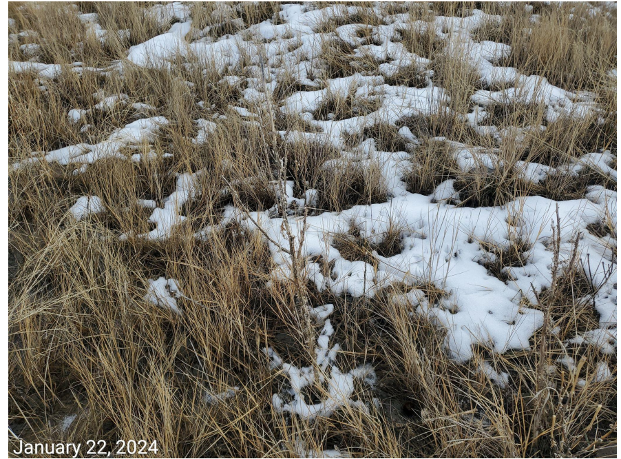
Photo 3: Photos taken from the interim areas. Photos examples showing Noxious weed (Musk thistle) remnants established during the prior growing season. Additional weed management efforts required during the 2024 growing season.