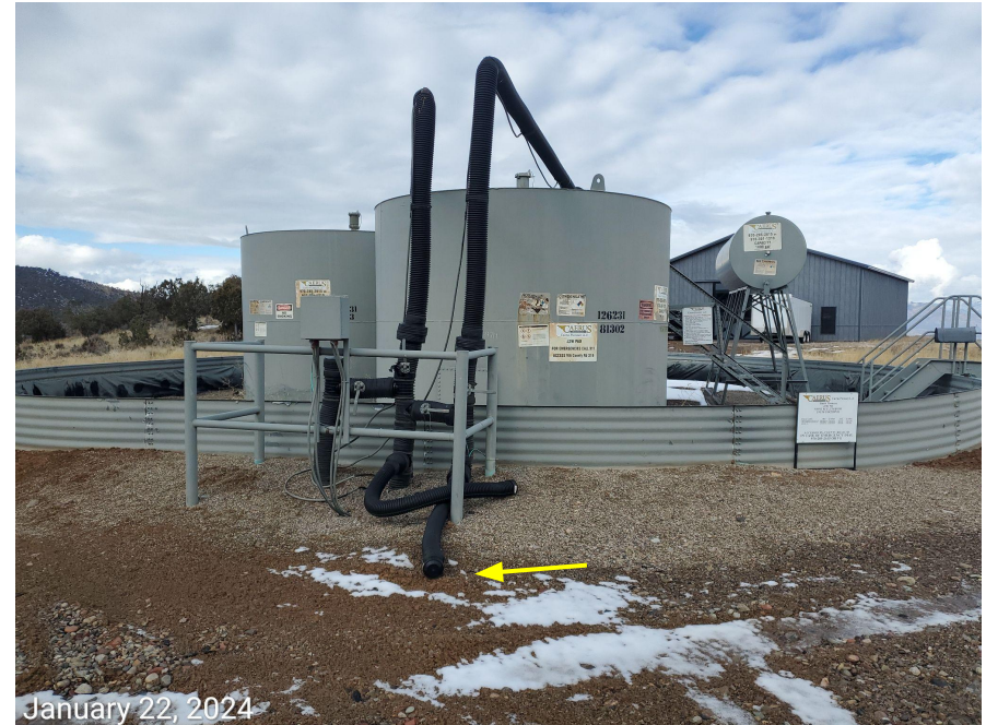
Photo 5: Photo left shows piping at separator equipment lacks BMPs to prevent wildlife entry; pipe is open ended. Photo right example showing piping at tank battery Location with adequate wildlife protection BMPs at piping.