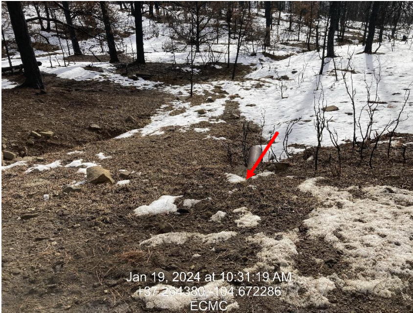
Photo 5 – Open End of Plugged Culvert at Lat 37.26438; Long -104.67228