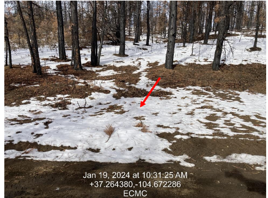
Photo 6 – Plugged end of Culvert at Lat 37.26438; Long -104.67228