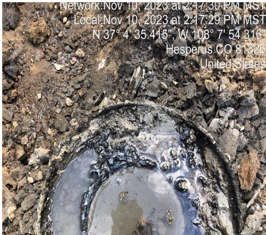
Cement to surface.