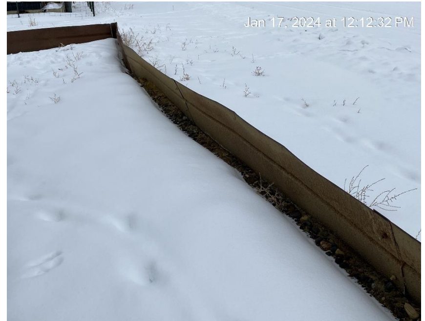
Metal berm inadequate