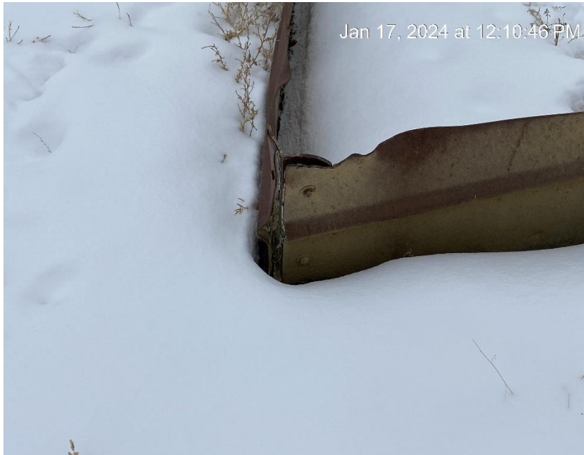
Corner caulking cracks