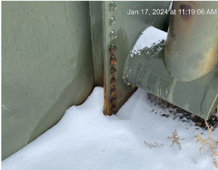
Leaking oil tank