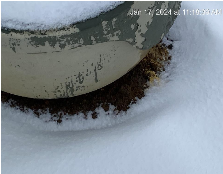
Staining under loadline pot