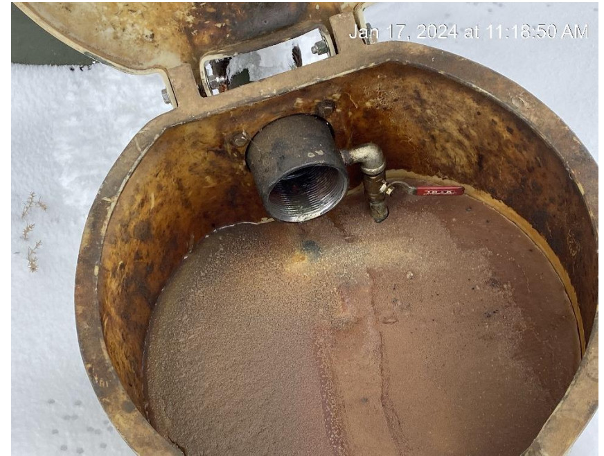
Open ended loadline