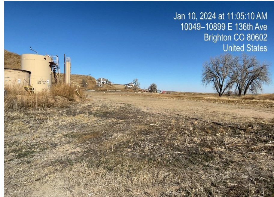
Photo 6. Photo of harvested crop field around location. Photo taken facing northeast.