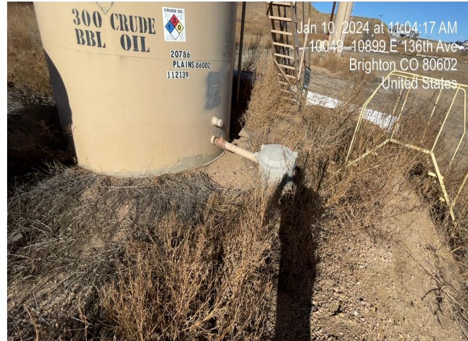
Photo 4. Photo taken of weeds kochia & Russian thistle). Photo taken facing east.