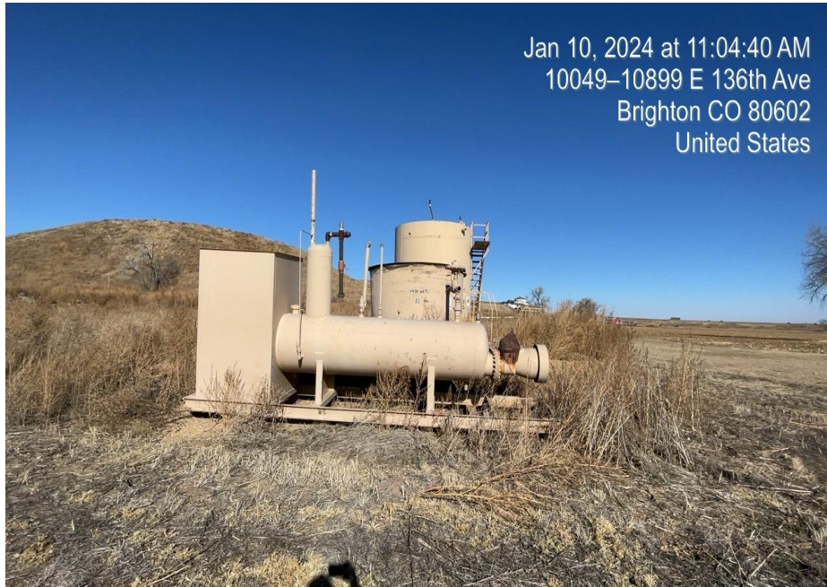
Photo 5. Photo taken of weeds on site around equipment. Photo taken facing northeast.