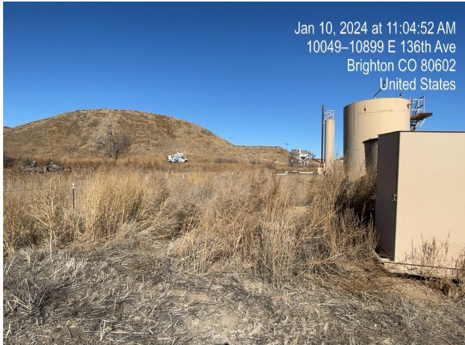
Photo 3. Photo taken of weeds (kochia) around equipment and tanks. Photo taken facing northeast.