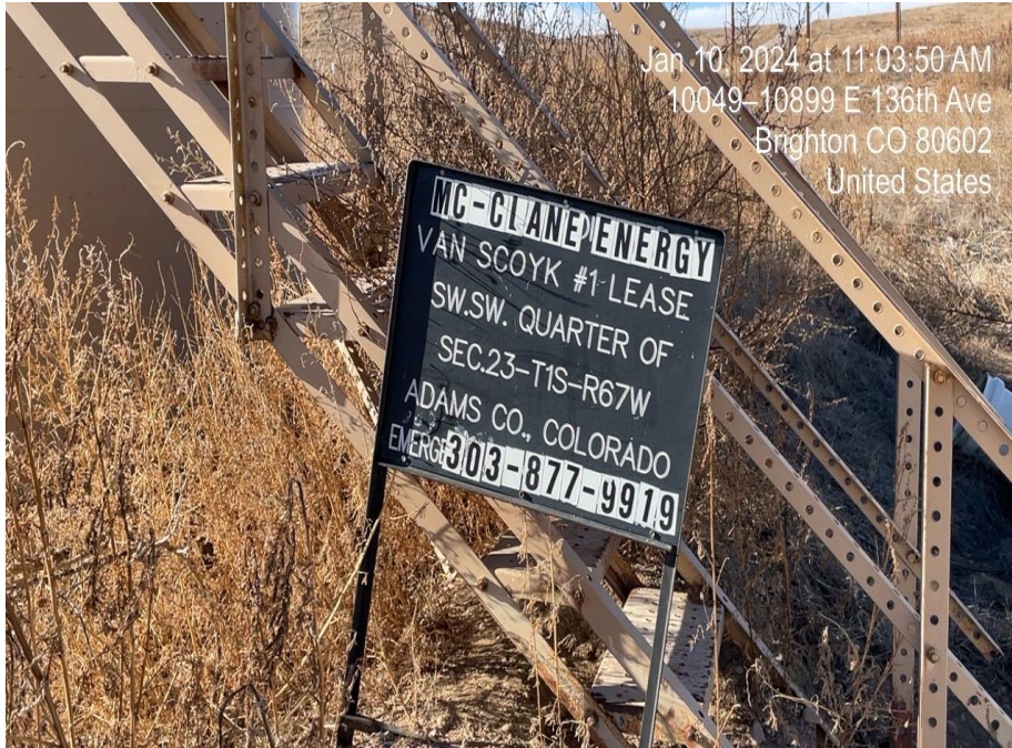
Photo 1. Photo taken of location sign, facing northwest.