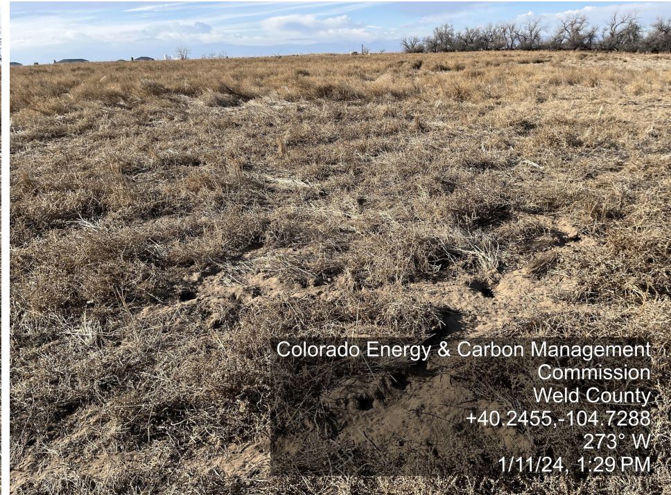
Photo 3. The photo was taken at the well location facing South. Refer to the comment from photo 2.

Photo 4. The photo was taken at the well location facing West. Refer to the comment from photo 2.