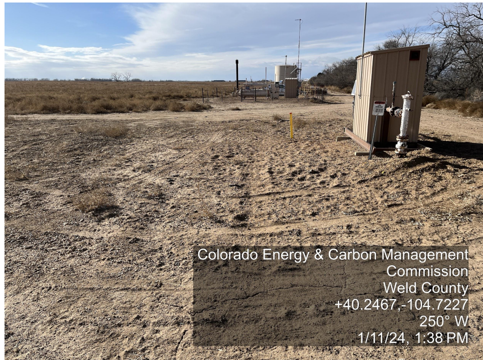
Photo 6. The photo was taken at the tank battery location facing West. The photo illustrates equipment remains at the location.