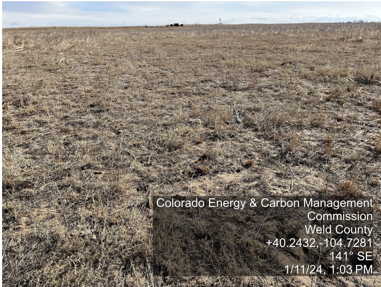
Photo 7. The reference photo was taken near the well location facing Southeast.