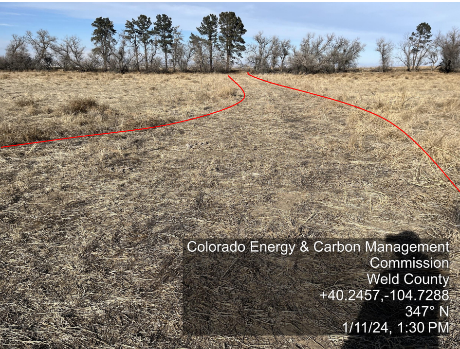
Photo 5. The photo was taken at the well location facing North. The photo illustrates the access road.