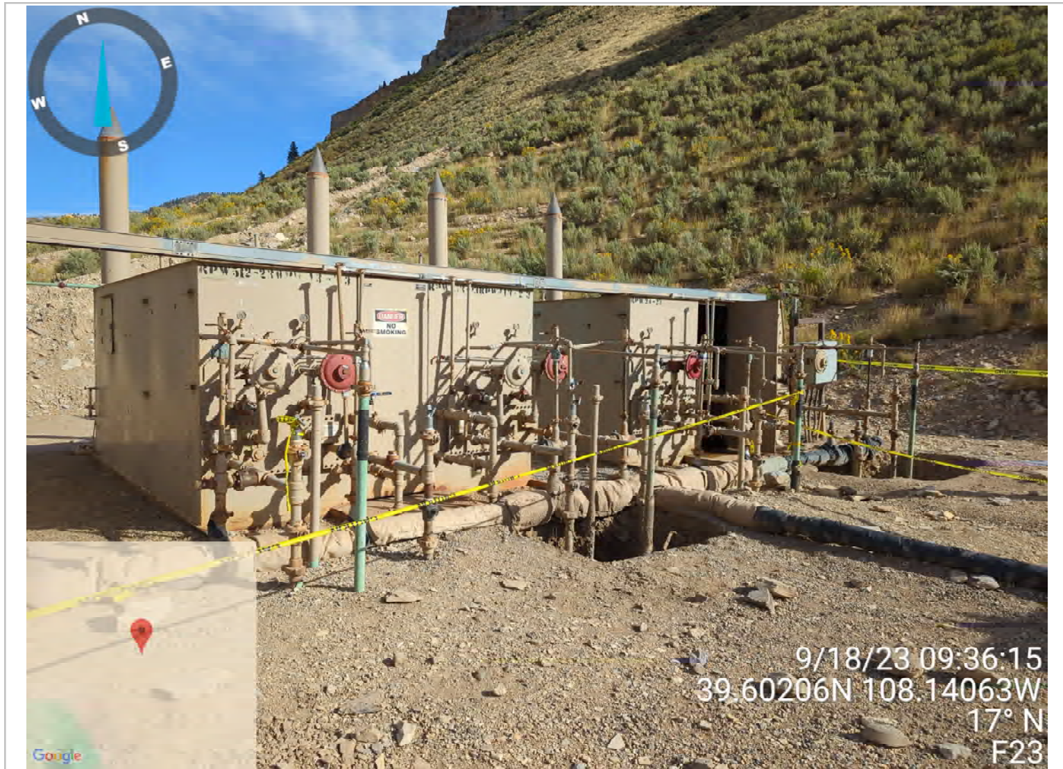
Separator Overview: View North