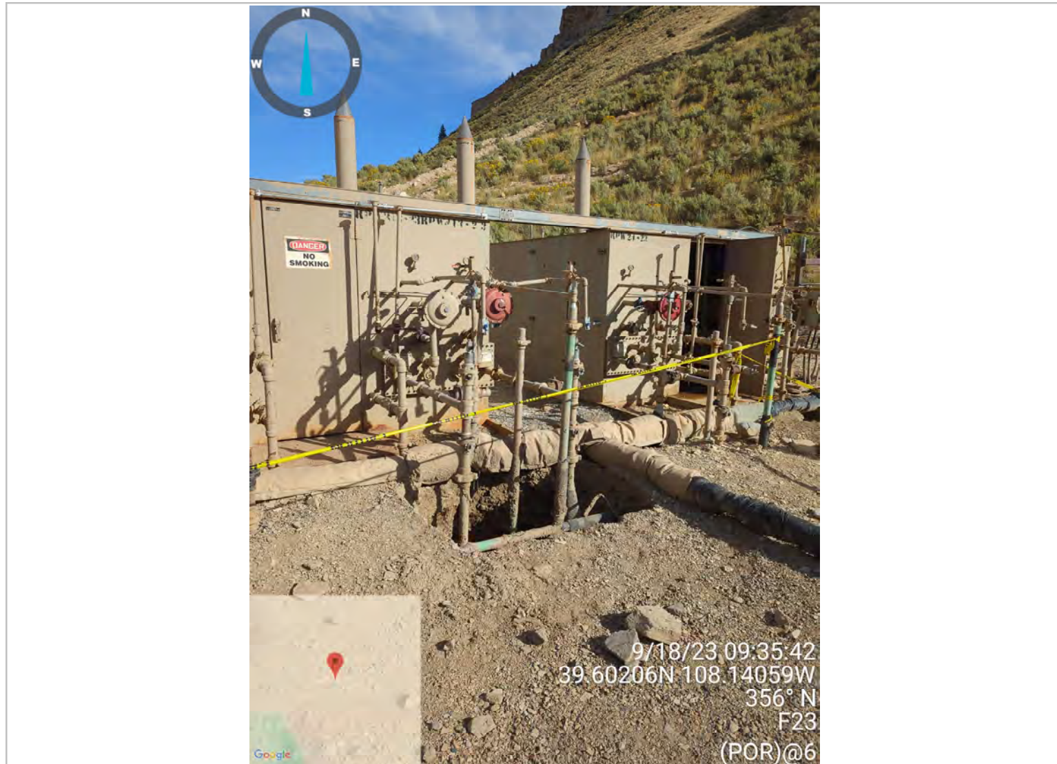
Excavation Overview: View North