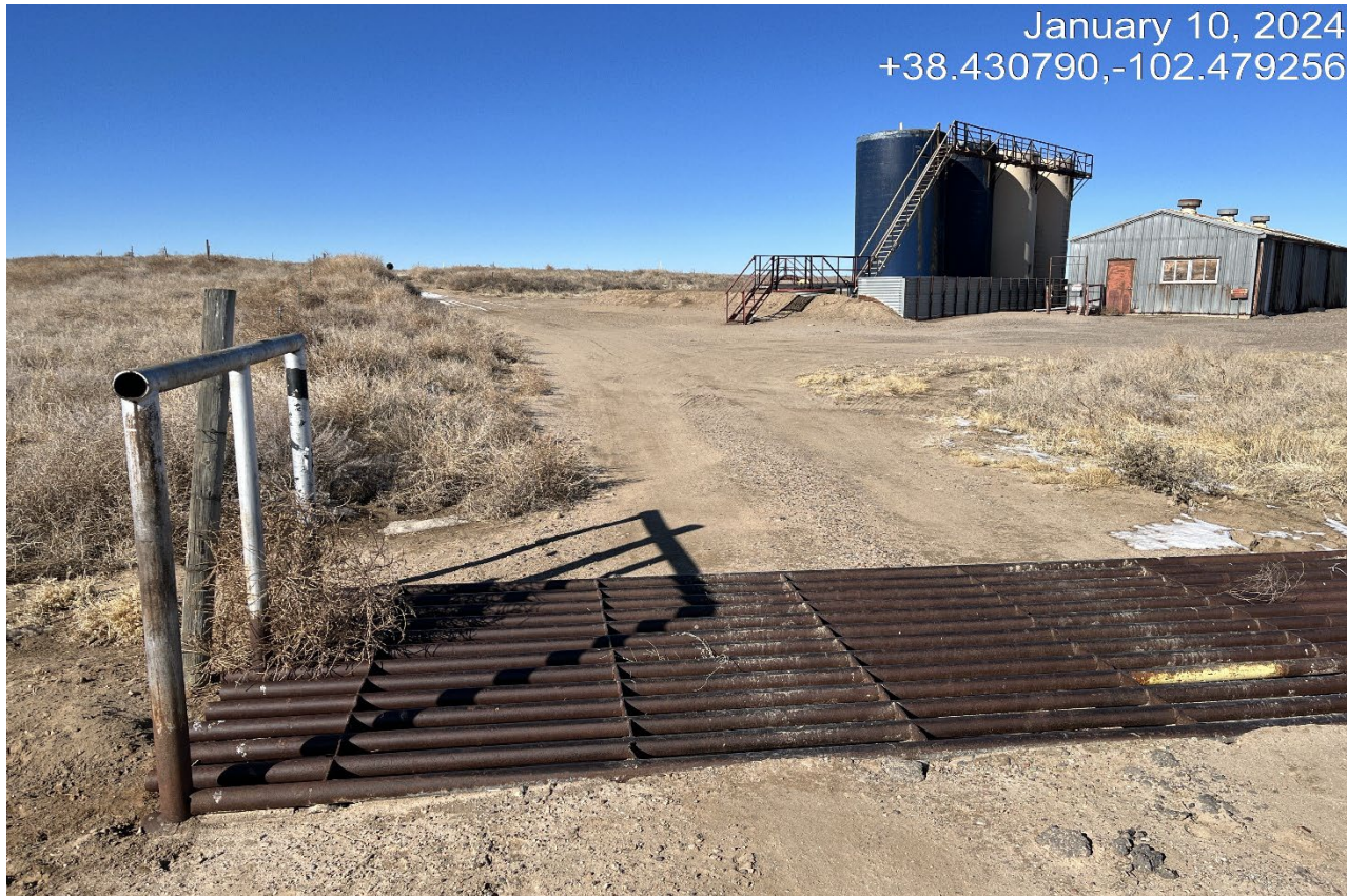
Photo 1. Facing northwest toward the location.