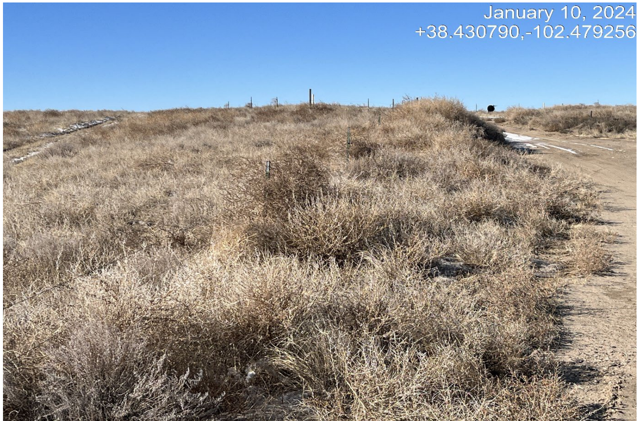
Photo 2. There is tall undesirable weed debris around the perimeter that needs to be controlled and removed. The debris is up against the electric fence which is a fire hazard.