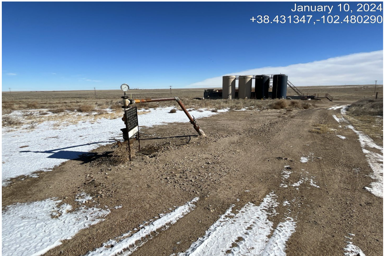
Photo 9. Standing at the wellhead facing east. Sign is posted at wellhead.