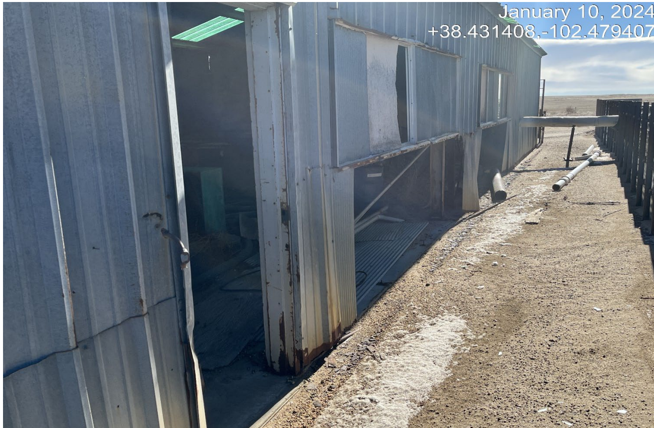
Photo 4. There was pieces of tin rattling and loose along the vack side of the storage shed.