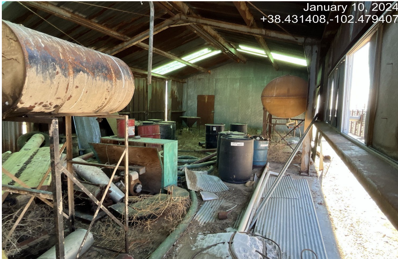
Photo 6. There is various chemical drums containers and debris which is an extreme fire hazard that must be cleaned up.