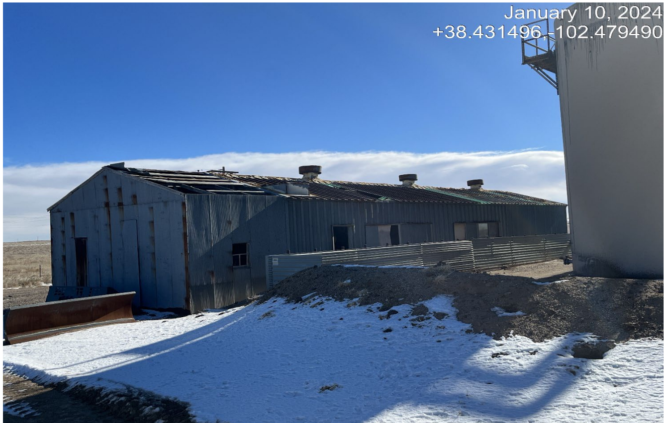
Photo 3. Facing southeast toward the storage shed adjacent to the tank battery. The tin roof has blown off and it appears more of the shed is close to blowing away.