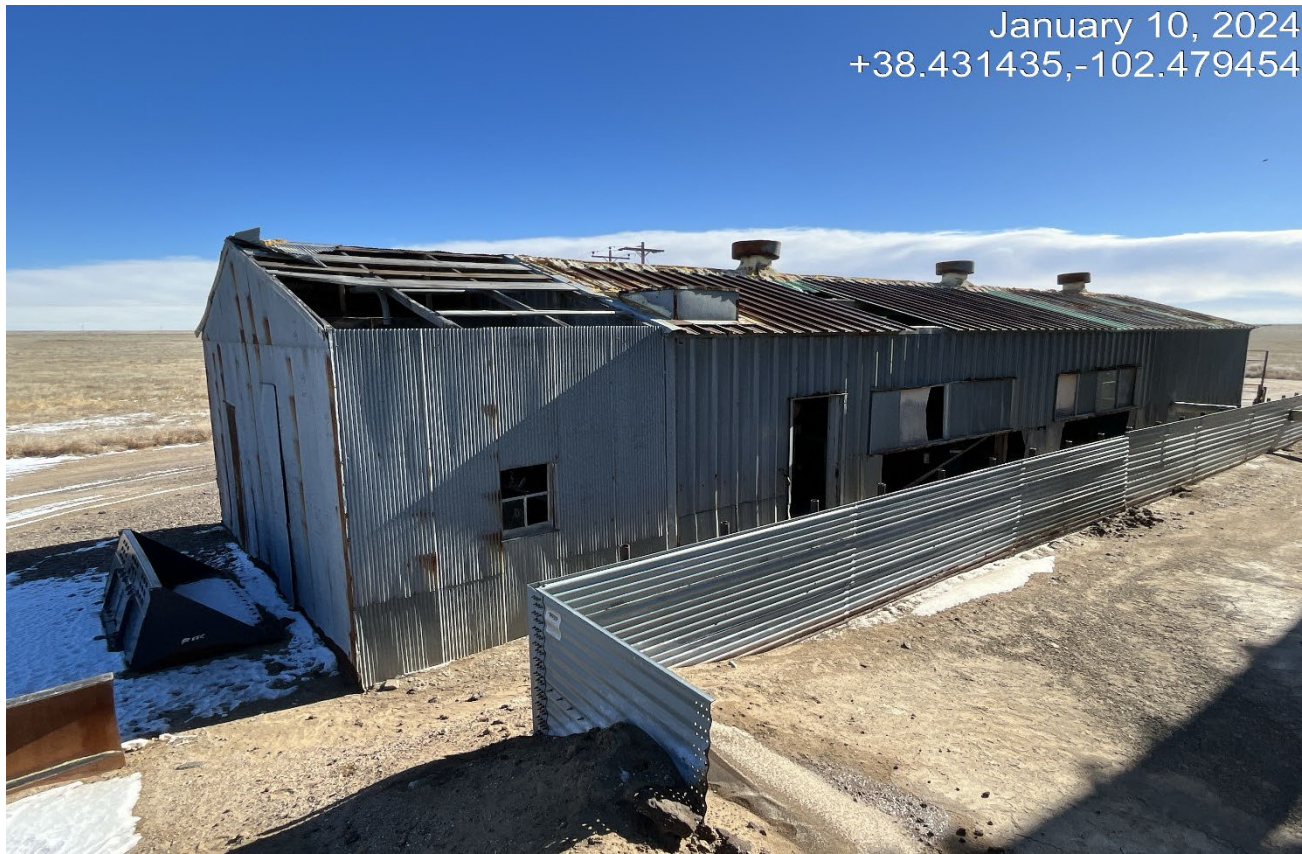
Photo 8. Facing southeast toward the storage shed adjacent to the tank battery. The tin roof has blown off and there was rattling indicating more tin may fall off.