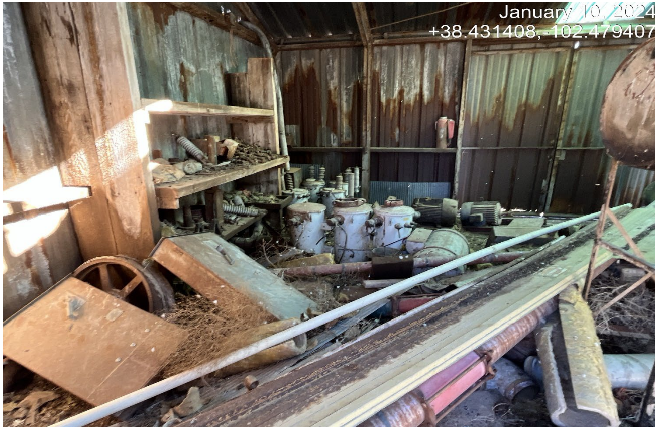
Photo 5. Inside the shed is various debris, parts, and trash which is an extreme fire hazard.