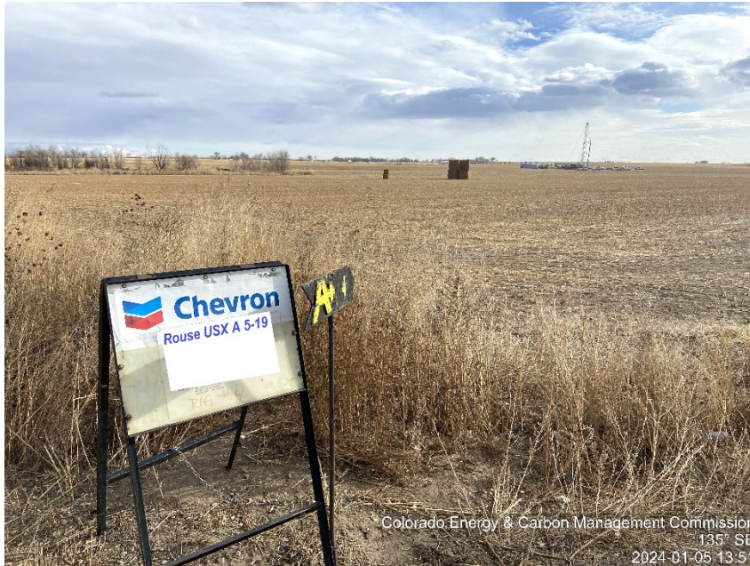
Photo #3 Rouse-USX A 5-19 Wellsite Plugged & Abandoned | PA Plugging Ops; Suspended: Strong Wind Wellsite entrance prior photo