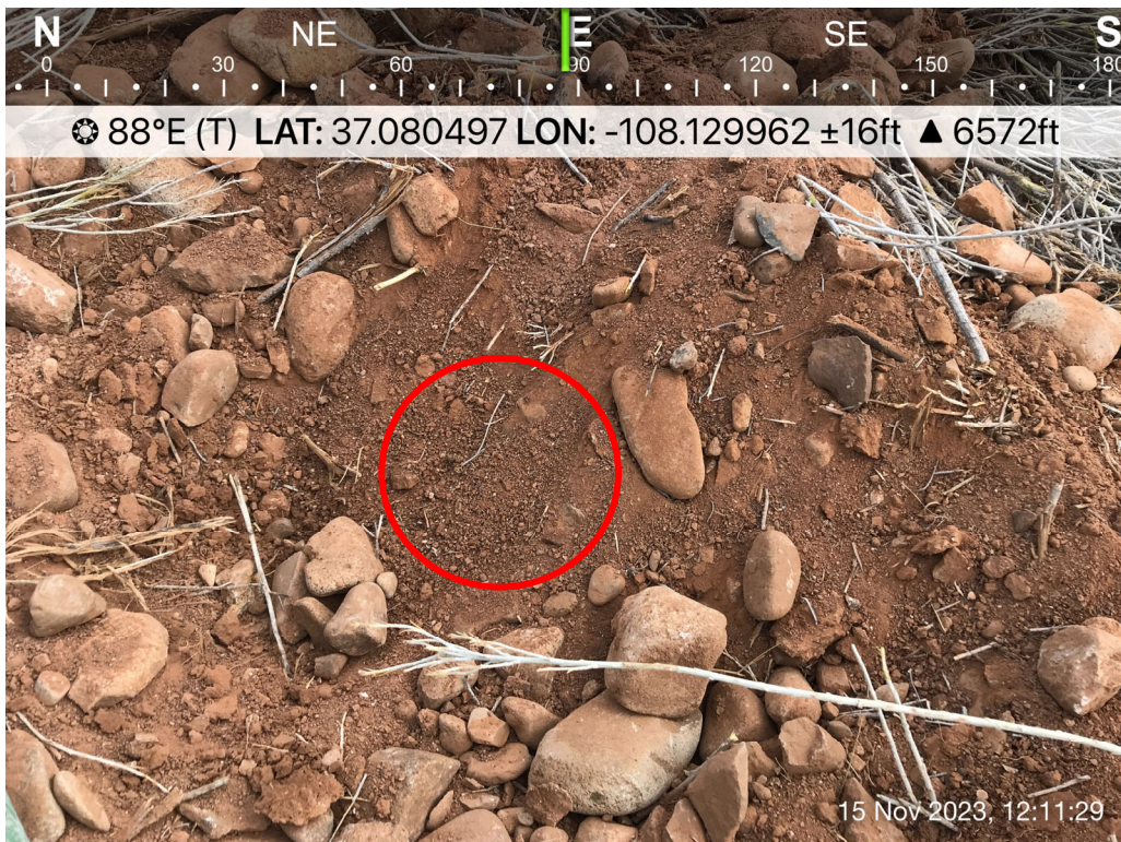
Photo 6: Field screening point at former meter house location, 11/15/2023.