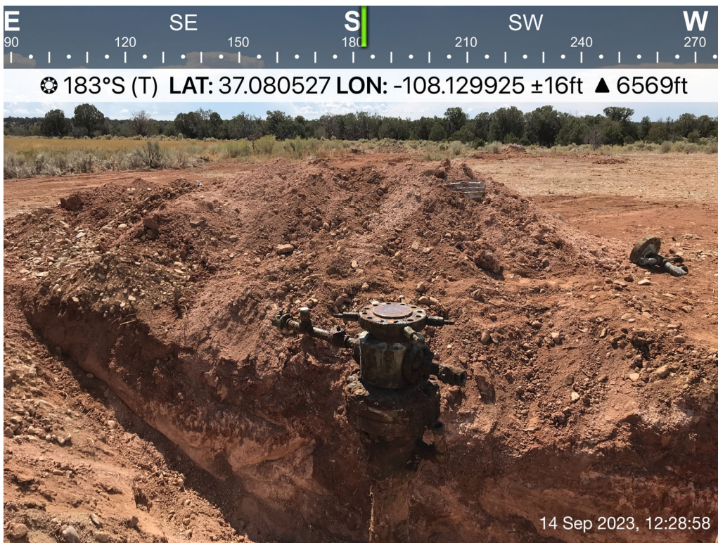
Photo 2: Turner (OWP) #4 P&A wellhead excavation and overall site, 9/14/2023.