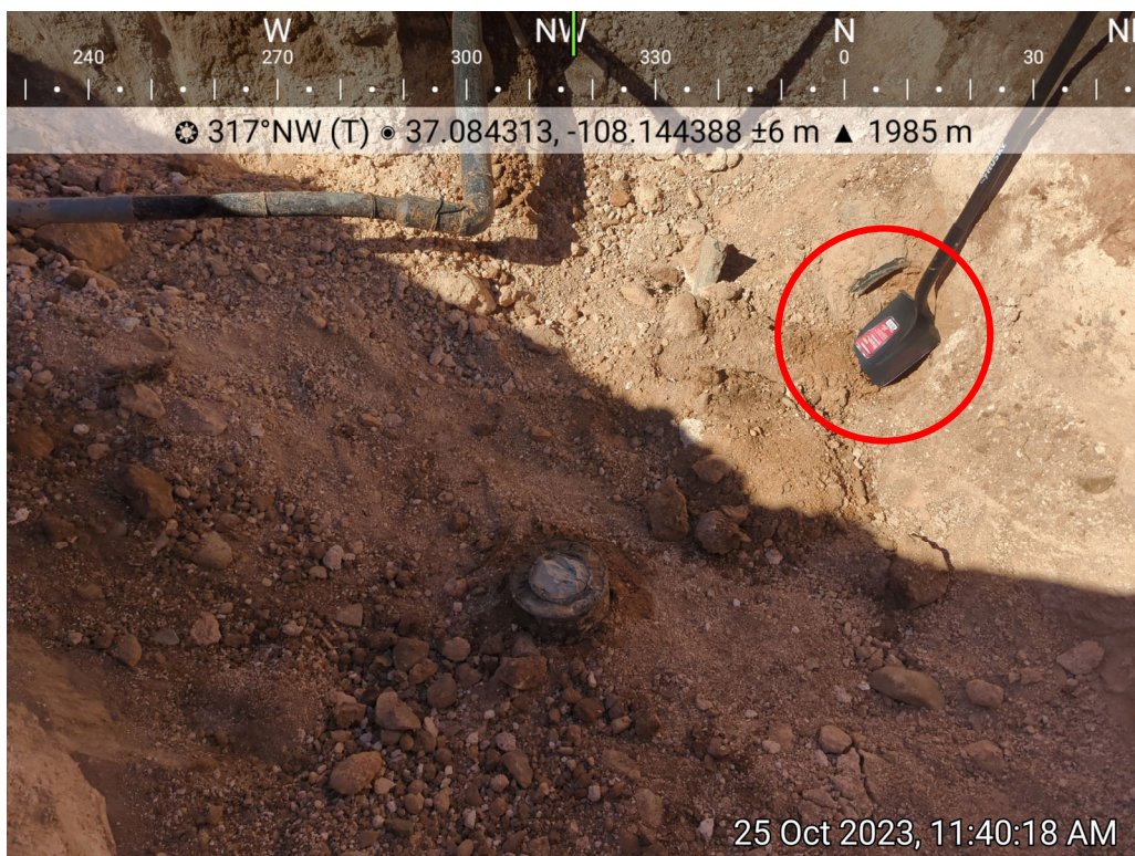
Photo 3: SS01 collected from Harris (OWP) #5 P&A wellhead excavation, 10/25/2023.