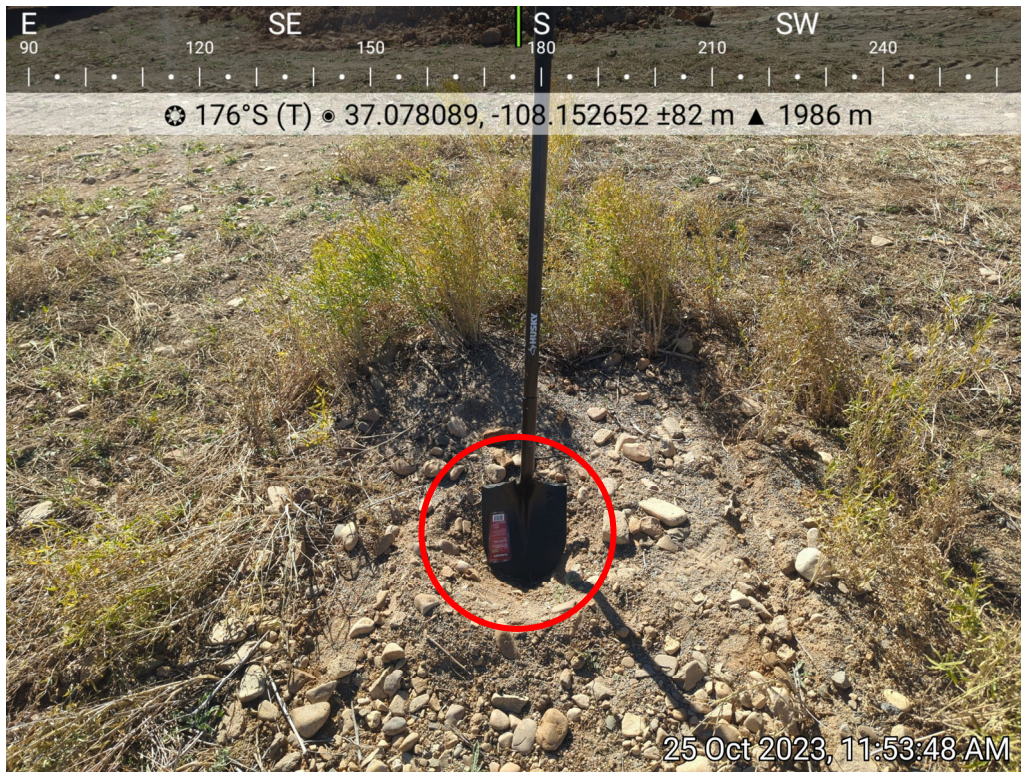
Photo 5: SS03 collected from former meter house location, 10/25/2023.