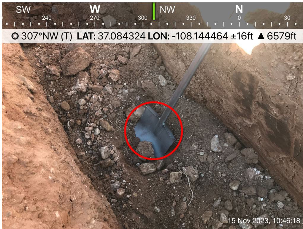
Photo 7: SS04 collected from former flowline excavation, 11/15/2023.