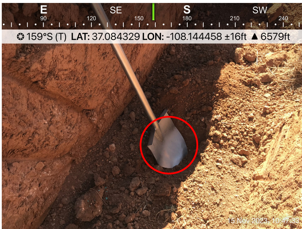
Photo 8: SS05 collected from former flowline excavation, 11/15/2023.