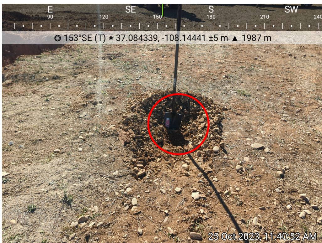
Photo 4: SS02 collected from former pumping unit location, 10/25/2023.