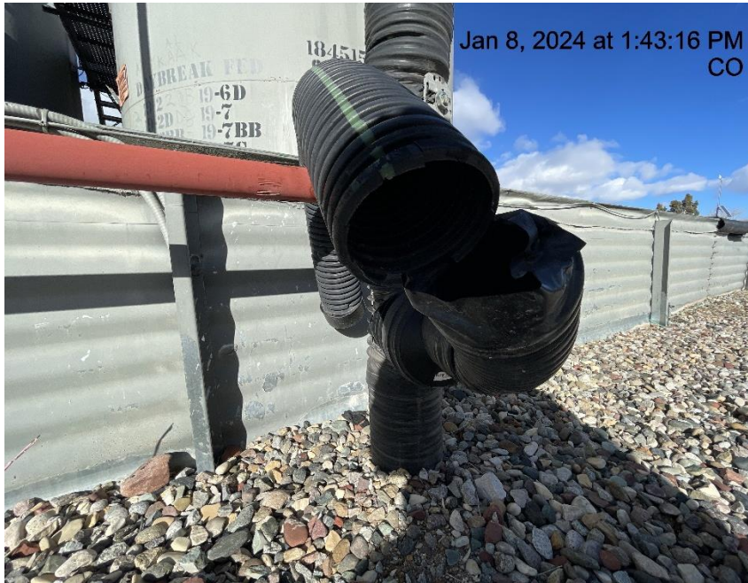
Photo # 2094 Flowline heating insulation open ended/wildlife hazard