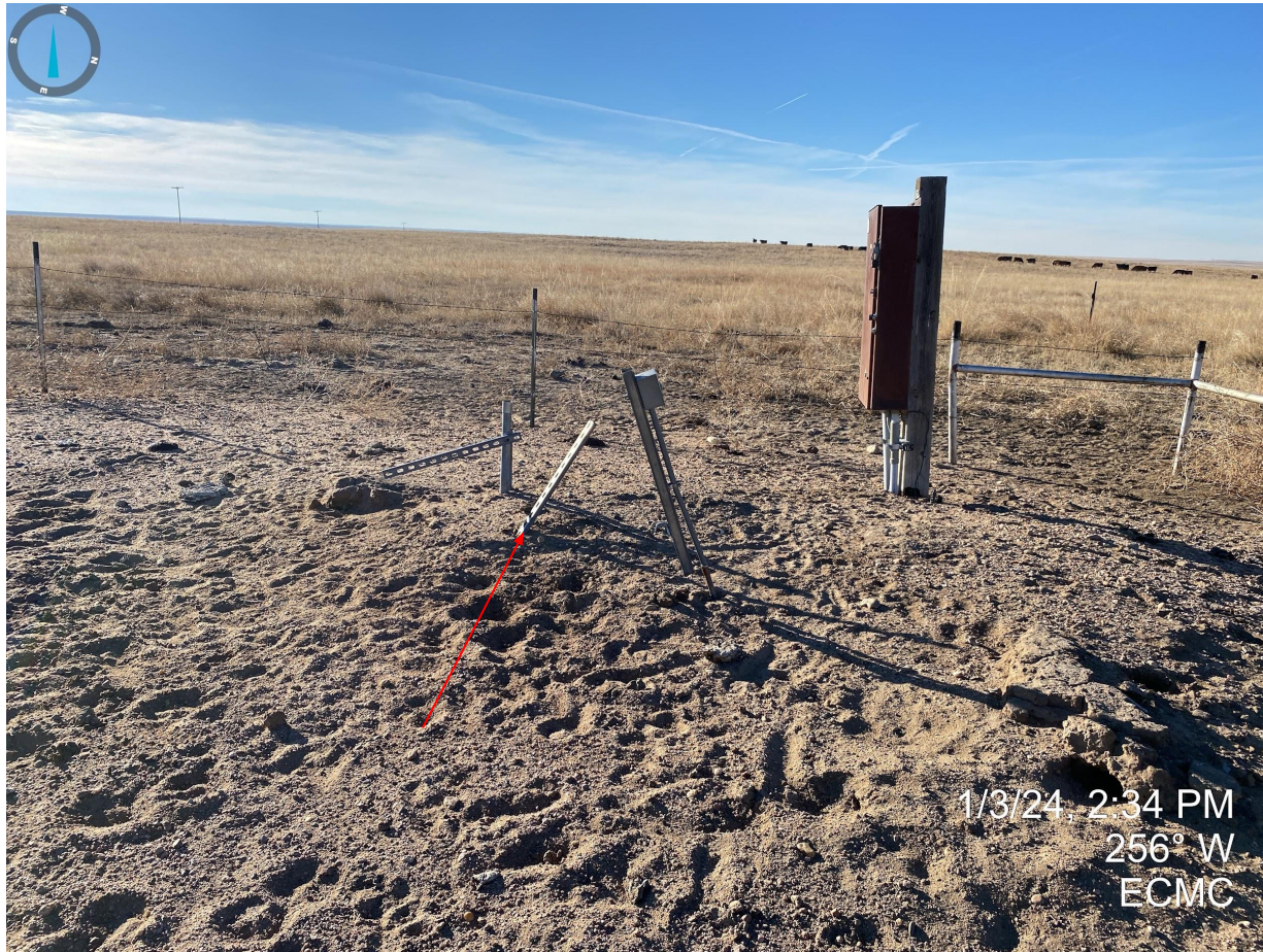
Photo 8. Unused equipment within fenced portion of the location.