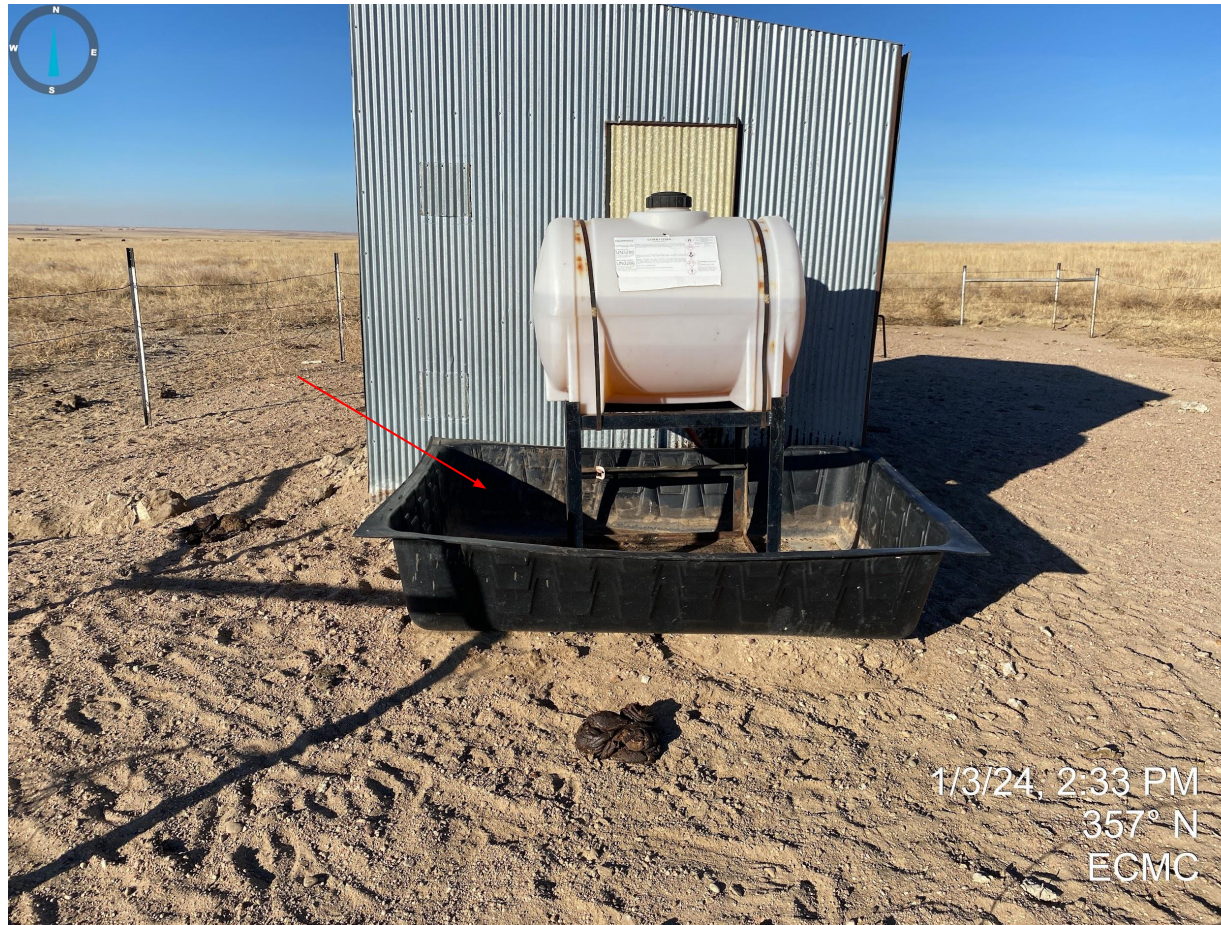
Photo 7. No wildlife netting observed around the secondary containment.