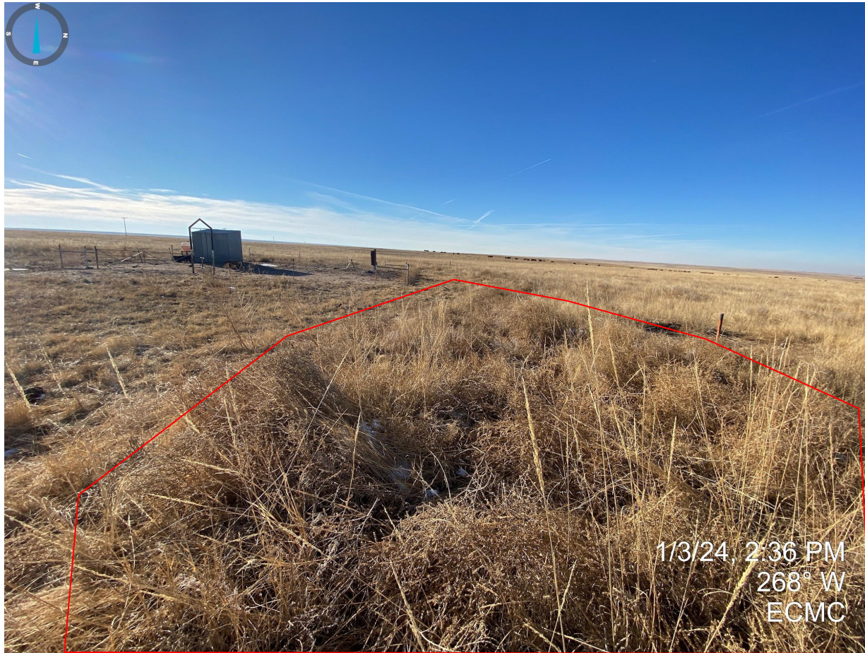
Photo 9. Undesirable vegetation (e.g. russian thistle and kochia) observed within the interim areas.