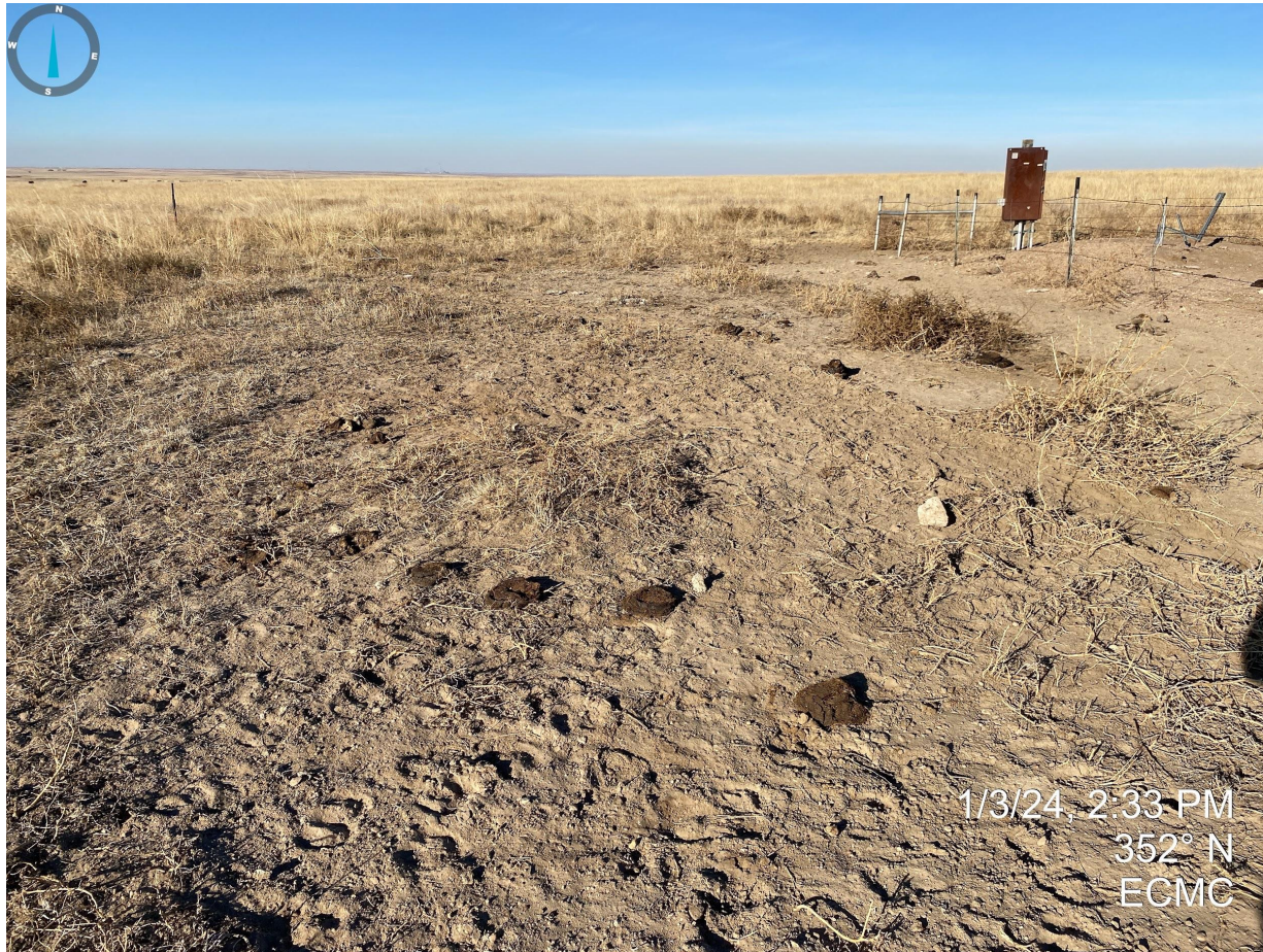
Photo 6. Unstabilized soils within the interim areas.