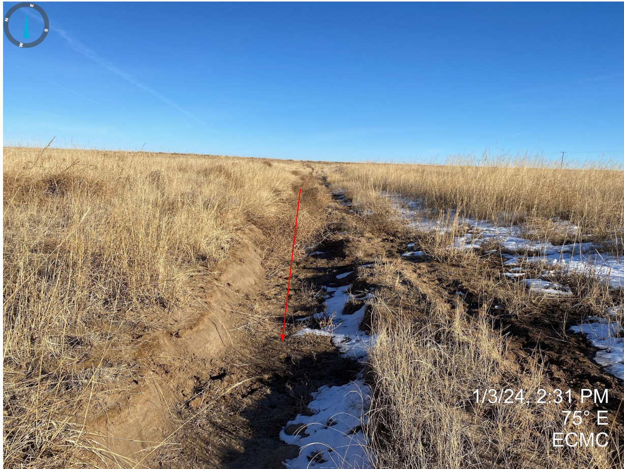
Photo 4. Erosion degradation along the access road.