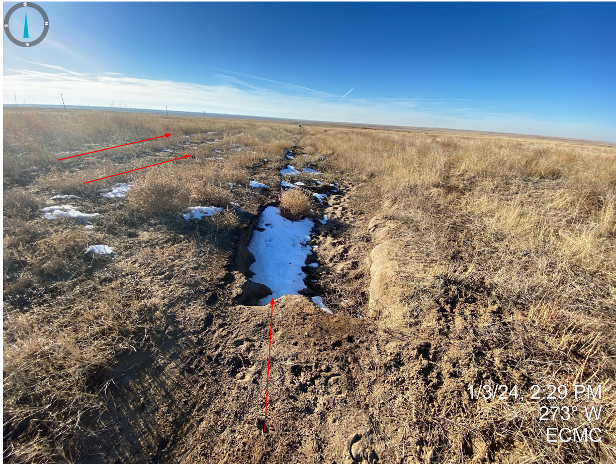
Photo 3. Erosion degradation along the access road. Also pictured, vehicle traffic occurring off the existing access road.