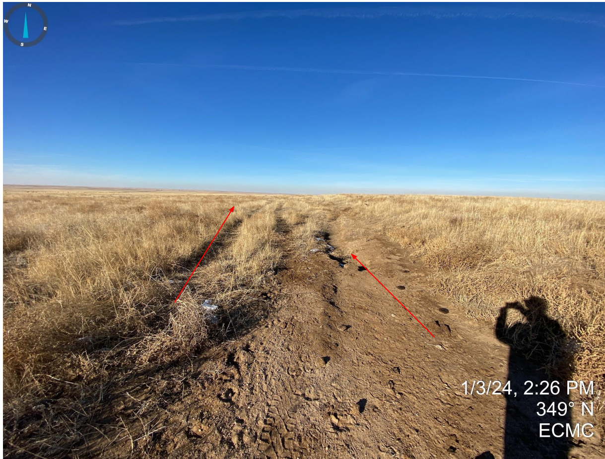
Photo 1. Erosion degradation occurring along the access road, with no apparent stormwater control measures observed. Additionally, vehicle traffic was observed alongside of the existing access road, in violation of Rule 1002.e.